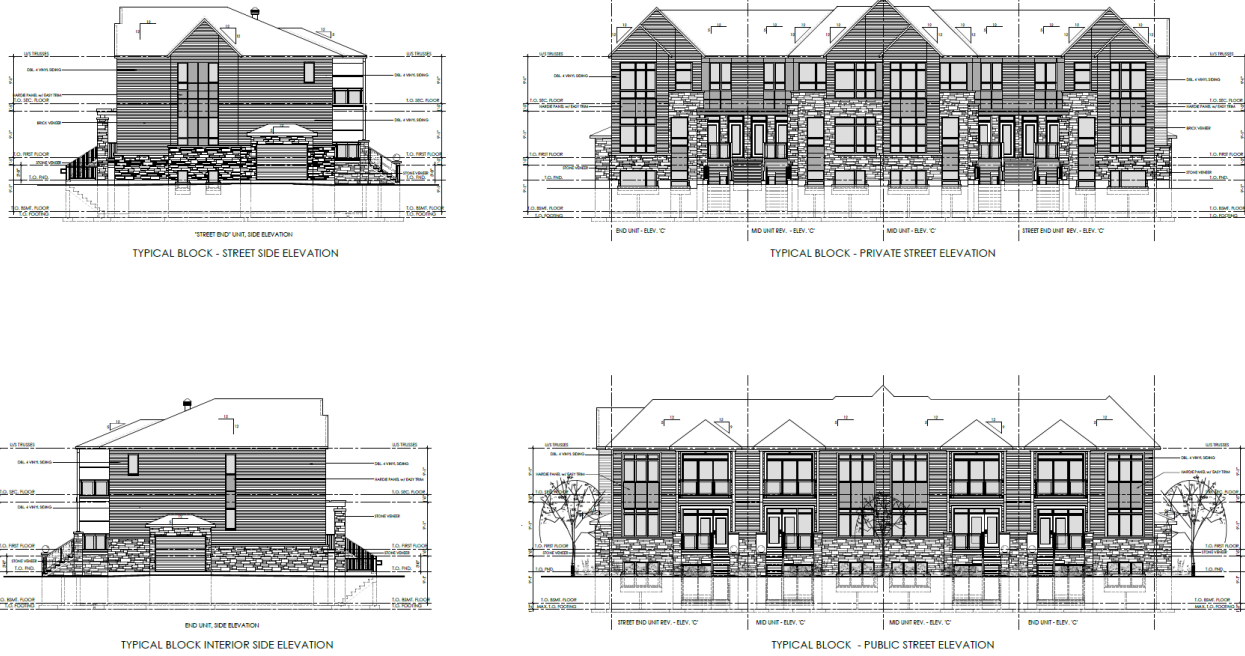
Figure2: Typical Elevations.