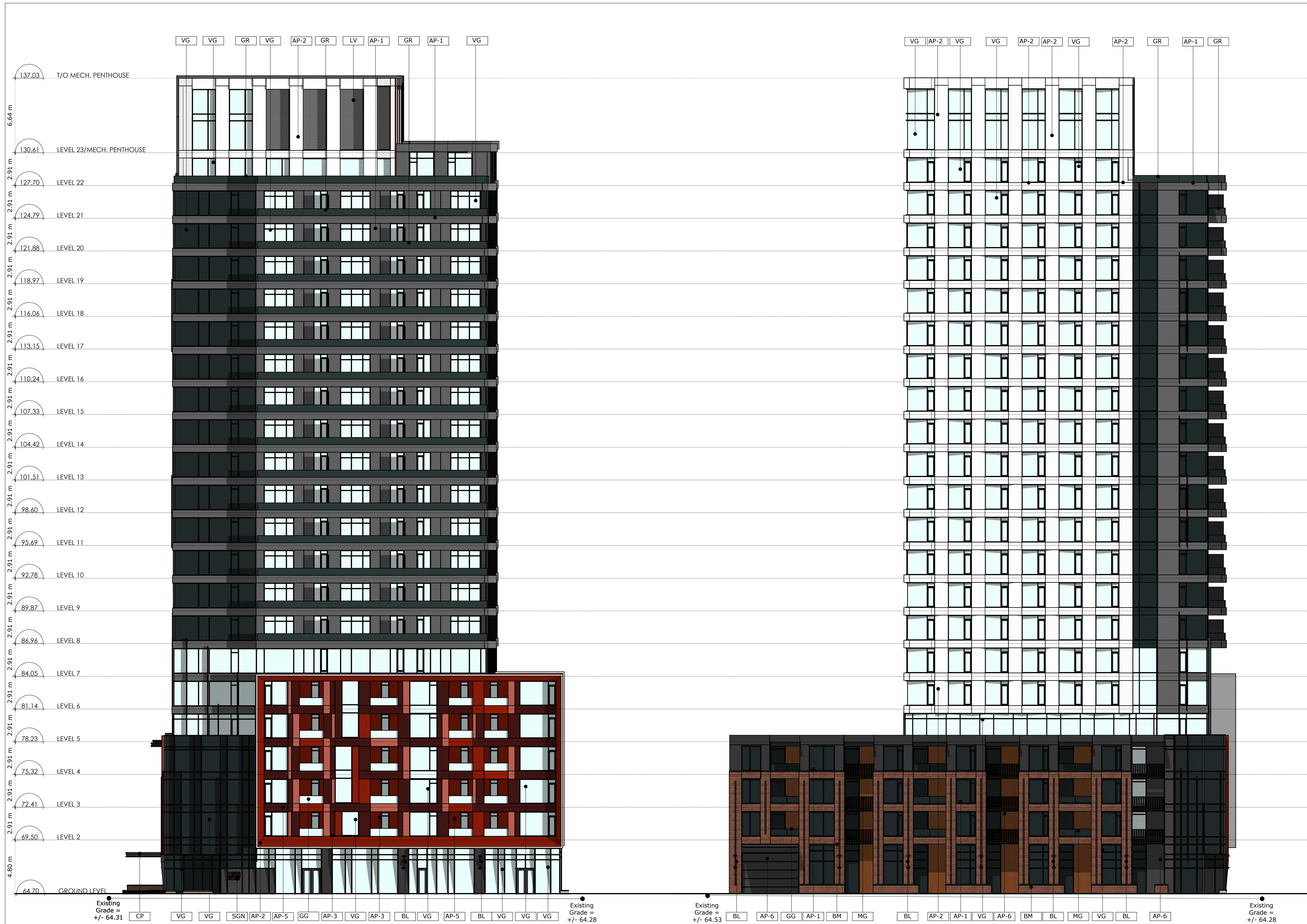
1 NORTH ELEVATION A3.00 Scale: 1: 150