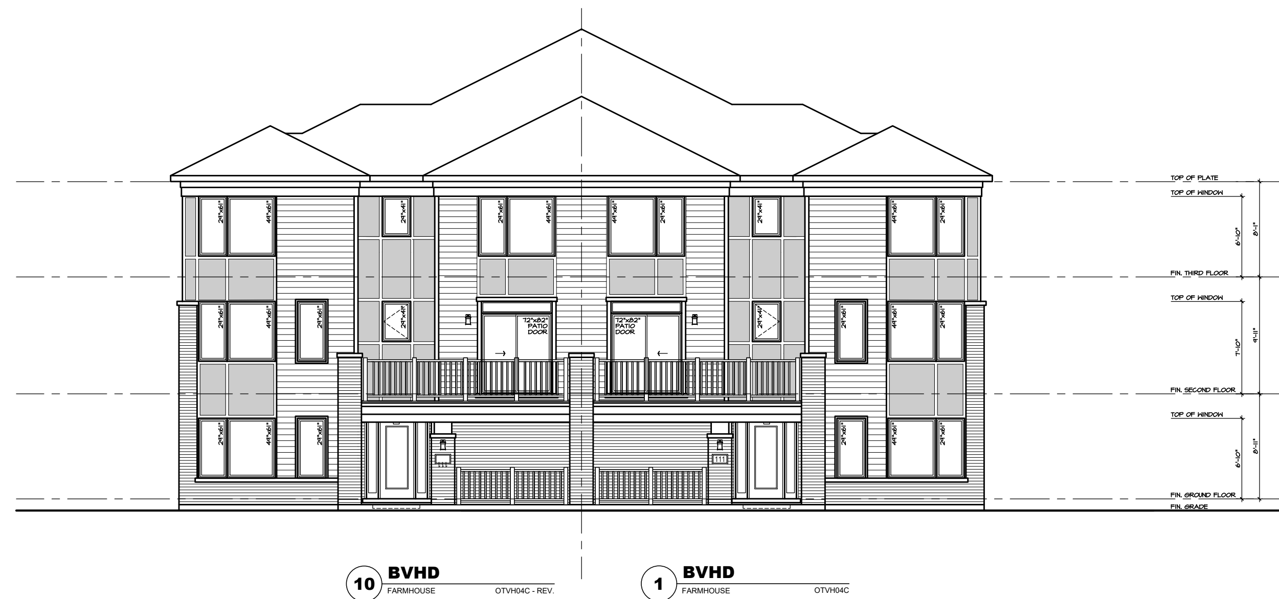
FLANKAGE ELEVATION 'TN'