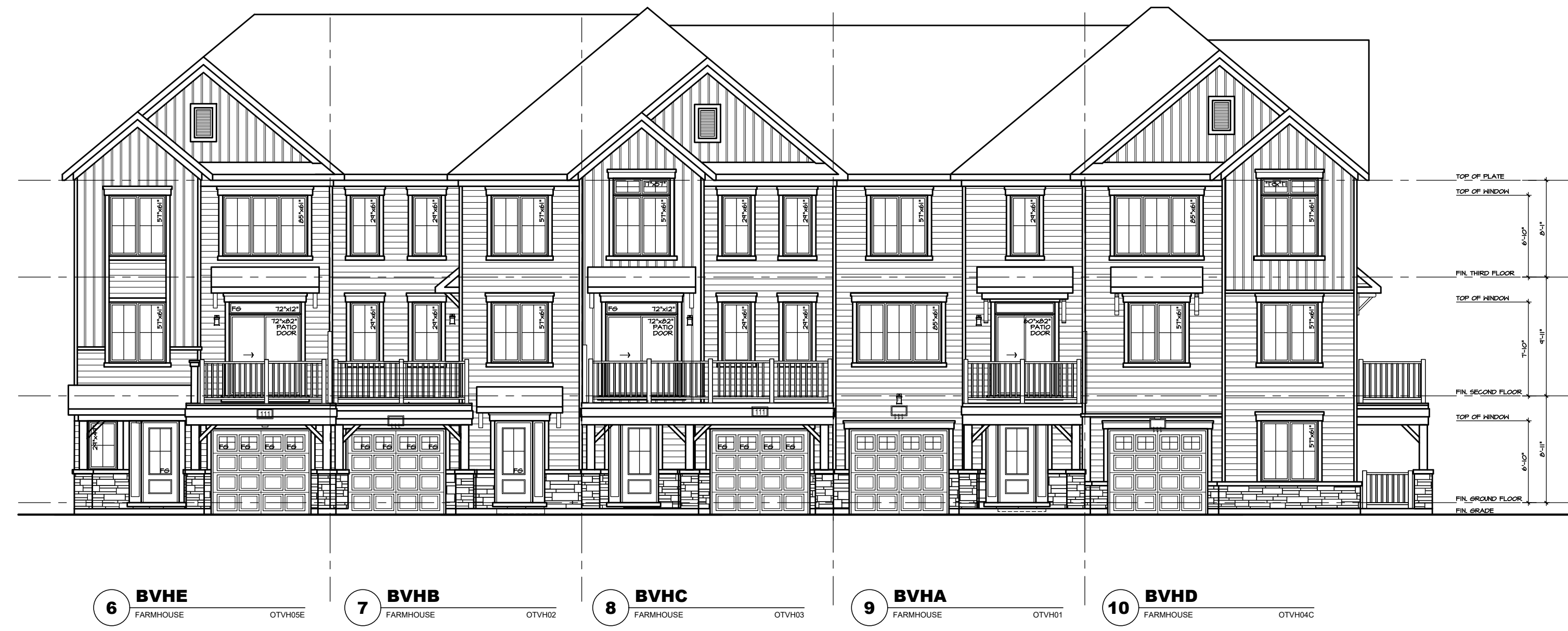
FRONT ELEVATION 'FH'