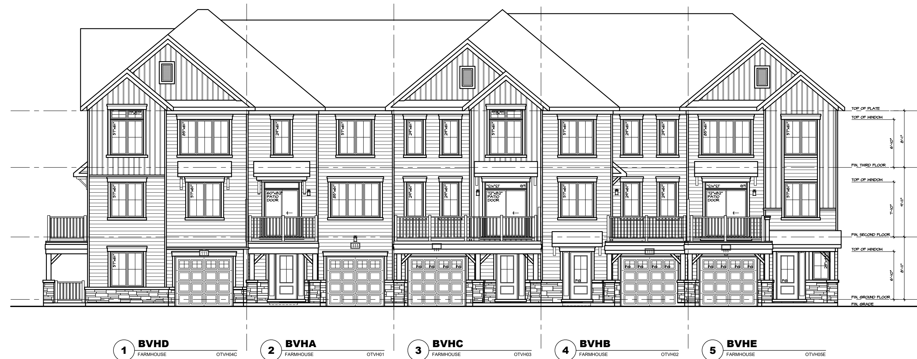
FRONT ELEVATION 'FH'