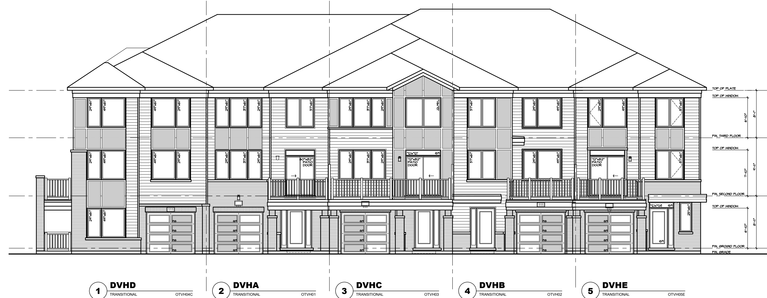
FRONT ELEVATION 'TN'

APPROVED By Lily Xu at 3:45 pm, Oct 21, 2024 Lily Xu LILY XU, MCIP, RPP MANAGER, DEVELOPMENT REVIEW SOUTH PLANNING, DEVELOPMENT, AND BUILDING SERVICES DEPARTMENT, CITY OF OTTAWA