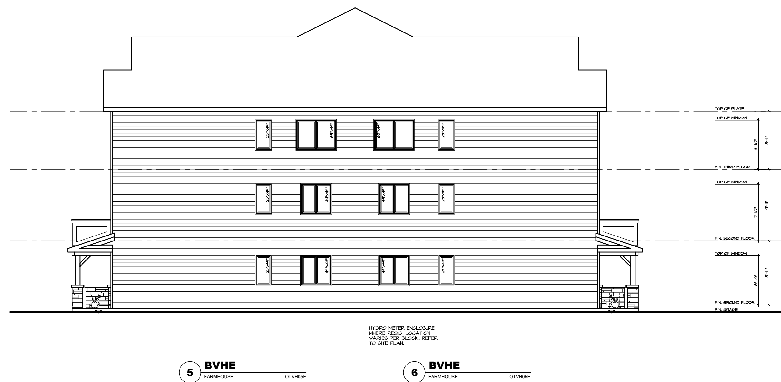
SIDE ELEVATION 'FH'

Q4 Architects Inc. retains the copyright in all drawings, plans, sketches, and all digital information. They may not be copied or used for any other projects or purposes or distributed without the written consent of Q4 Architects Inc.