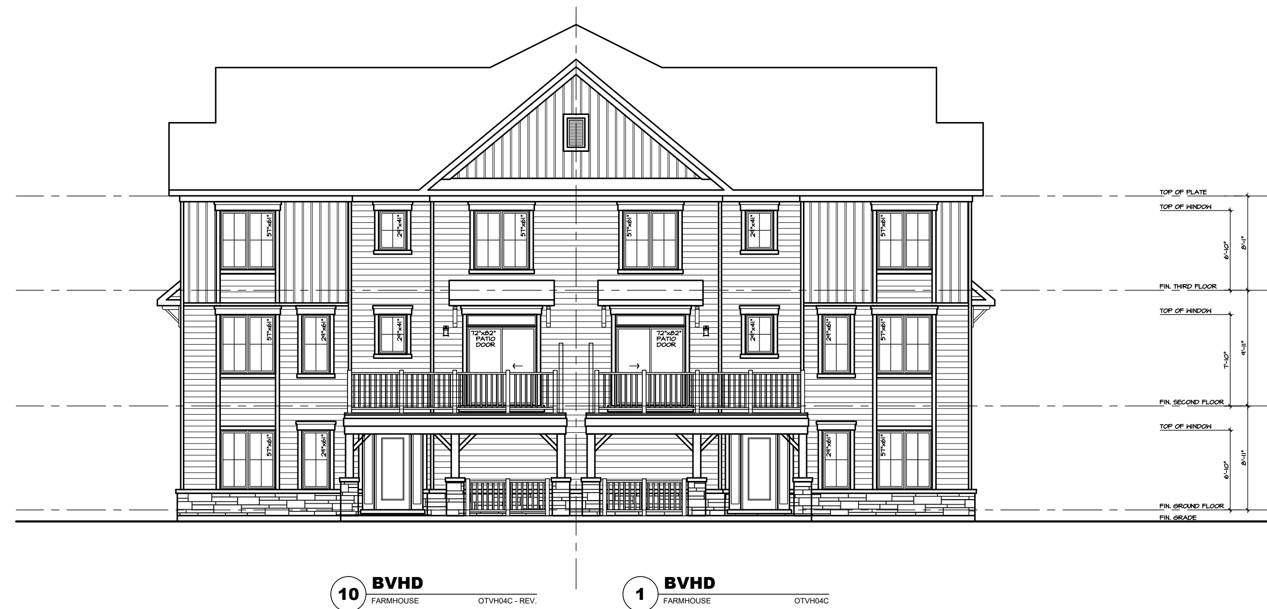
FLANKAGE ELEVATION 'FH'