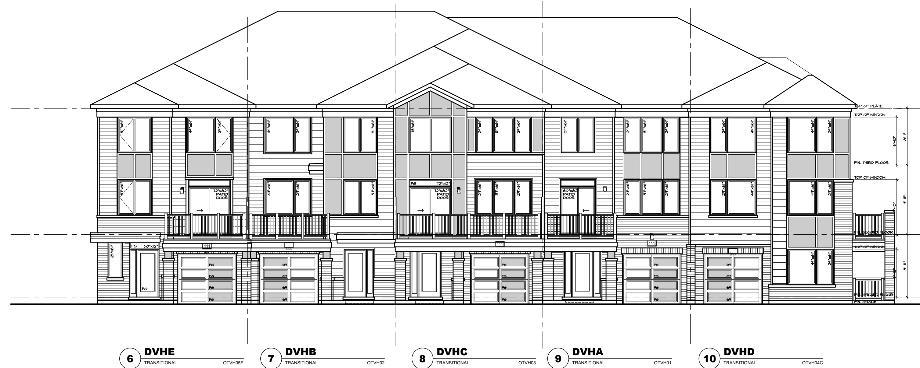
FRONT ELEVATION 'TN'