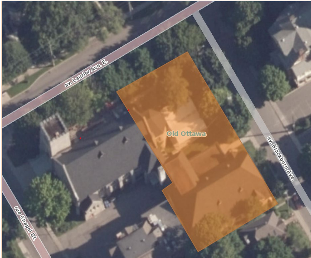
Figure 1.1: Key Plan of Site

A copy of the proposed Site Plan (dated March 21, 2023, with revision dated 2024) prepared by Linebox Studio architects is provided in Appendix A.1 . The proposed development is a nine-storey residential apartment building on a portion of the existing site. The Bate Memorial Hall is to be removed to accommodate the proposed building.