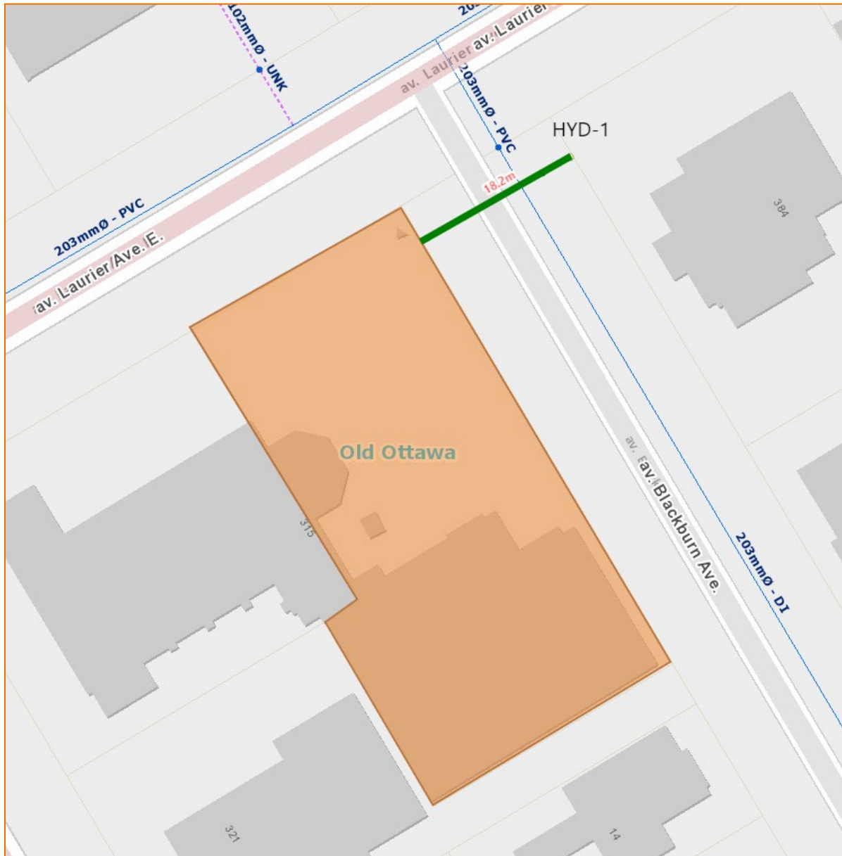
Figure 2.1: Existing Fire Hydrant Coverage

existing fire hydrant at the southeast corner of Laurier Avenue and Blackburn Avenue is within 45 m of this hydrant. The Siamese connection location and the hydrant location are shown on Drawing SSP-1 . The figure below also illustrates the Siamese connection and referenced hydrant location.