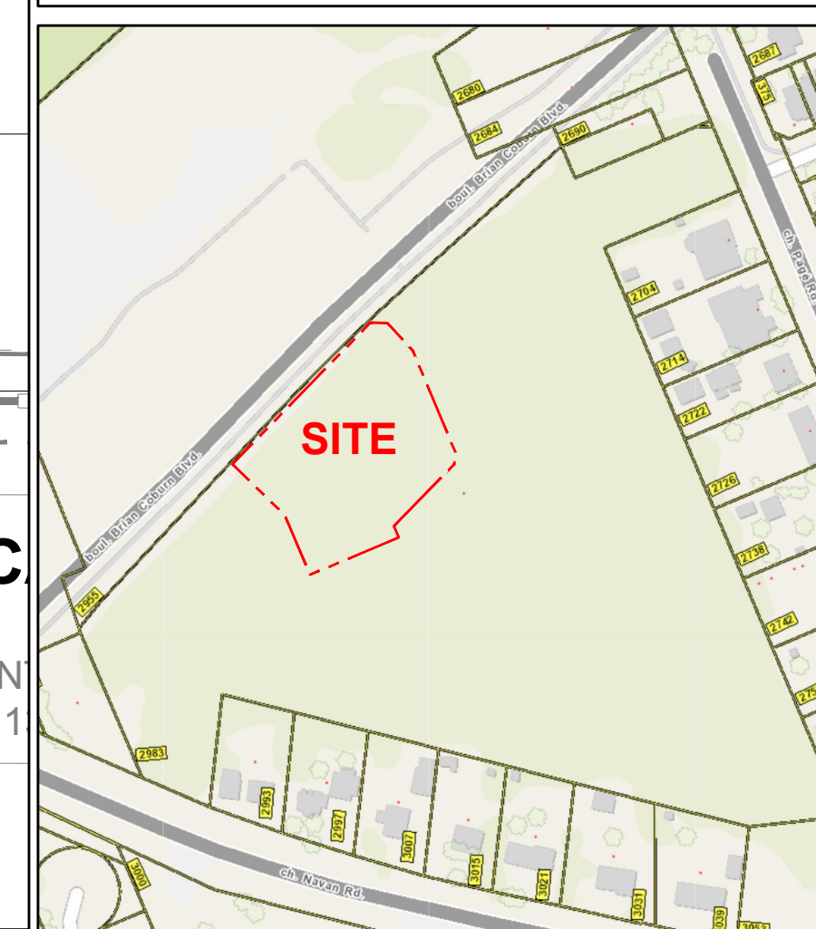
1 LANDSCAPE PLAN L.1 SCALE 1:200