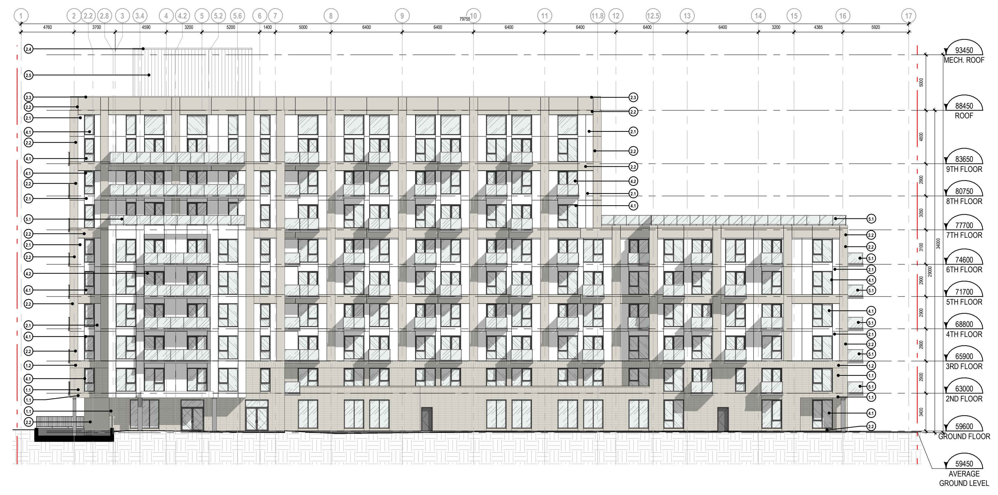
EAST ELEVATION 2 1 : 200 SPC-14

FILE NUMBER: D07-12-21-0015 PLAN NUMBER: 18597