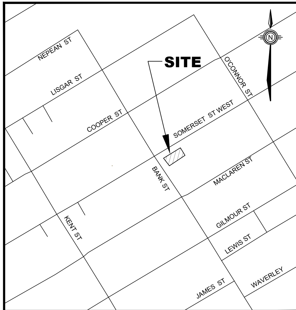
KEY MAP SCALE: N.T.S.