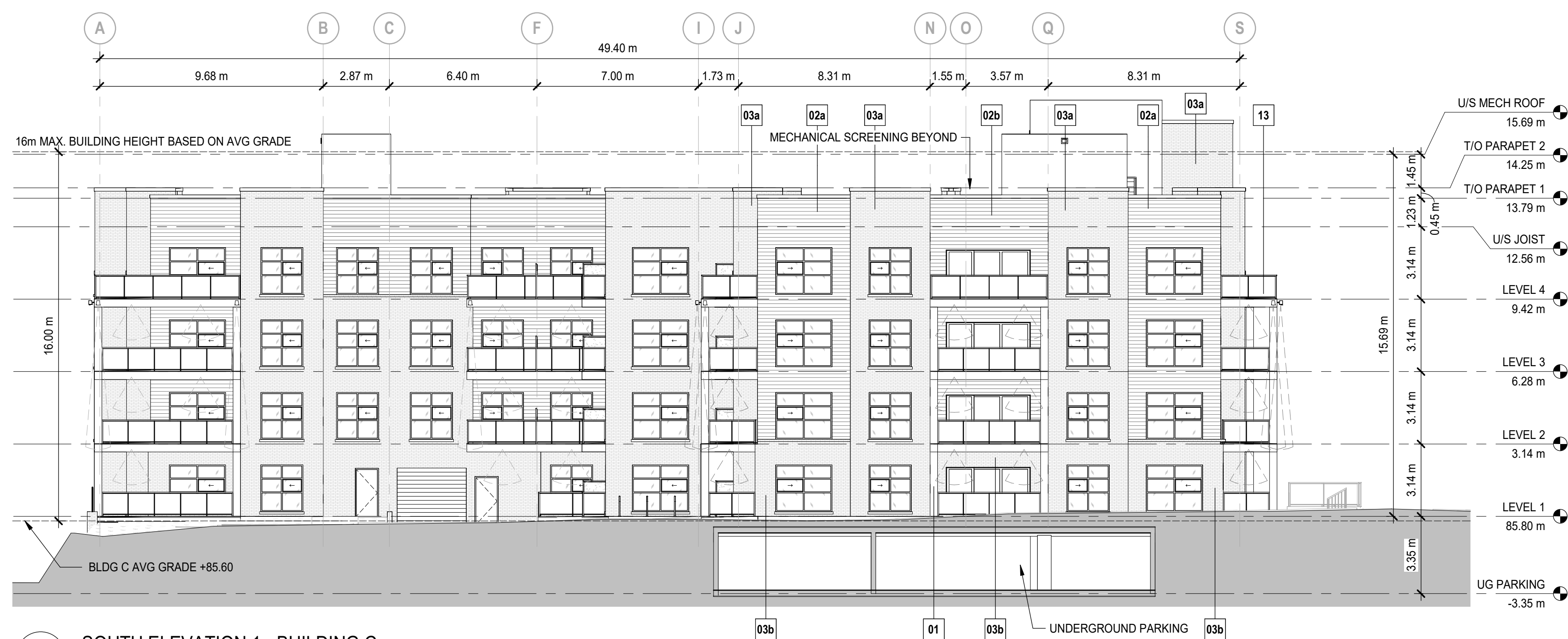
2 SOUTH ELEVATION 1 - BUILDING C