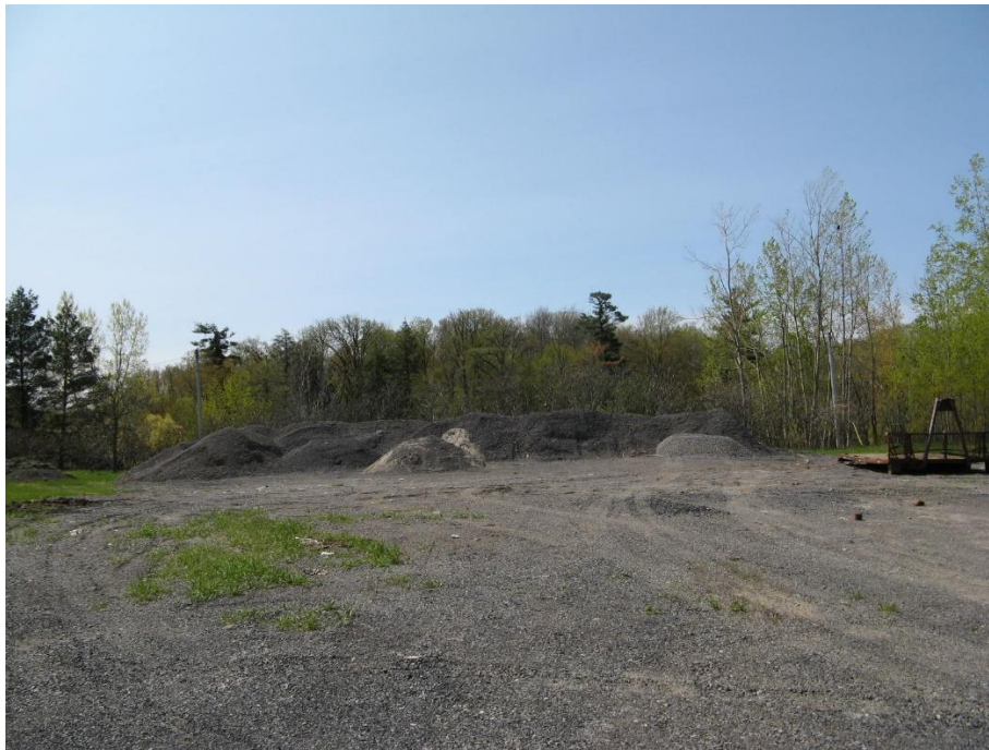
Photo 1 – Site looking south from just south of Bill Leathem Drive, with off-site trees north of the Clarke Bellinger Environmental Facility in the background

The largest trees on the north side of the Clarke Bellinger Environmental Facility are Scot's pine and white spruce up to 40cm dbh. The closest of these trees are approximately 40 metres to the southeast of the site.