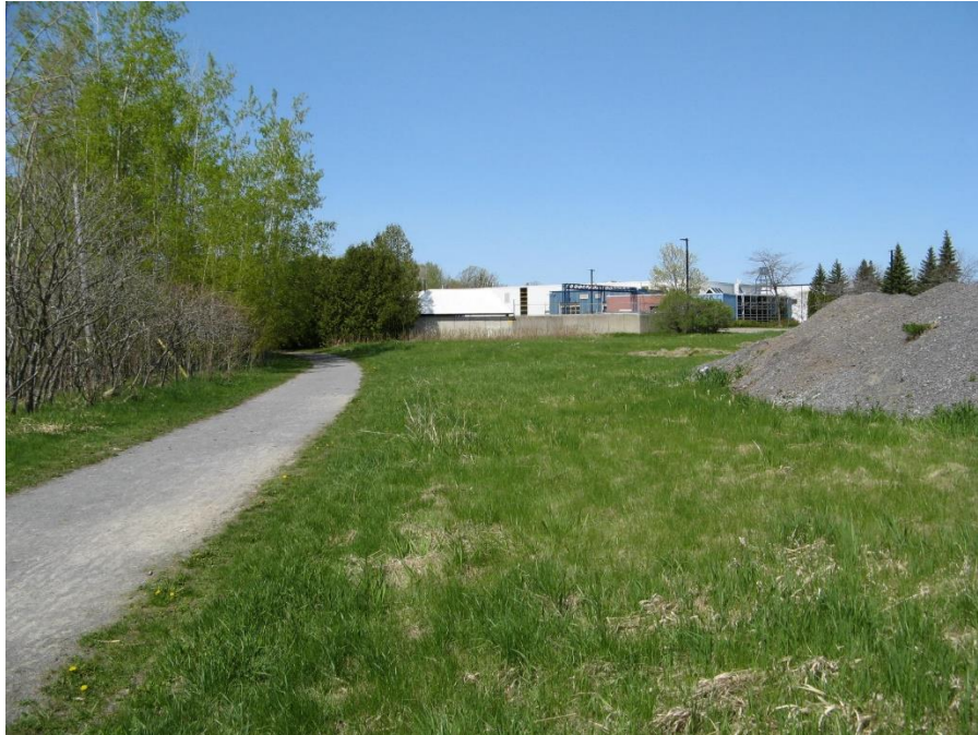
Photo 4 – South property line, with on-site gravel piles to the right and off-site stonedust access road/pathway and poplar and sumac plantings to the left. View looking west