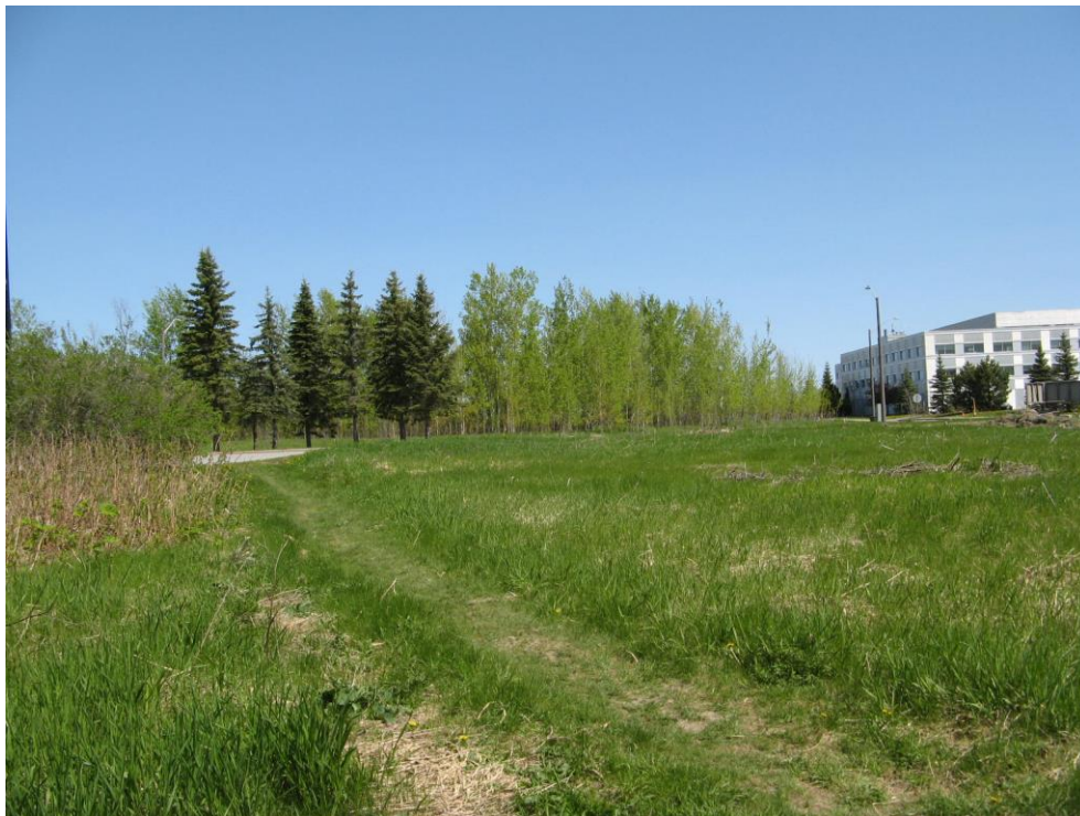
Photo 5 – The west property line and adjacent lands with view looking north from the southwest corner to the conifers to be retained