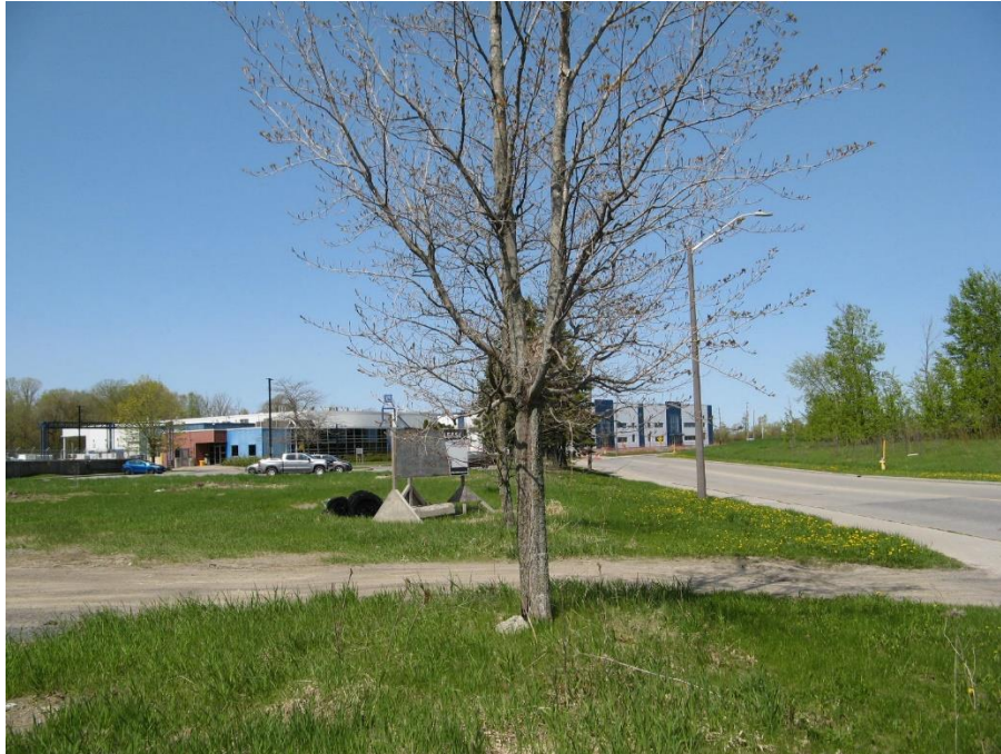
Photo 2 – Planted maple and hackberry (mostly hidden) trees along north edge of the site. View looking west from the northeast corner, with Bill Leathem Drive on the right