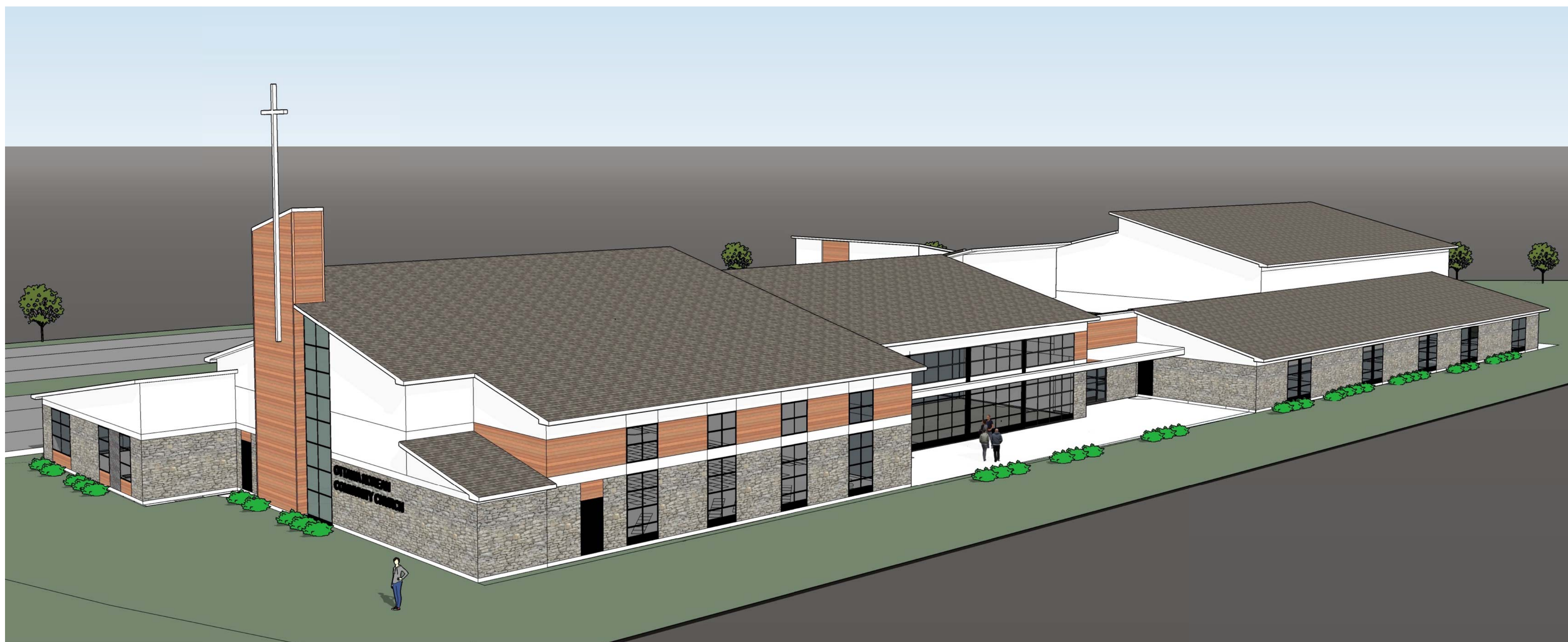
AERIAL VIEW OF SOUTHWEST FACADE