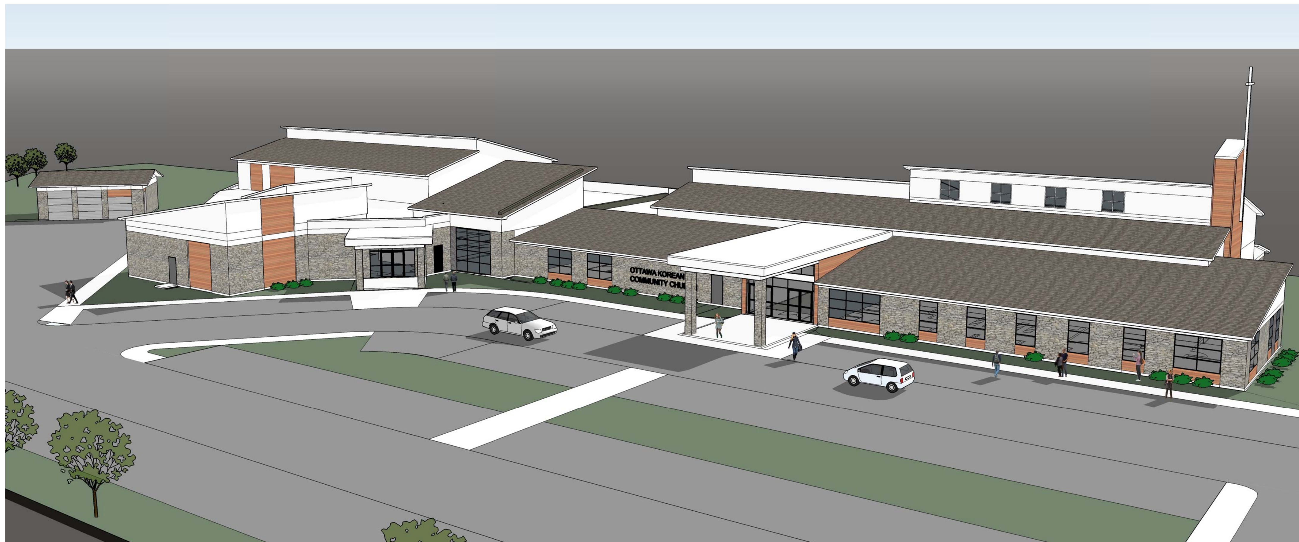
AERIAL VIEW OF NORTHEAST FACADE