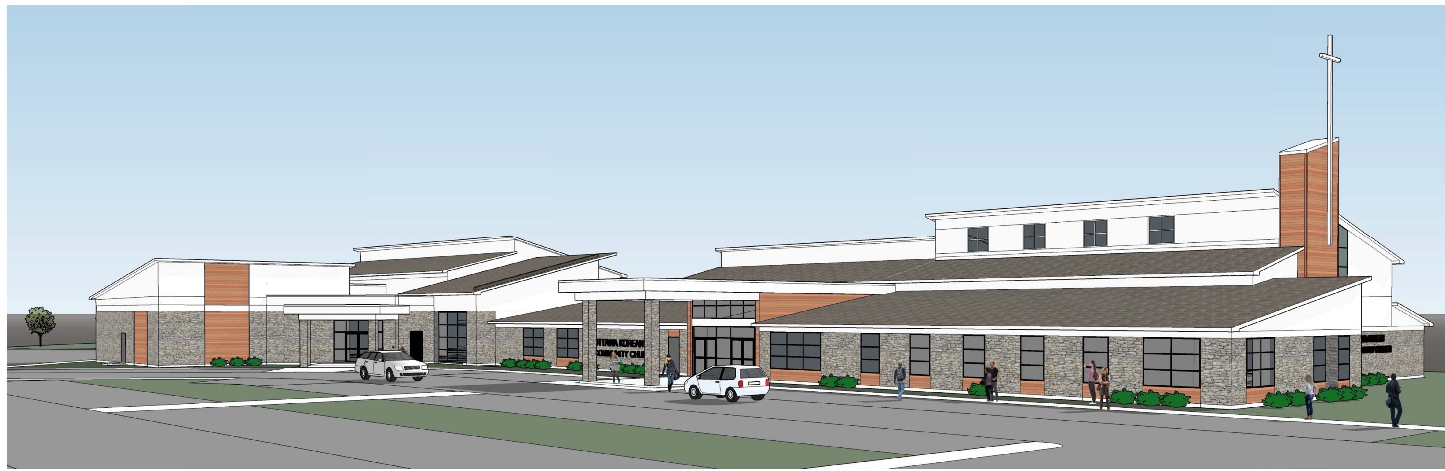
VIEW OF SOUTHWEST FACADE FROM BORRISOKANE ROAD