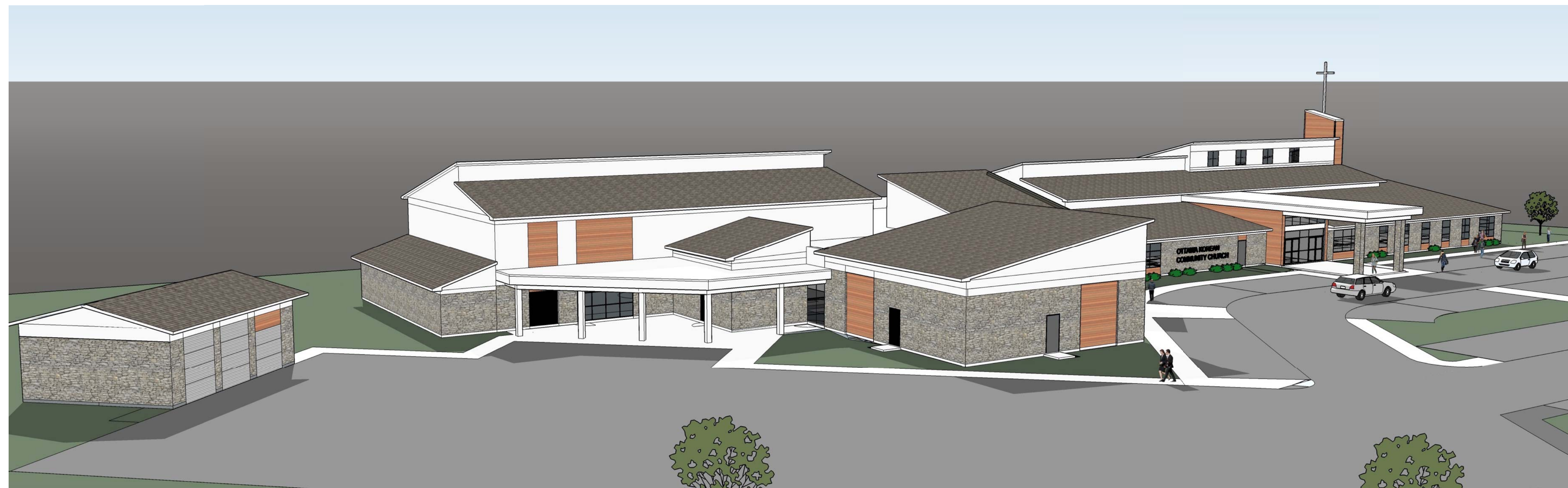
VIEW OF NORTHEAST FACADE