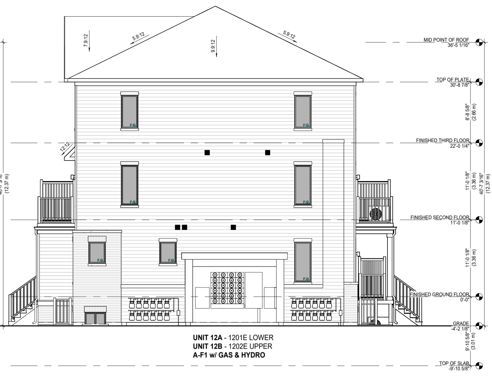
4 24 UNIT BLOCK - RIGHT ELEVATION A 1/8" = 1'-0"