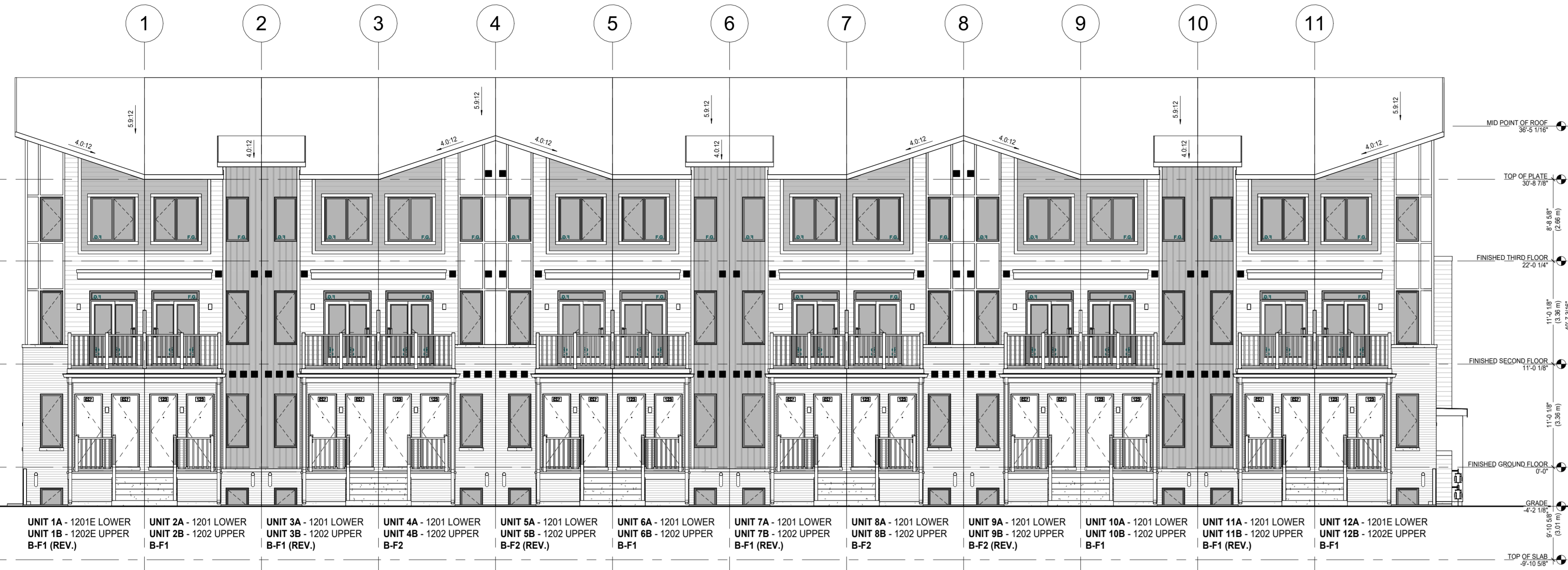
1 24 UNIT BLOCK - FRONT ELEVATION B 1/8" = 1'-0"

Blocks 2, 5, 6 and will have both Typical front and rear elevations. Elevation style to vary between blocks.