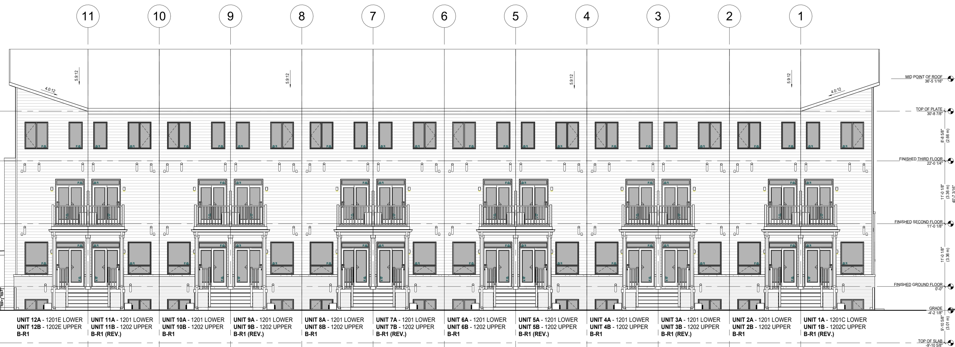
2 24 UNIT BLOCK - REAR ELEVATION B 1/8" = 1'-0"