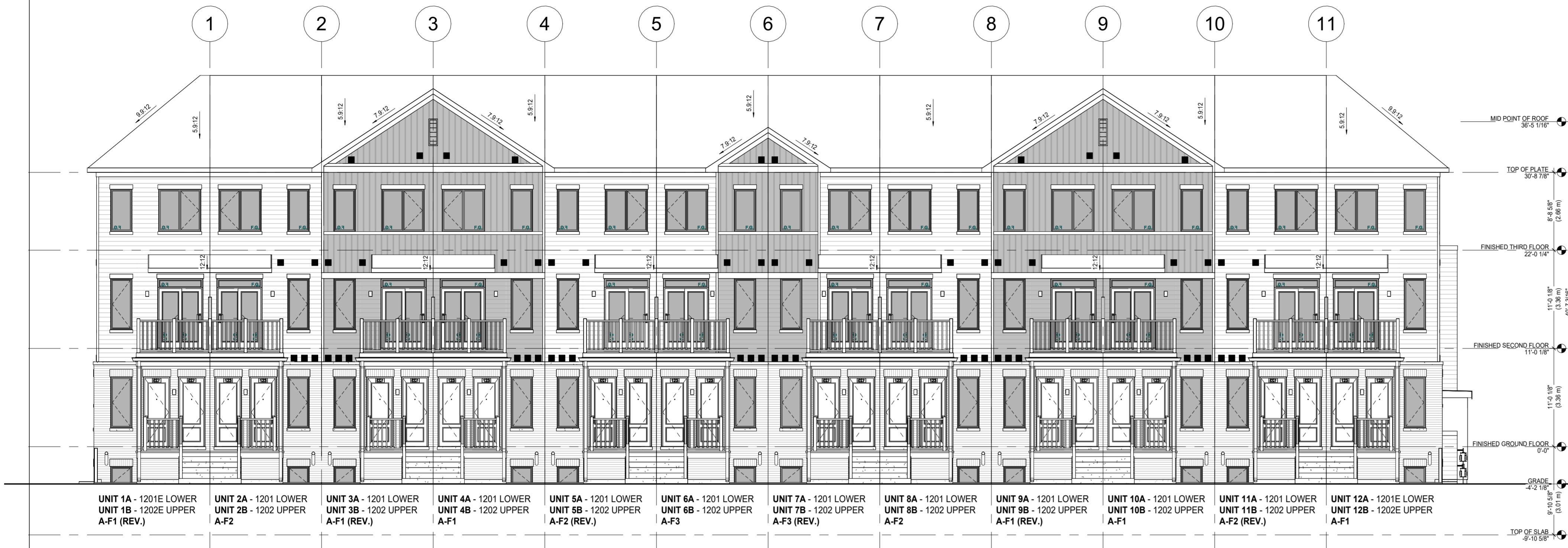
1 24 UNIT BLOCK - FRONT ELEVATION A 1/8" = 1'-0"

Blocks 2, 5, 6 and will have both Typical front and rear elevations. Elevation style to vary between blocks.