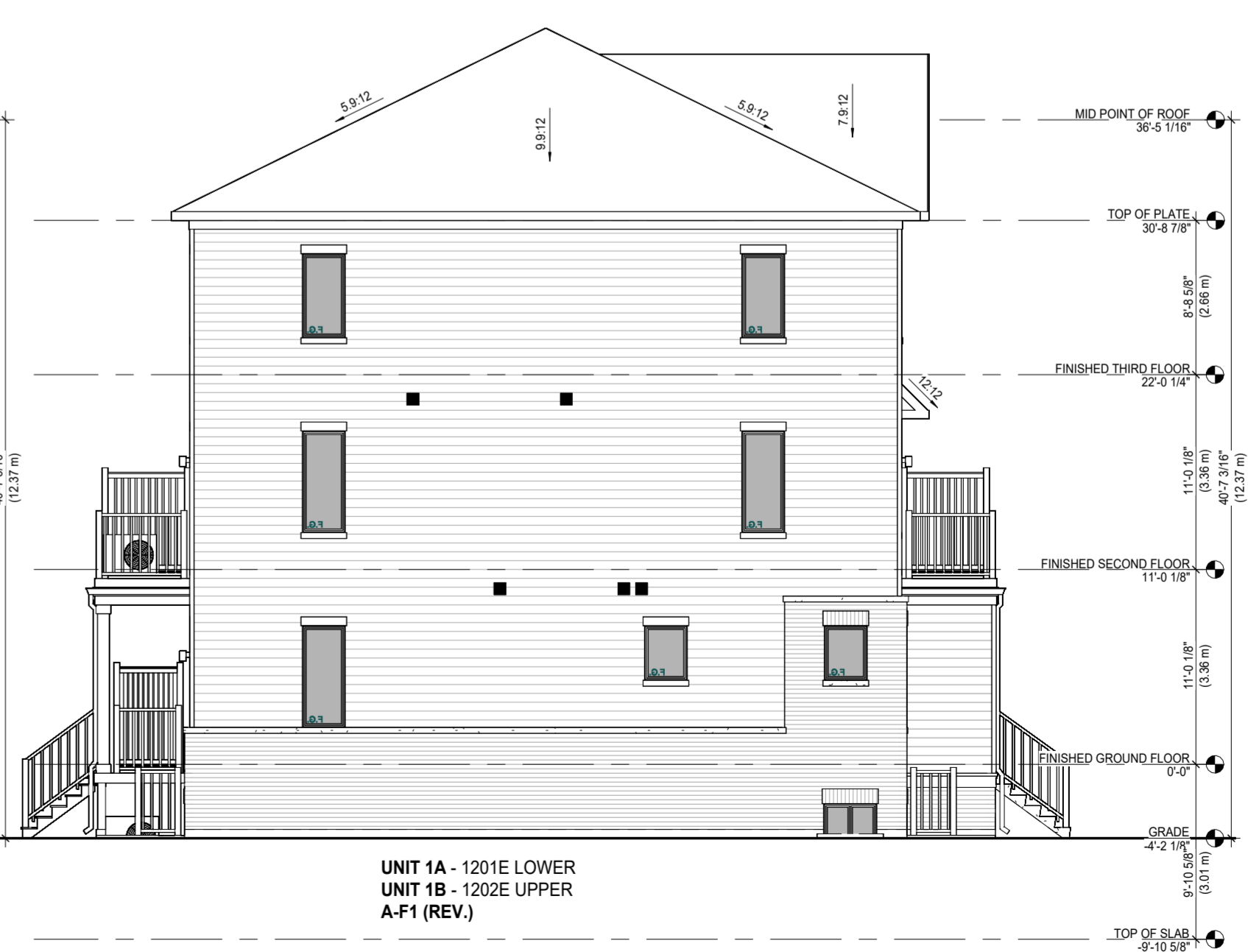
3 24 UNIT BLOCK - LEFT ELEVATION A 1/8" = 1'-0"

1 ISSUED FOR CLIENT REVIEW 2024.08.20 SDW