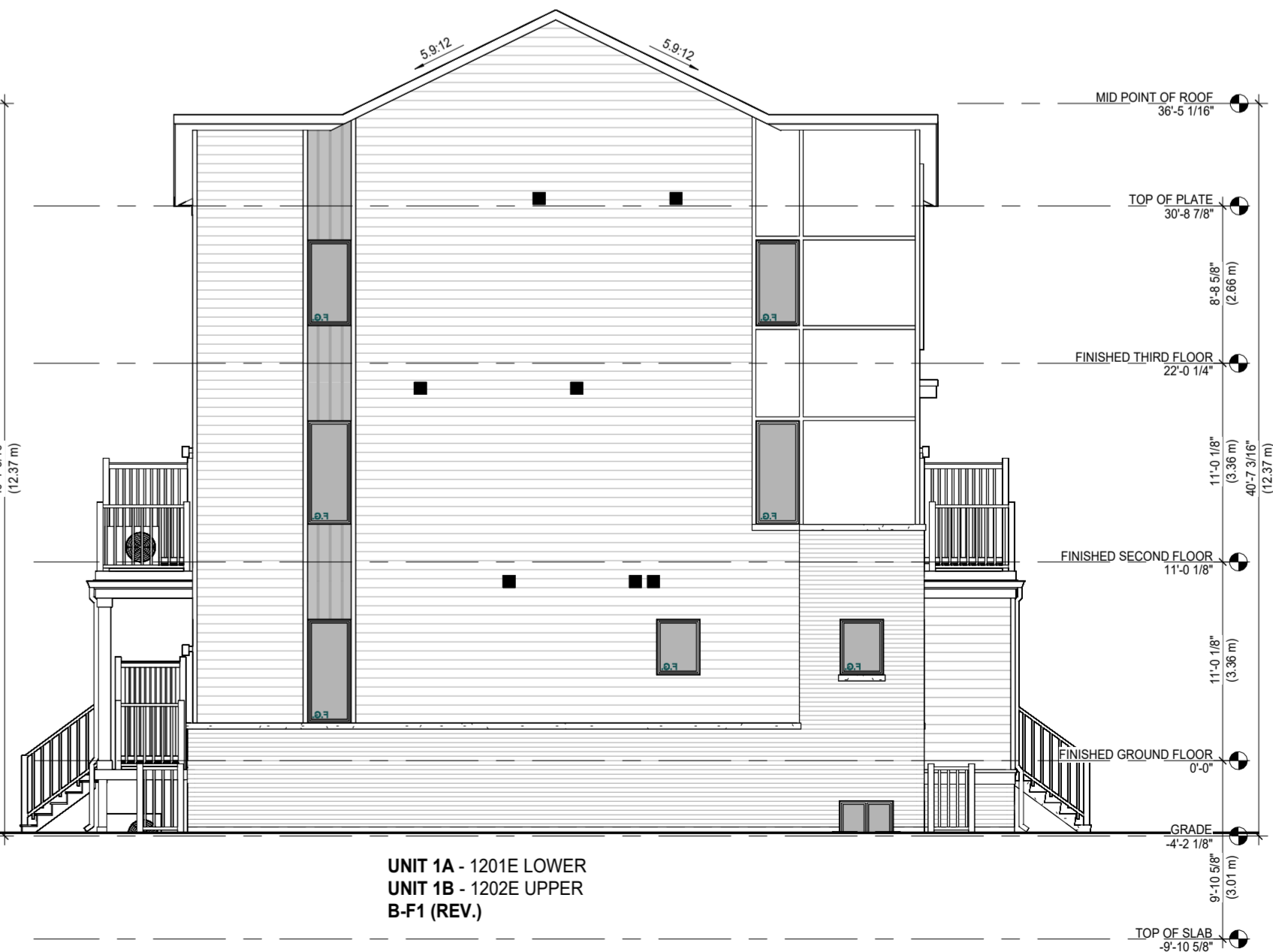
3 24 UNIT BLOCK - LEFT ELEVATION B 1/8" = 1'-0"

1 ISSUED FOR CLIENT REVIEW 2024.08.20 SDW