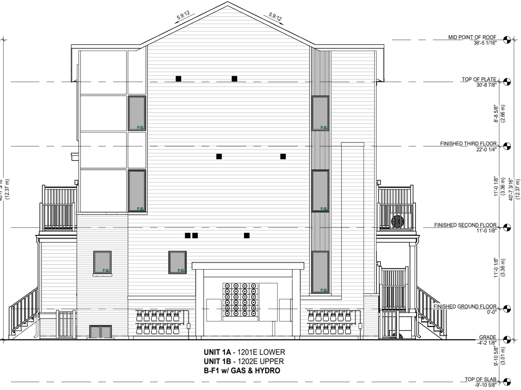
4 24 UNIT BLOCK - RIGHT ELEVATION B 1/8" = 1'-0"