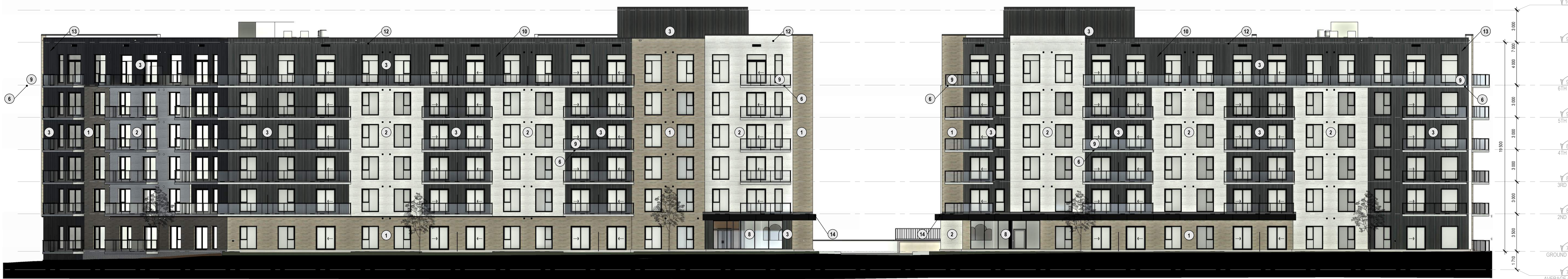
SOUTH ELEVATION 1:150