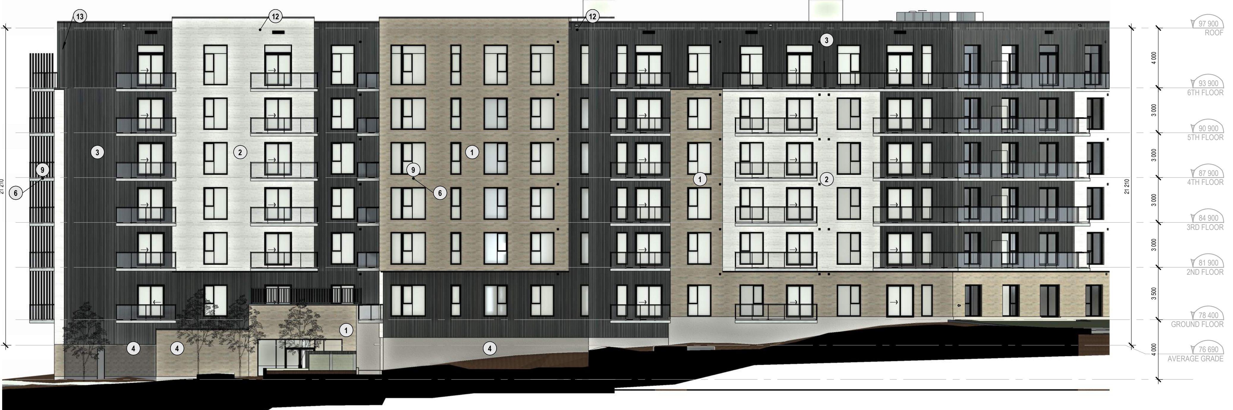
SOUTH WEST ELEVATION 1:150