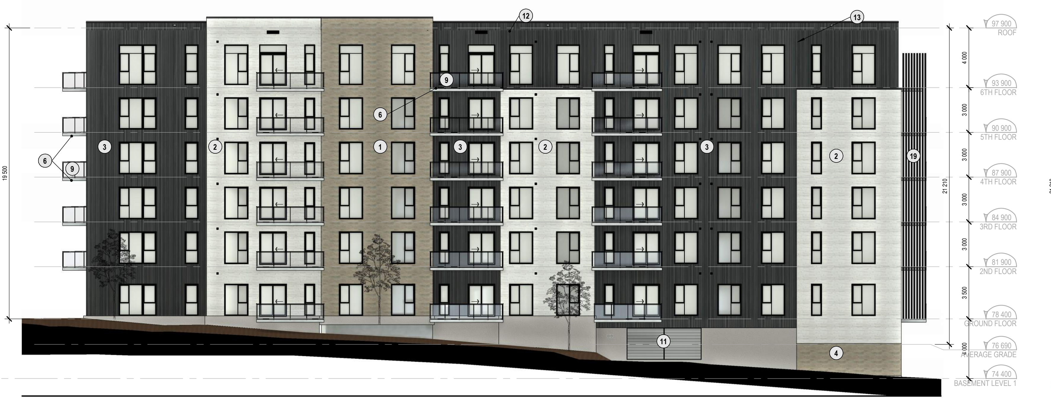
EAST ELEVATION 1:150