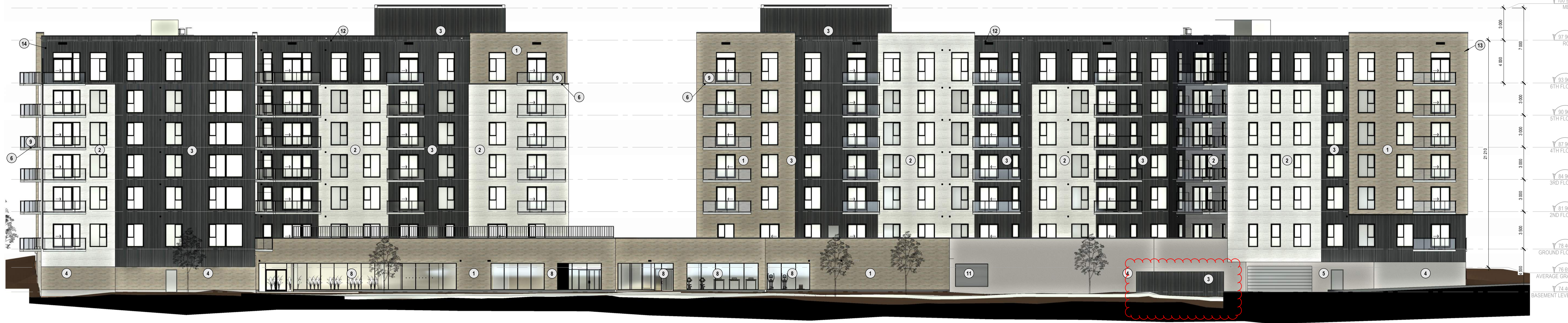
NORTH ELEVATION 1:150