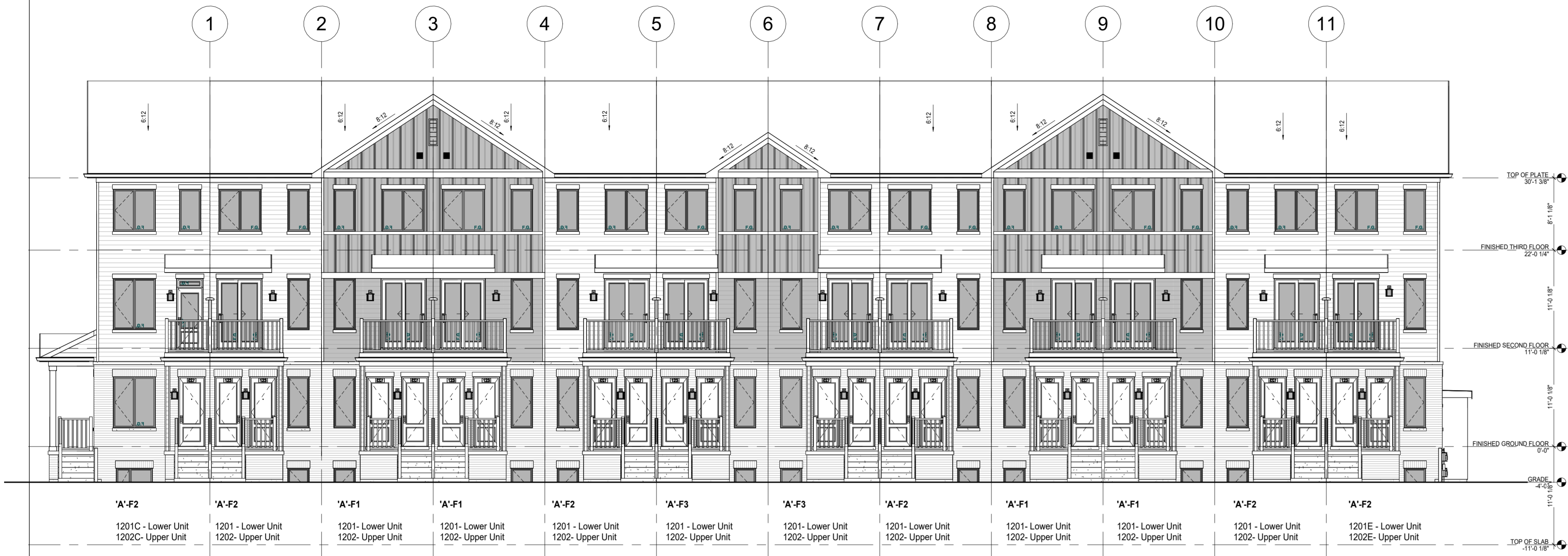
1 24 UNIT BLOCK - FRONT ELEVATION 1/8" = 1'-0"

Q4 Architects Inc. retains the copyright in all drawings, plans, sketches, and all digital information. They may not be copied or used for any other projects or purposes or distributed without the written consent of Q4 Architects Inc.