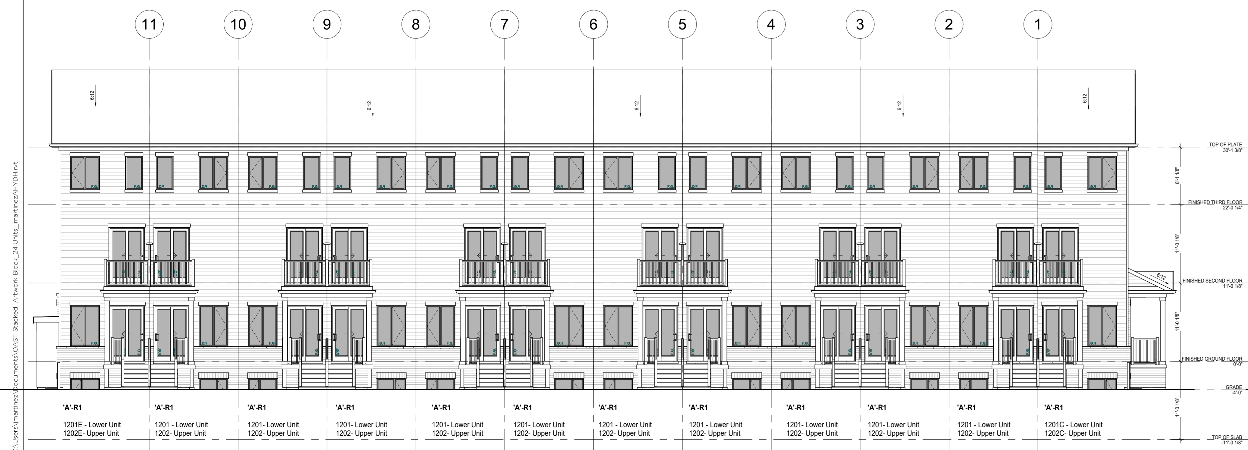
2 24 UNIT BLOCK - REAR ELEVATION 1/8" = 1'-0"