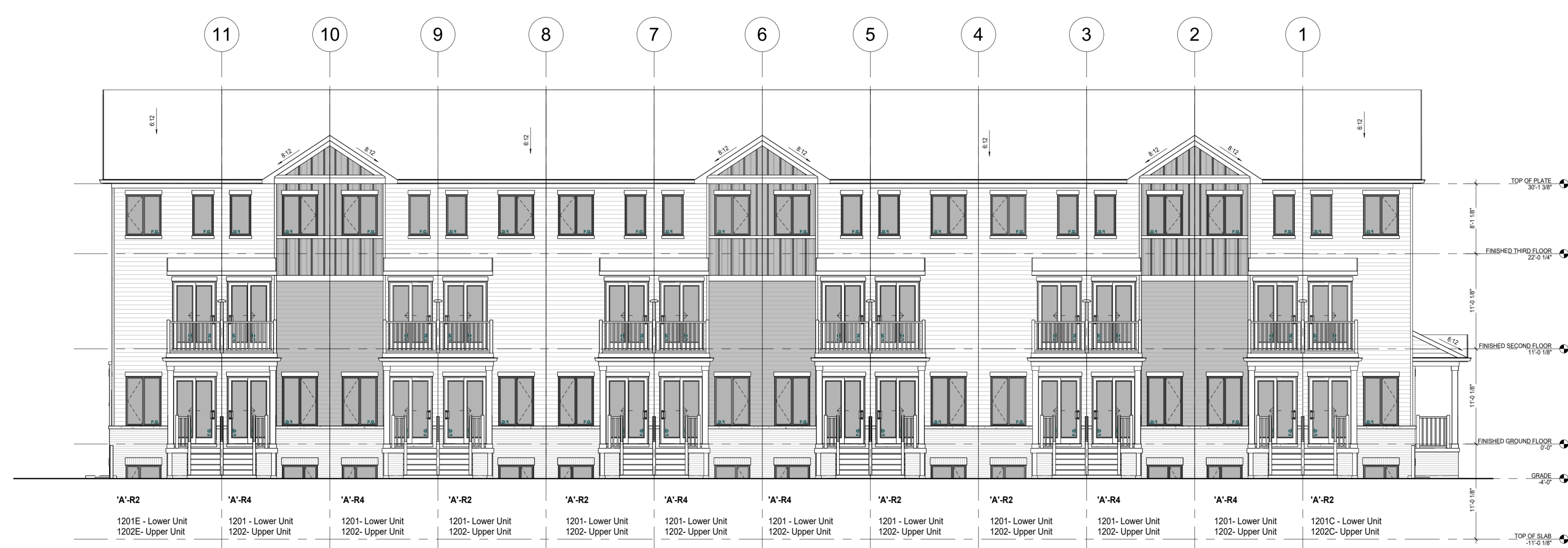
② 24 UNIT BLOCK - UPGRADE REAR ELEVATION OPTION 2 1/8" = 1'-0"