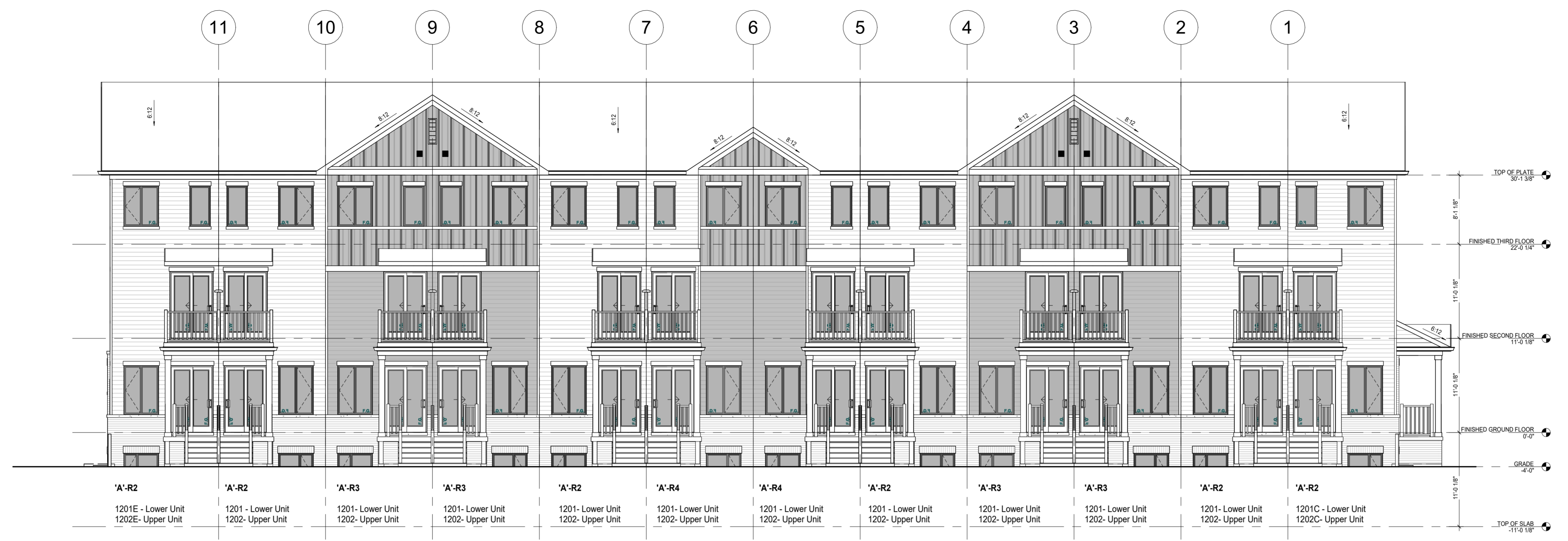
① 24 UNIT BLOCK - UPGRADE REAR ELEVATION OPTION 1 1/8" = 1'-0"

Q4 Architects Inc. retains the copyright in all drawings, plans, sketches, and all digital information. They may not be copied or used for any other projects or purposes or distributed without the written consent of Q4 Architects Inc.