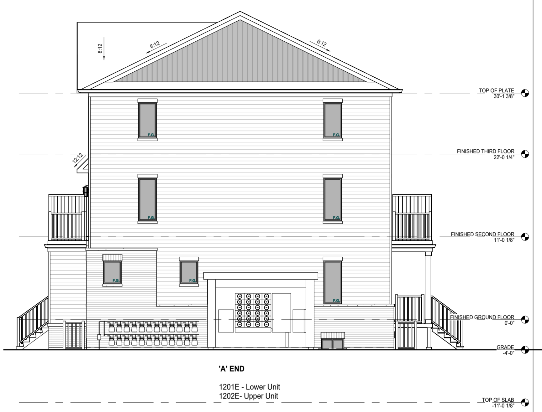
4 24 UNIT BLOCK - RIGHT ELEVATION 1/8" = 1'-0"