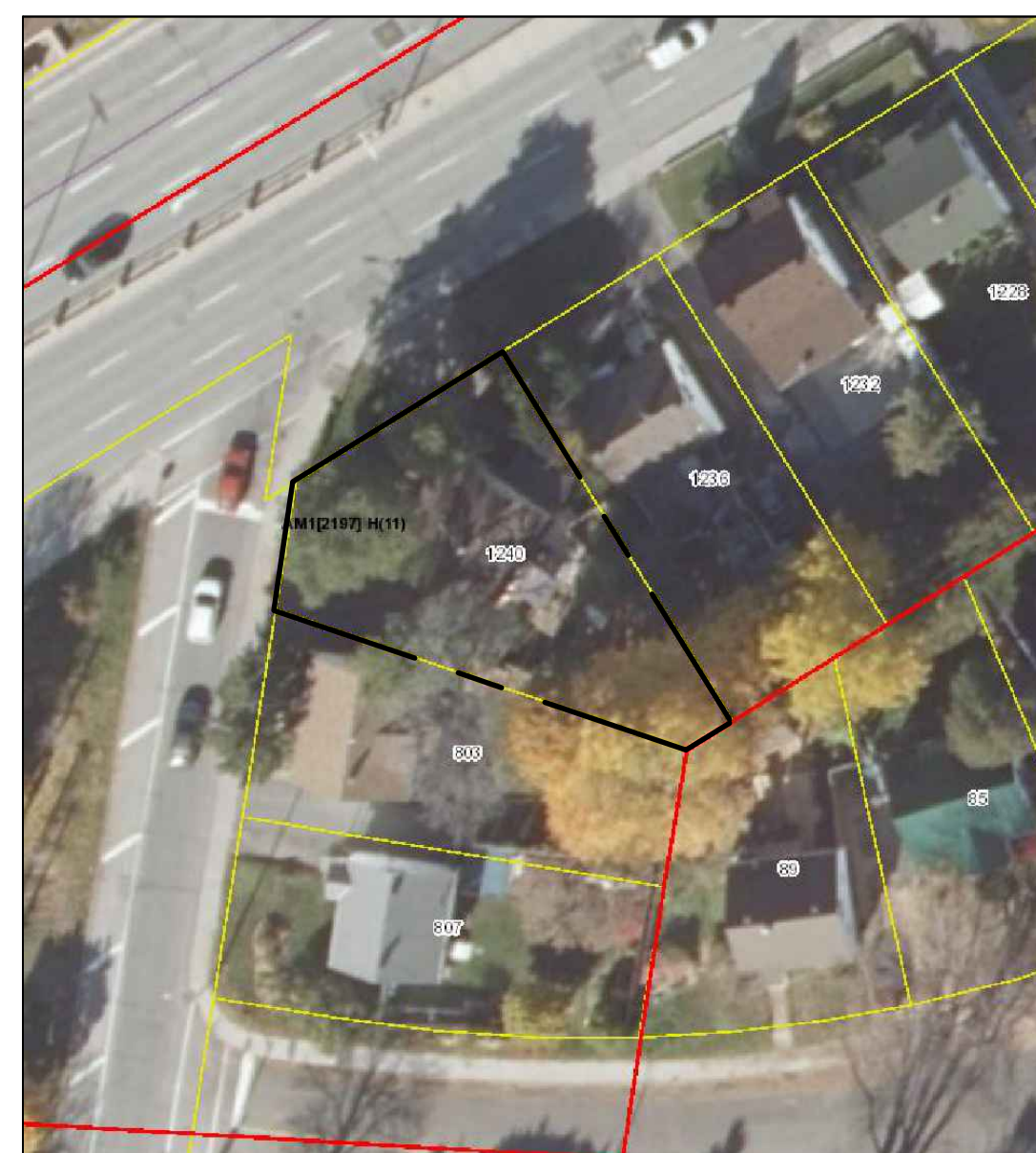
KEY PLAN TOPOGRAPHIC PLAN OF SURVEY OF LOT 3 REGISTERED PLAN 267570 CITY OF OTTAWA SURVEYED BY ANNIS, O'SULLIVAN, VOLLEBEKK LTD. DATED FEBRUARY 01, 2021