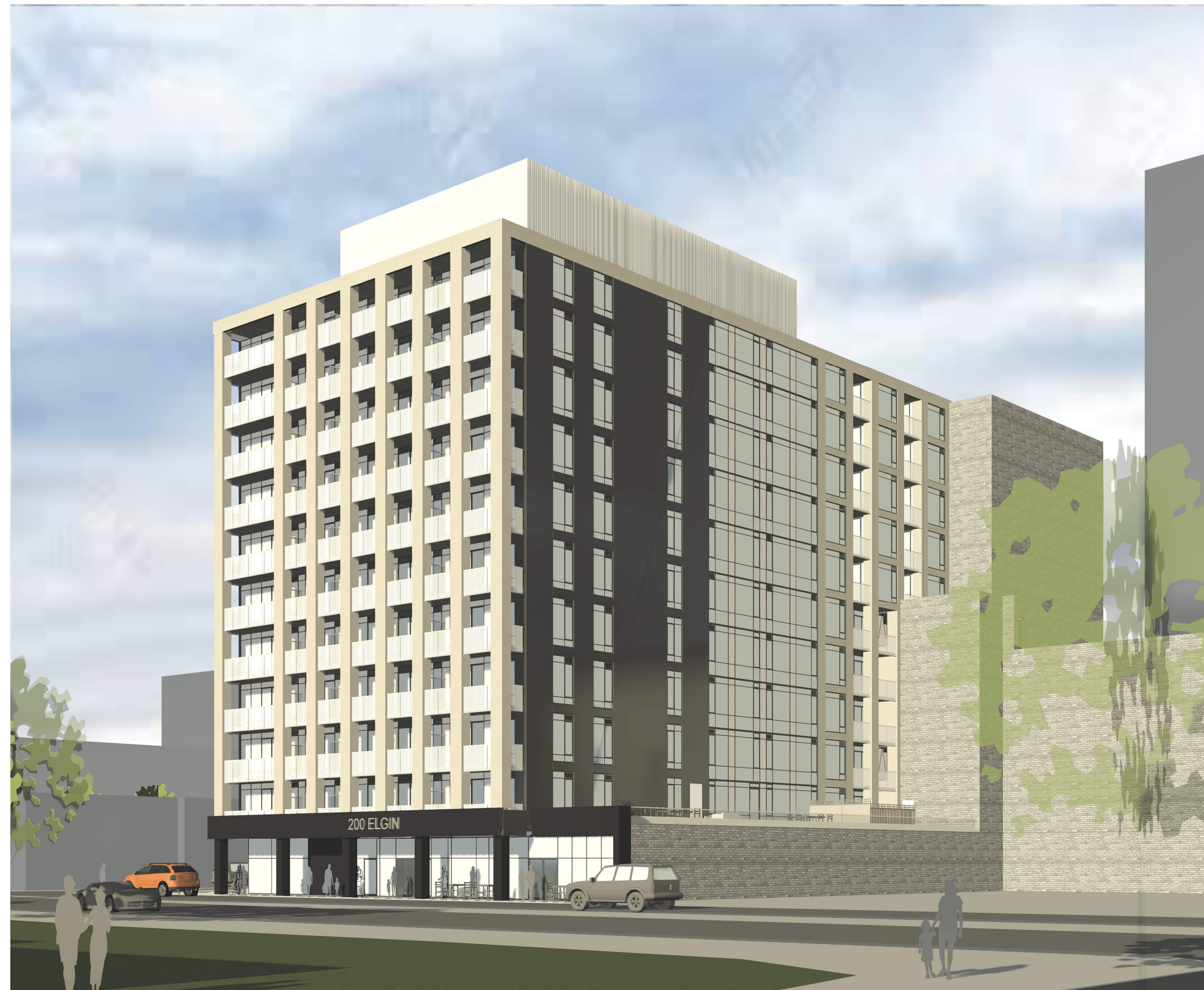
VIEW LOOKING WEST FROM ELGIN STREET

IT IS THE RESPONSIBILITY OF THE APPROPRIATE CONTRACTOR TO CHECK AND VERIFY ALL DIMENSIONS ON SITE AND TO REPORT ALL ERRORS AND/OR OMISSIONS TO THE ARCHITECT. ALL CONTRACTORS MUST COMPLY WITH ALL PERTINENT CODES AND BY-LAWS. THIS DRAWING MAY NOT BE USED FOR CONSTRUCTION UNTIL SIGNED BY THE ARCHITECT. DO NOT SCALE DRAWINGS. COPYRIGHT RESERVED.