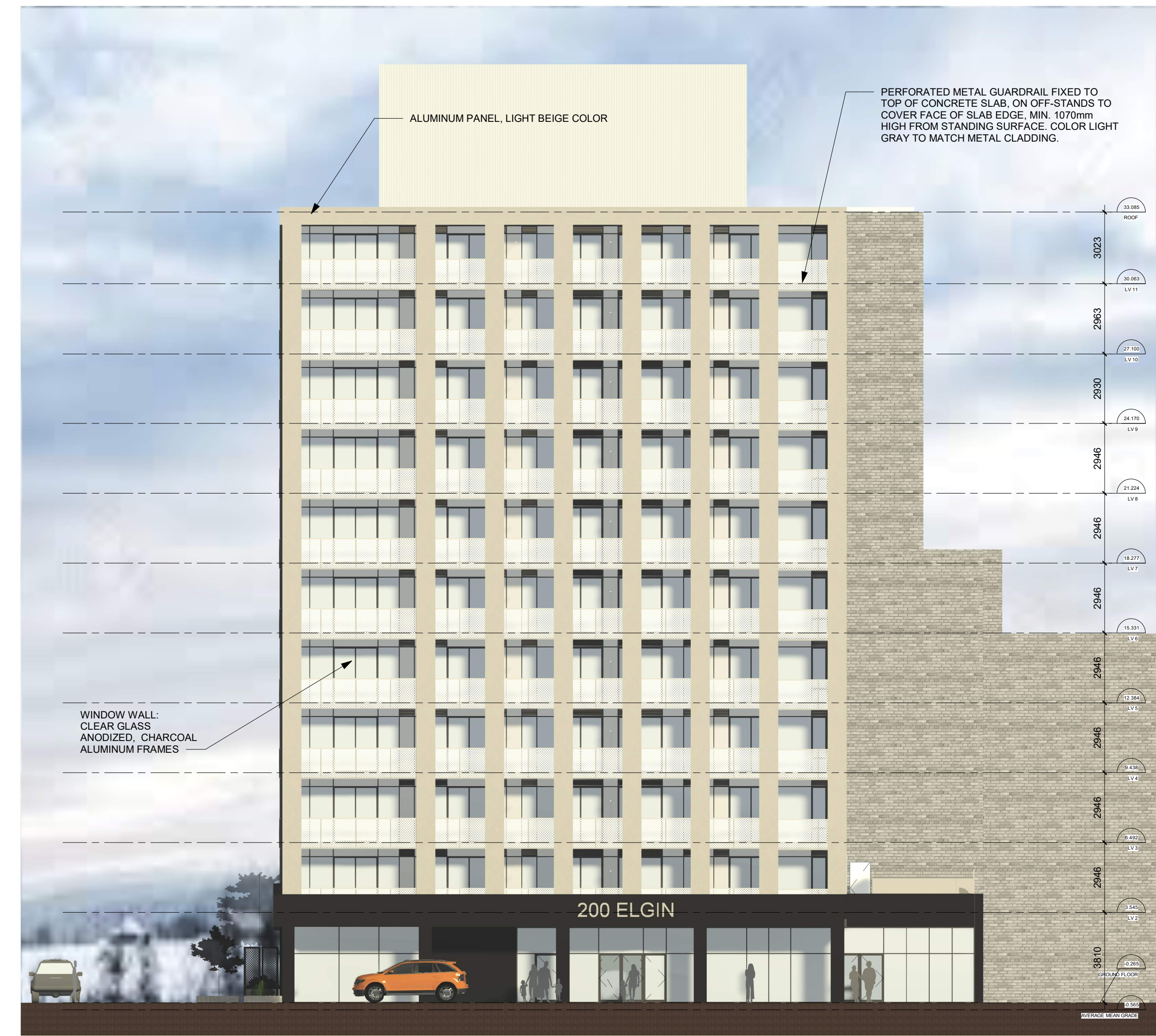
ELGIN STREET ELEVATION