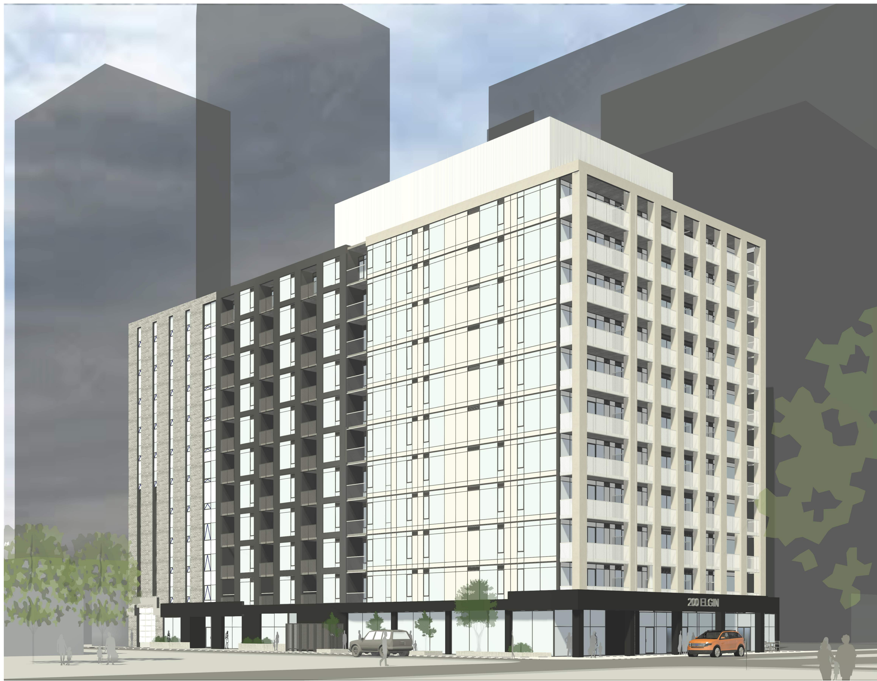
VIEW LOOKING EAST FROM ELGIN STREET