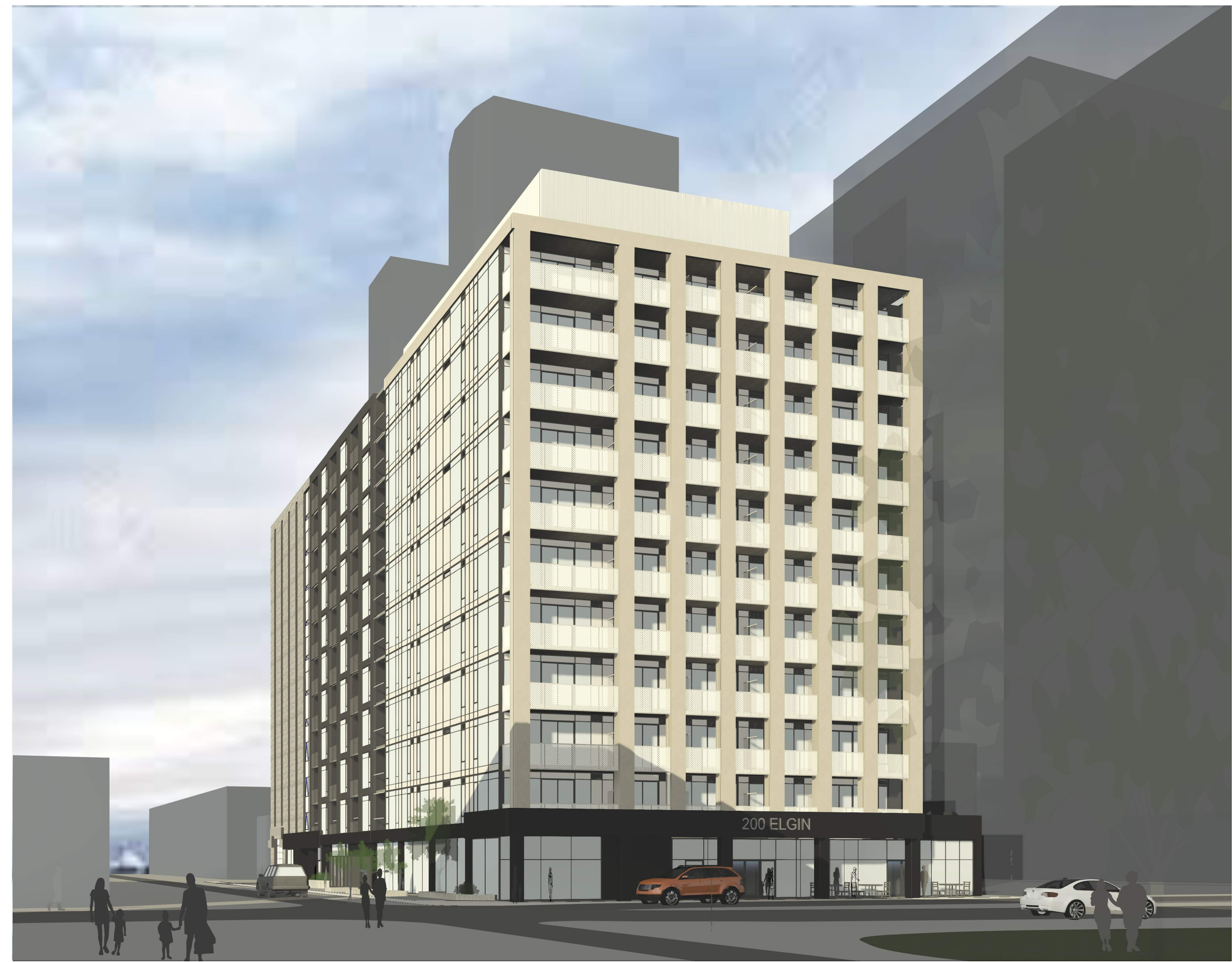
VIEW FROM ELGIN AND LISGAR STREET INTERSECTION