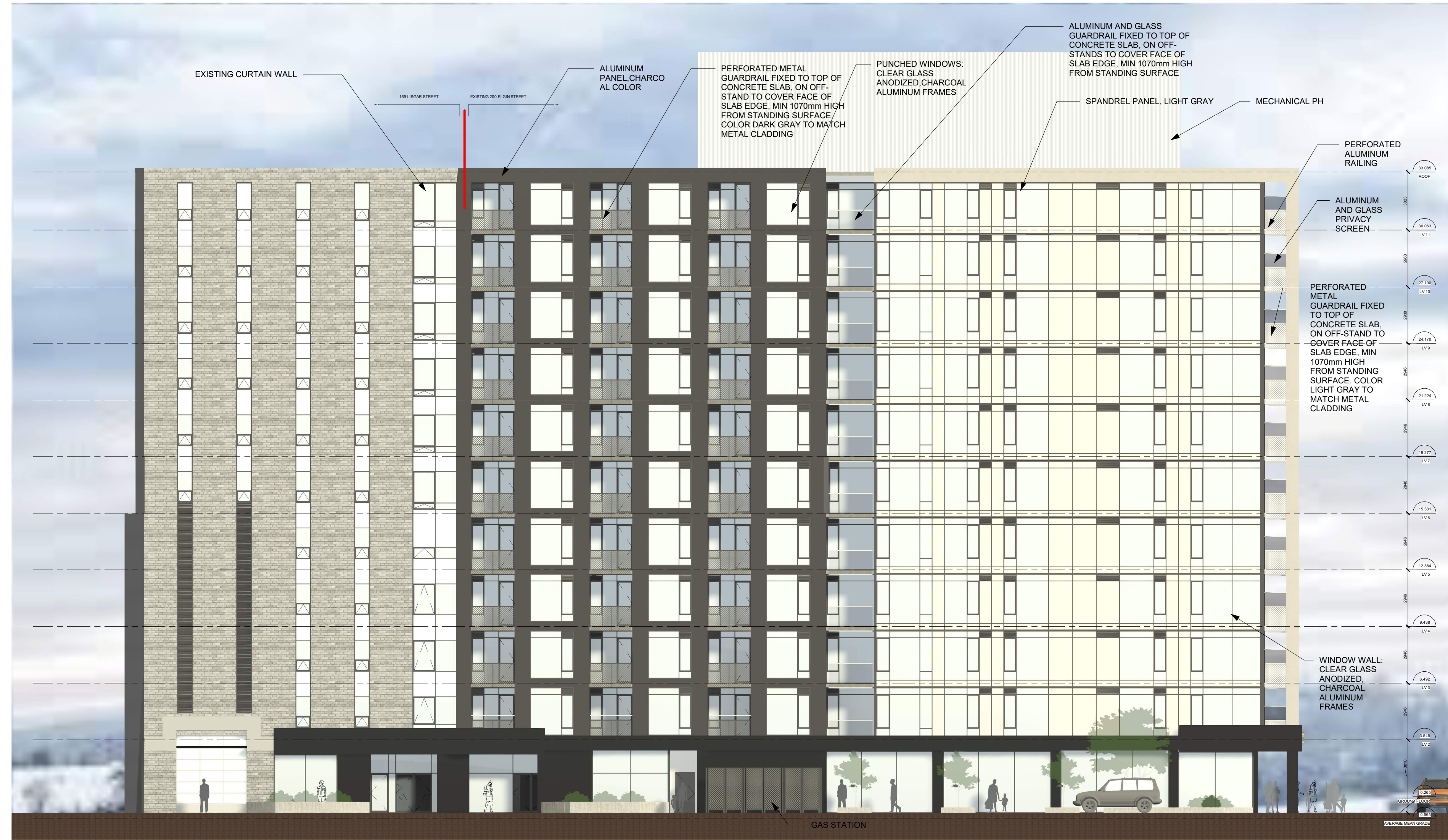
LISGAR STREET ELEVATION