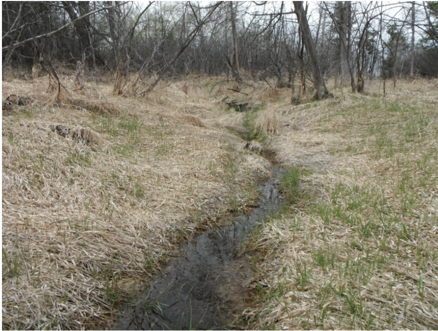
Photo 9 - Station E3 and D1 along a tributary of Feedmill Creek in the southwest portion of the site looking upstream from downstream (April 30 th , 2012)