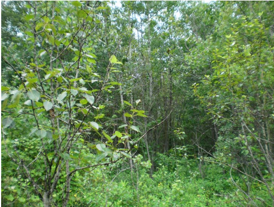
Photo 4 – Cultural woodland in the northwest portion of the site (July 10 th , 2013)

Lands adjacent to the Feedmill Creek corridor in the southwest portion of the site that appear to have been out of agricultural production longer are also noted on Map 1 as cultural woodland (vegetation community 3). Mature crack willow are present, along with smaller trembling aspen, and white elm trees. Glossy buckthorn and reed canary grass are dominant in the understorey and ground flora, respectively.