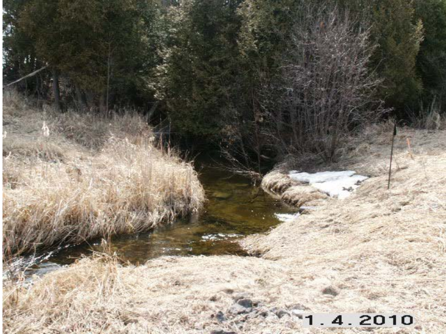
Photo 8 – Feedmill Creek emerging from the mixed forest just west of Palladium Drive. View looking southwest

The CRWSS did not consider any of the on-site channels leading to Feedmill Creek to be fish habitat and did not identify habitat protection for these channels.