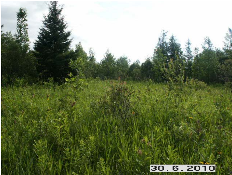
Photo 2 –Cultural meadow habitat in the central-west portion of the site