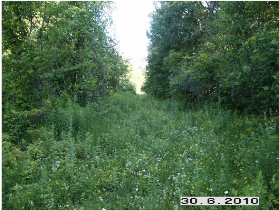
Photo 13 – Old access lane along central and north portion of west edge of site. View looking north, with west edge of site on right