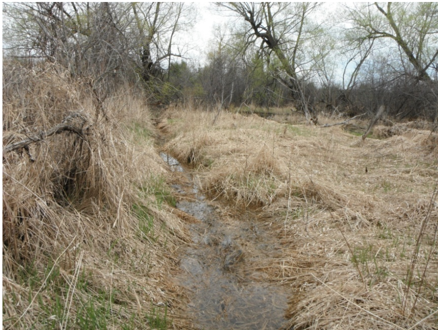
Photo 10 - Station D3 along the same southwest tributary just upstream of the confluence with Feedmill Creek (April 30 th , 2012)