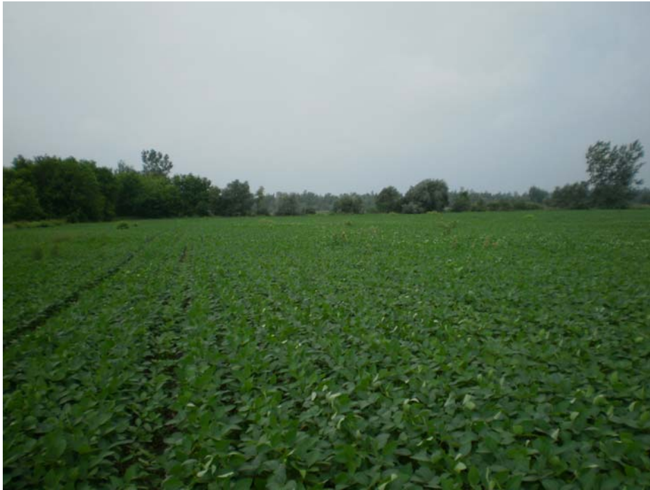
Photo 1 – Soybean fields dominate the north portion of the site. This is the north - central field with view looking west to intermittent deciduous hedgerow (July 10 th , 2013)