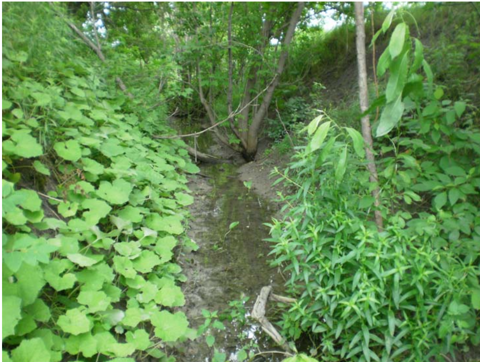
Photo 12 – North-south channel joining the west-east channel in the north-central portion of the site. View looking north (July 10 th , 2013)