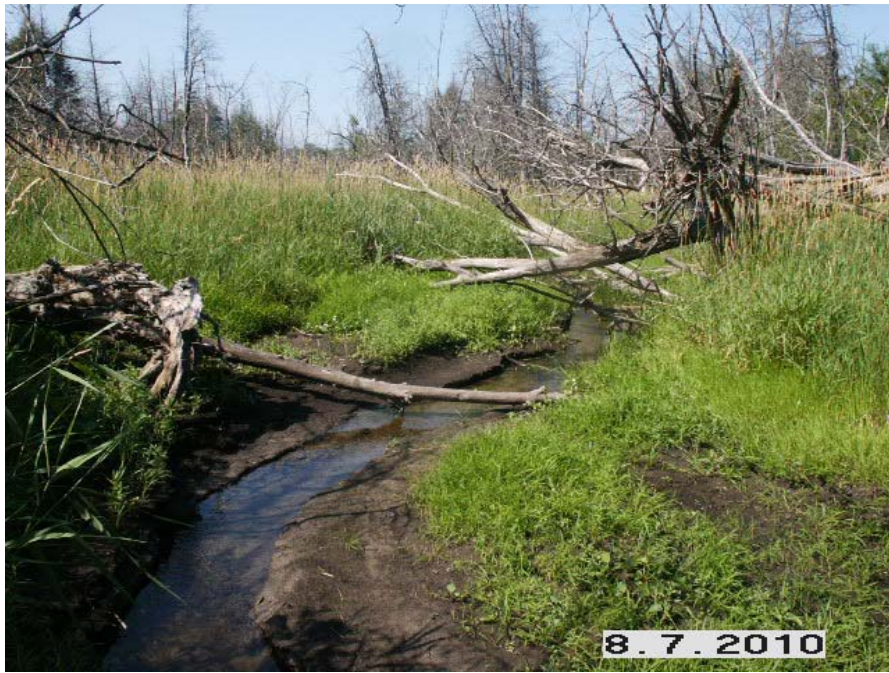
Photo 6 – Feedmill Creek through the meadow marsh in the southwest portion of the site. View looking west