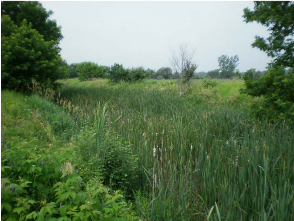
Photo 11 – West-east channel in the north-central portion of the site. View looking west (July 10 th , 2013)