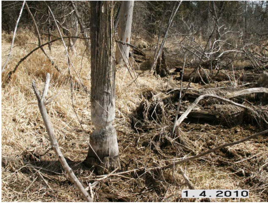
Photo 7 – Former beaver activity in meadow marsh at Feedmill Creek in the west part of the site.