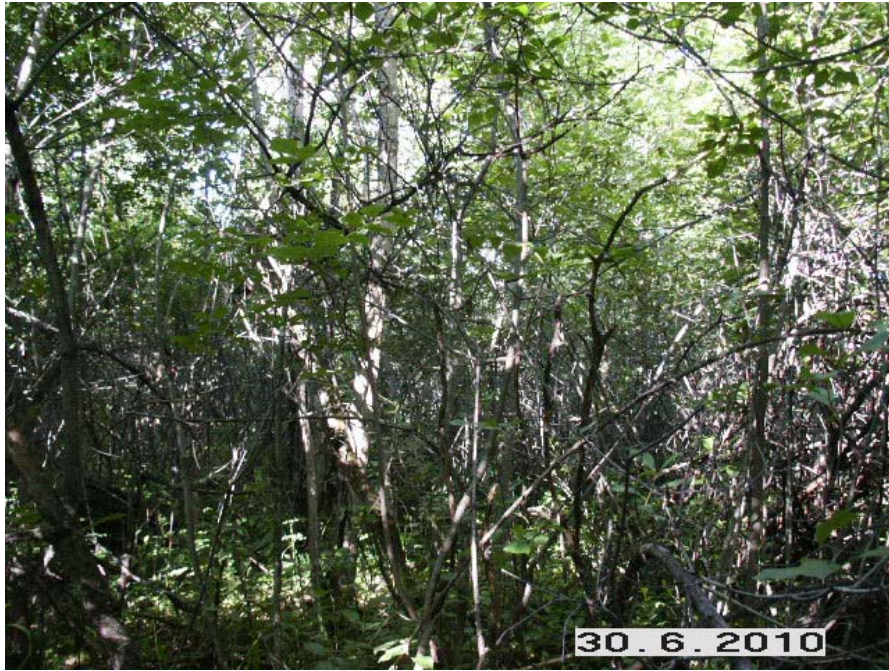
Photo 5 – Young poplar deciduous forest with thick buckthorn in understory