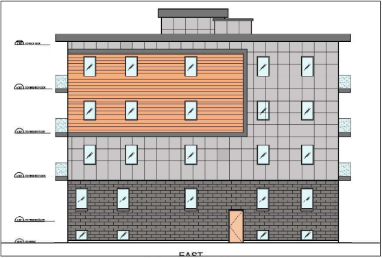
1 EAST (SIDE) FACADE SCALE = 1/8" = 1'-0"