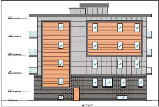
1 WEST EAST (SIDE) FACADE SCALE = 1/8" = 1'-0"