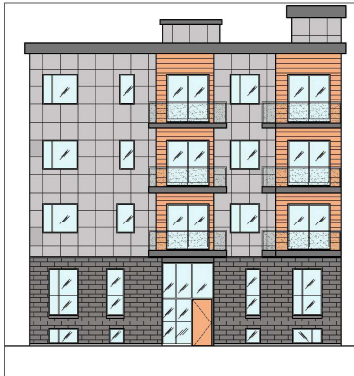
1 FRONT (NORTH) FACADE SCALE = 1/8" = 1'-0"