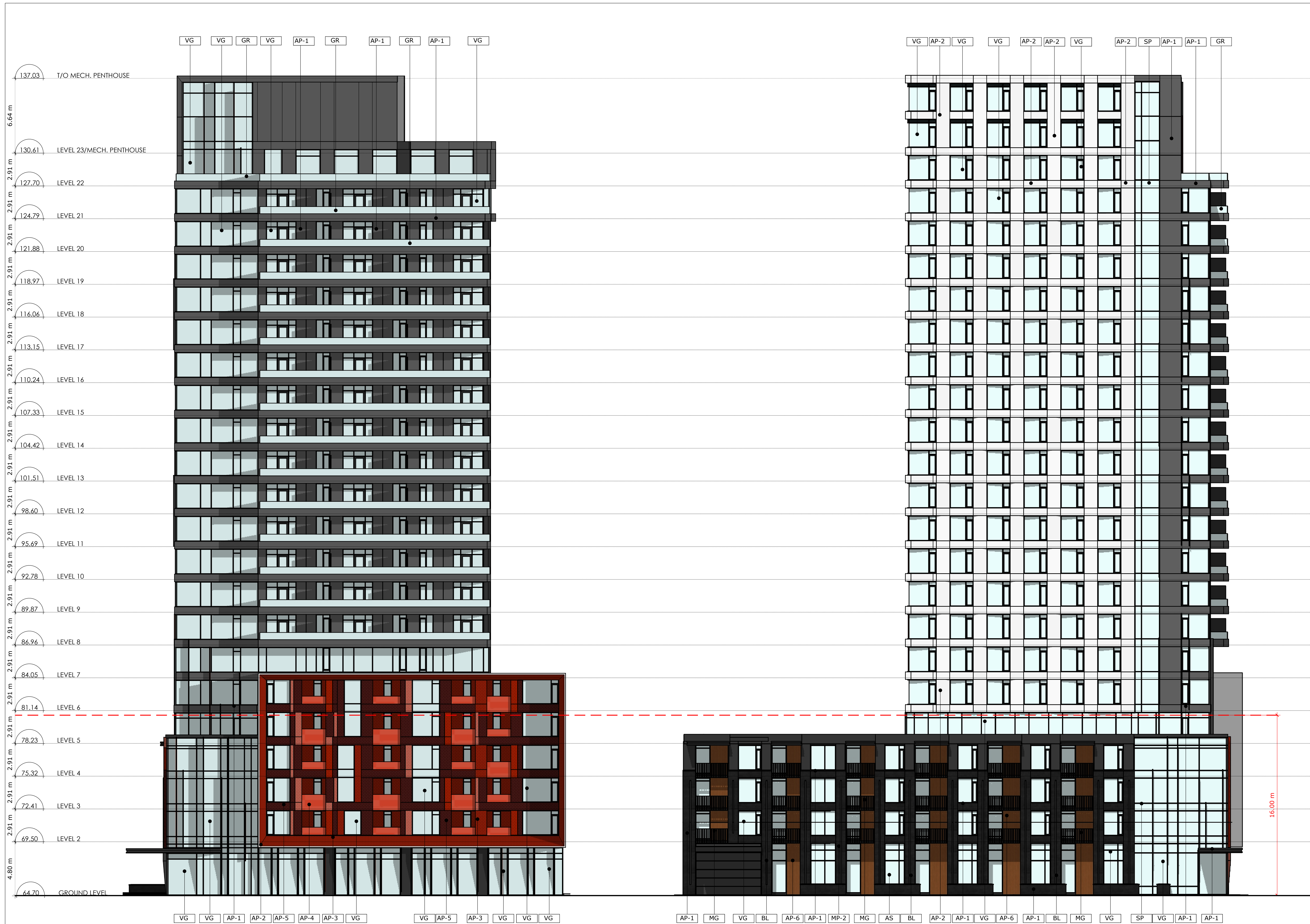
1 NORTH ELEVATION A3.00 Scale: 1: 150