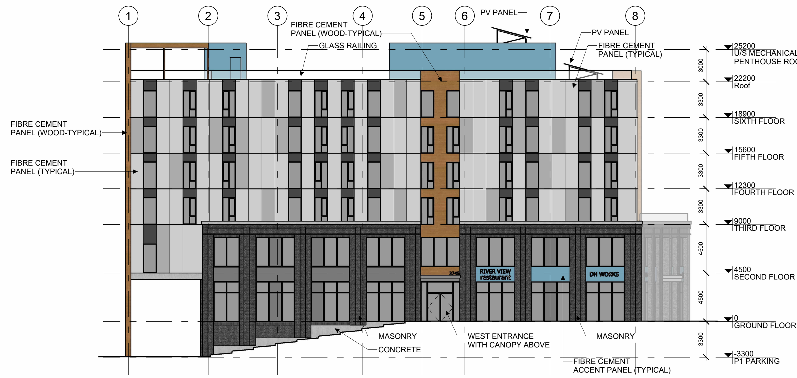
1 WEST ELEVATION A300 1:200