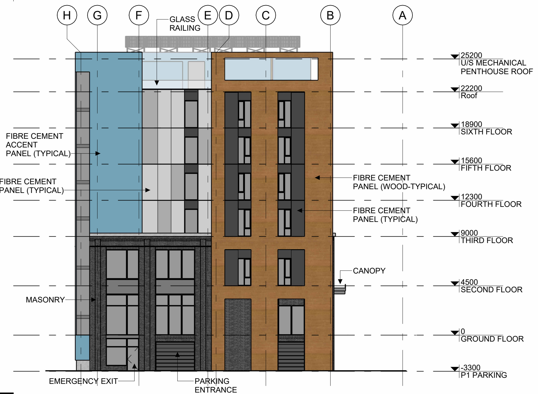
4 NORTH ELEVATION A300 1:200