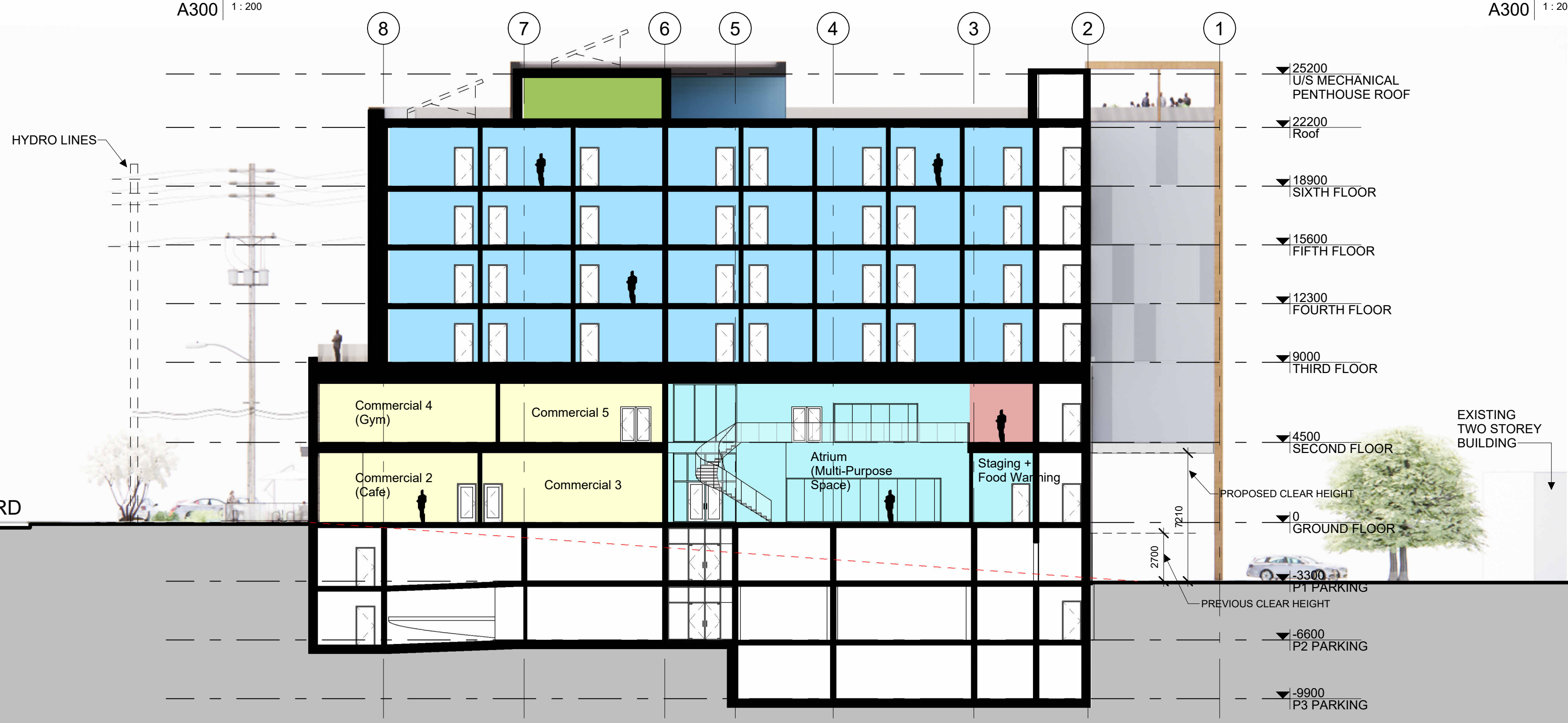
5 BUILDING SECTION A300 1:200