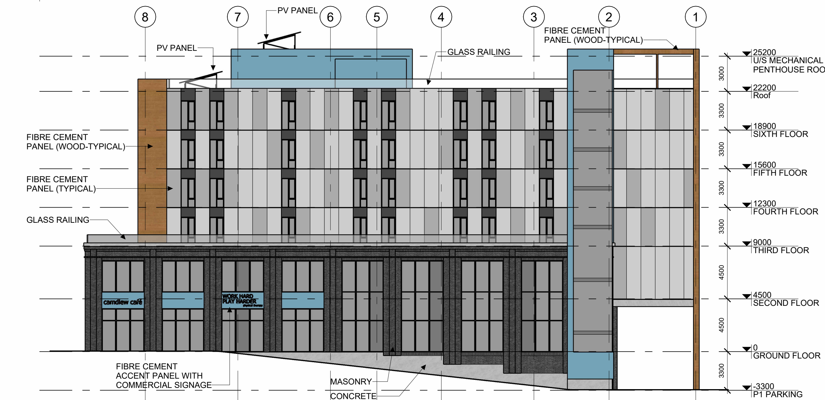
3 EAST ELEVATION A300 1:200