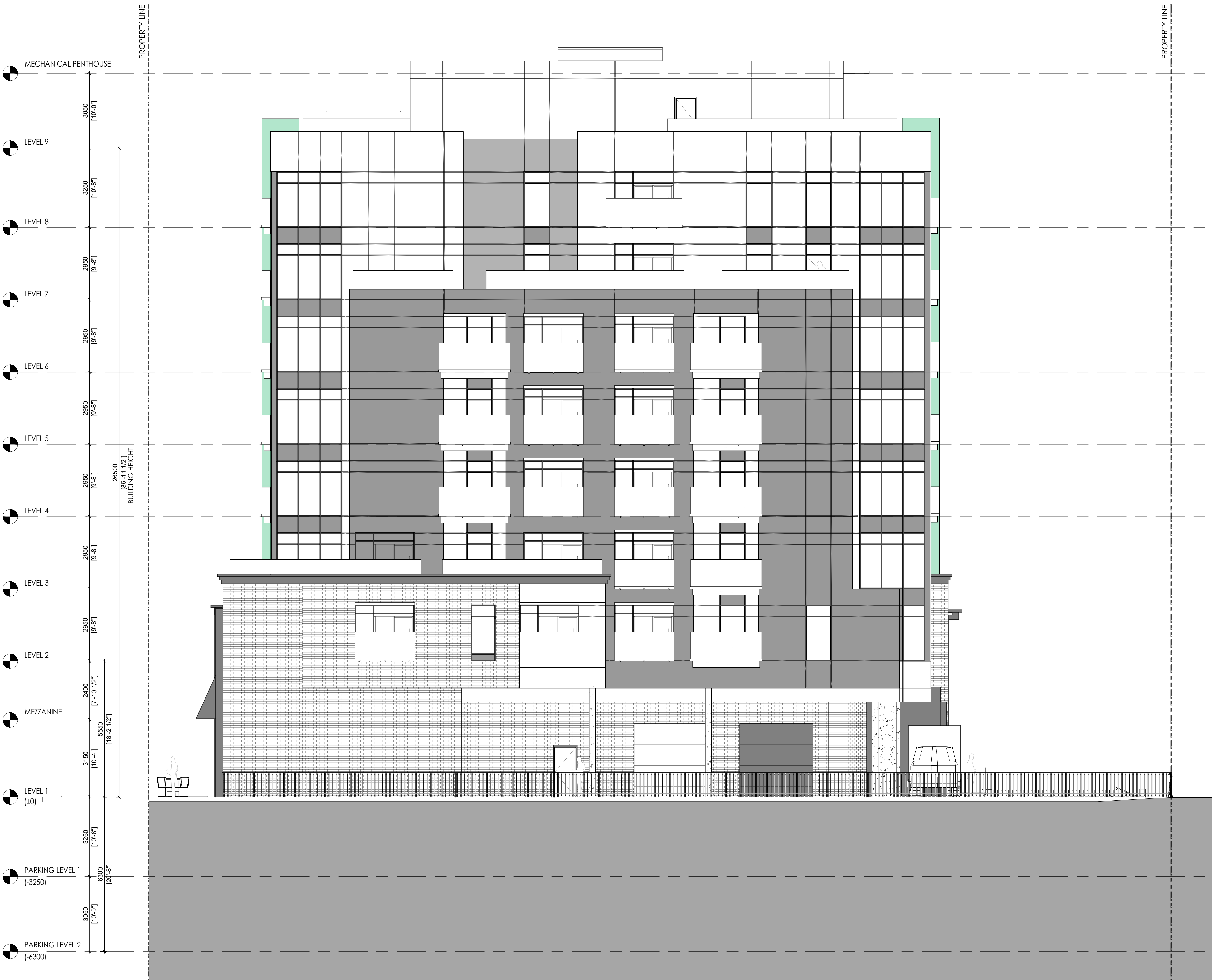
1 NORTH ELEVATION A120 1:75