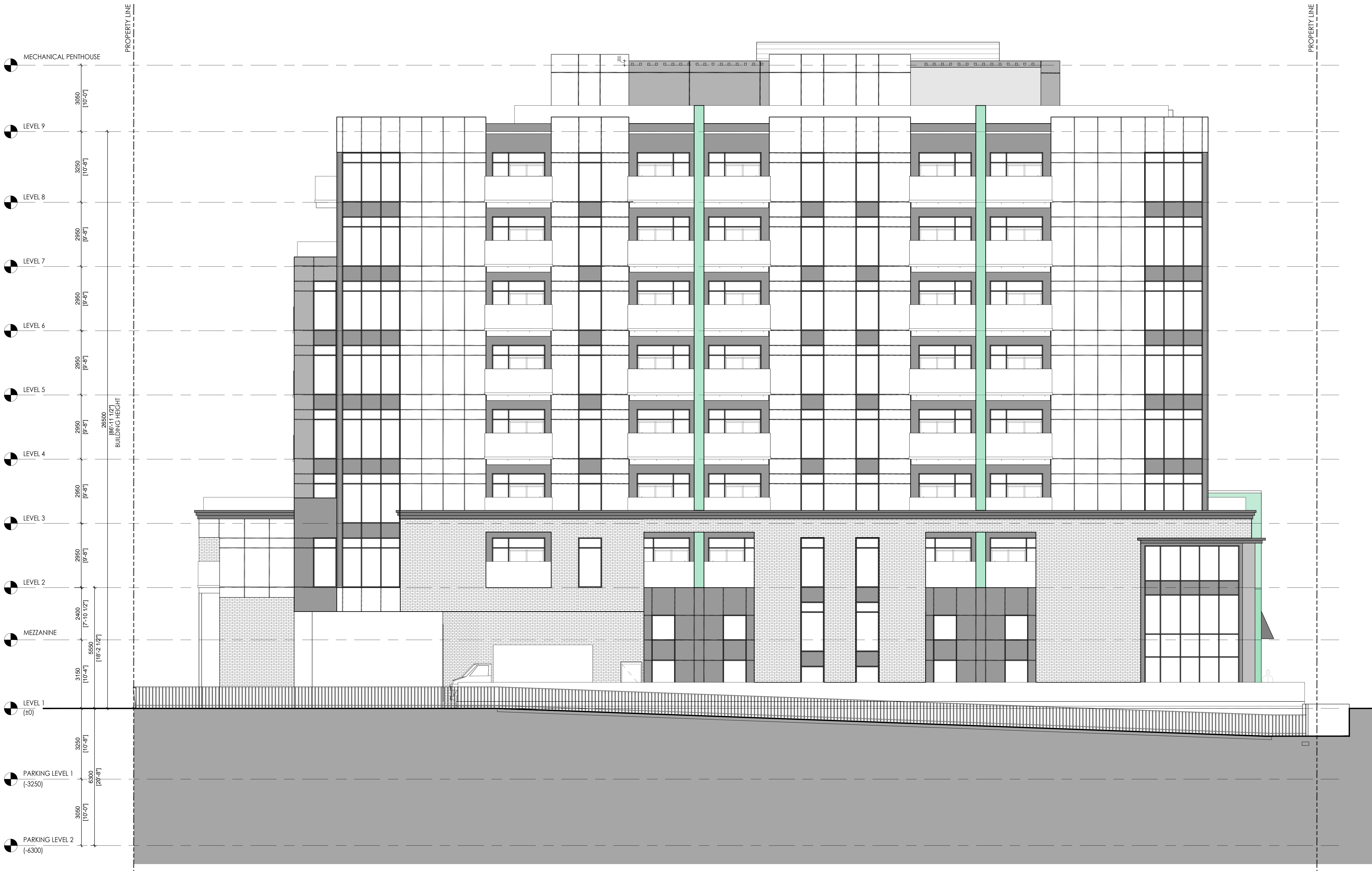
1 WEST ELEVATION A120 1:75