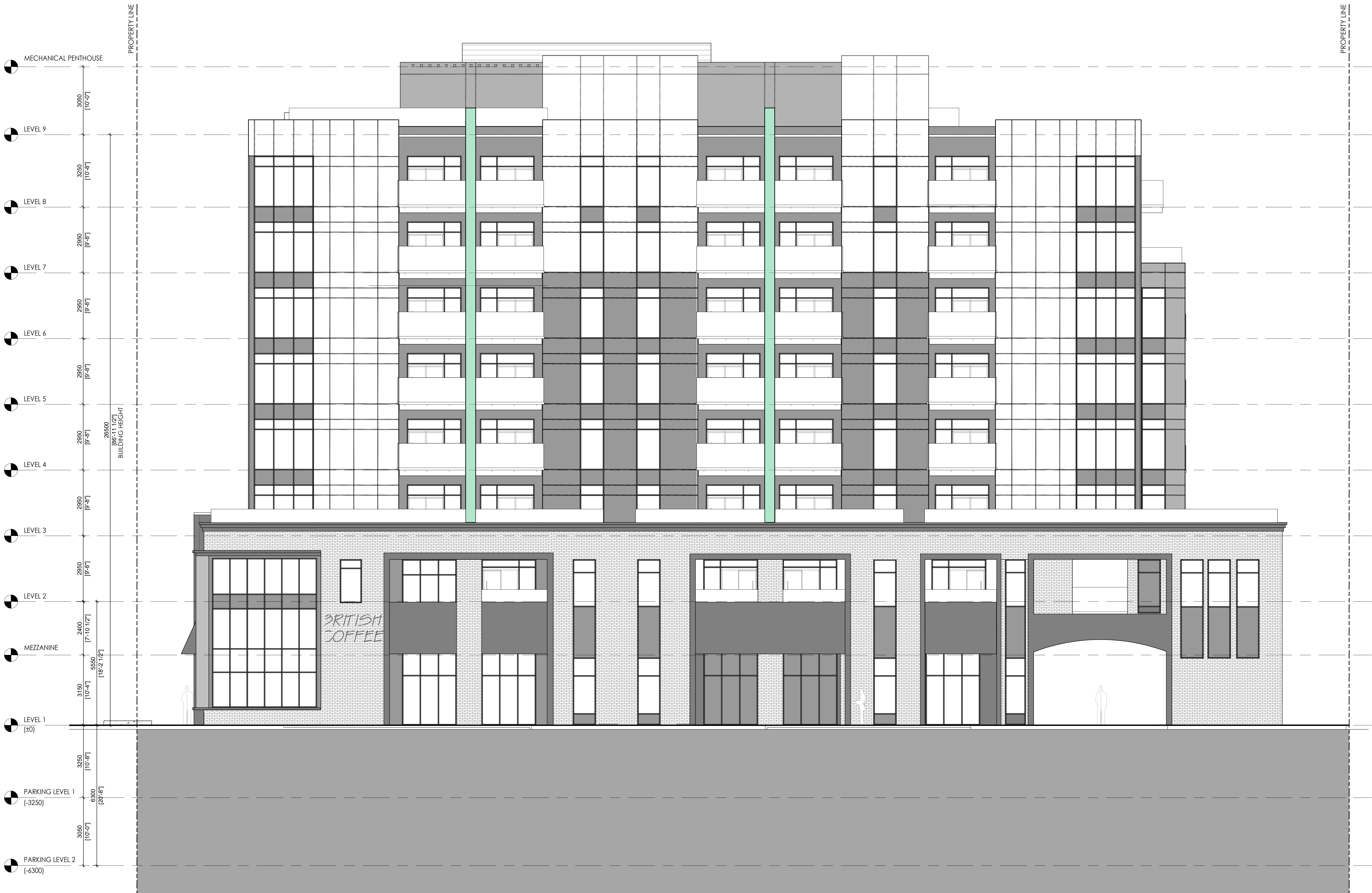
1 EAST ELEVATION A120 1:75