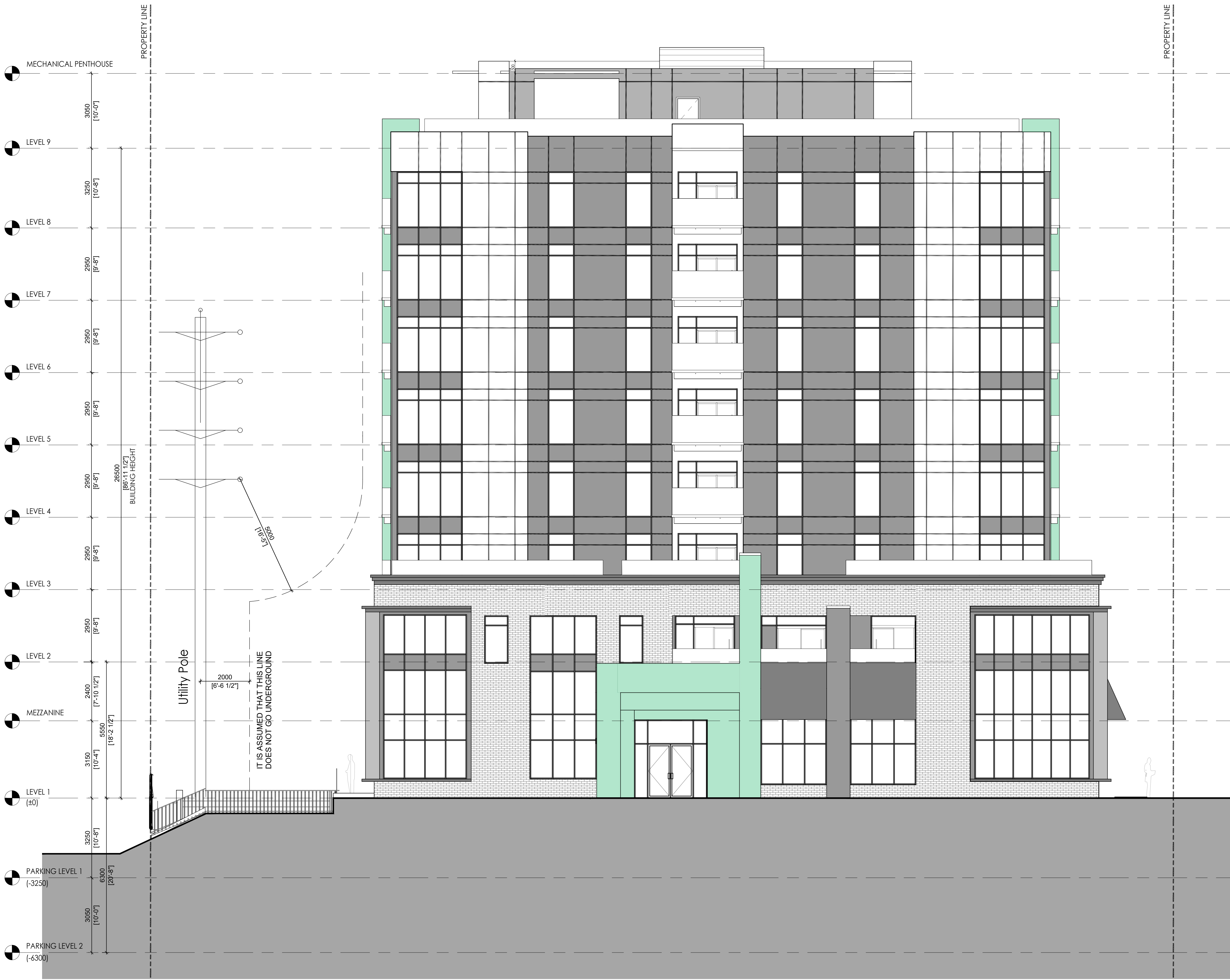
1 SOUTH ELEVATION A120 1:75