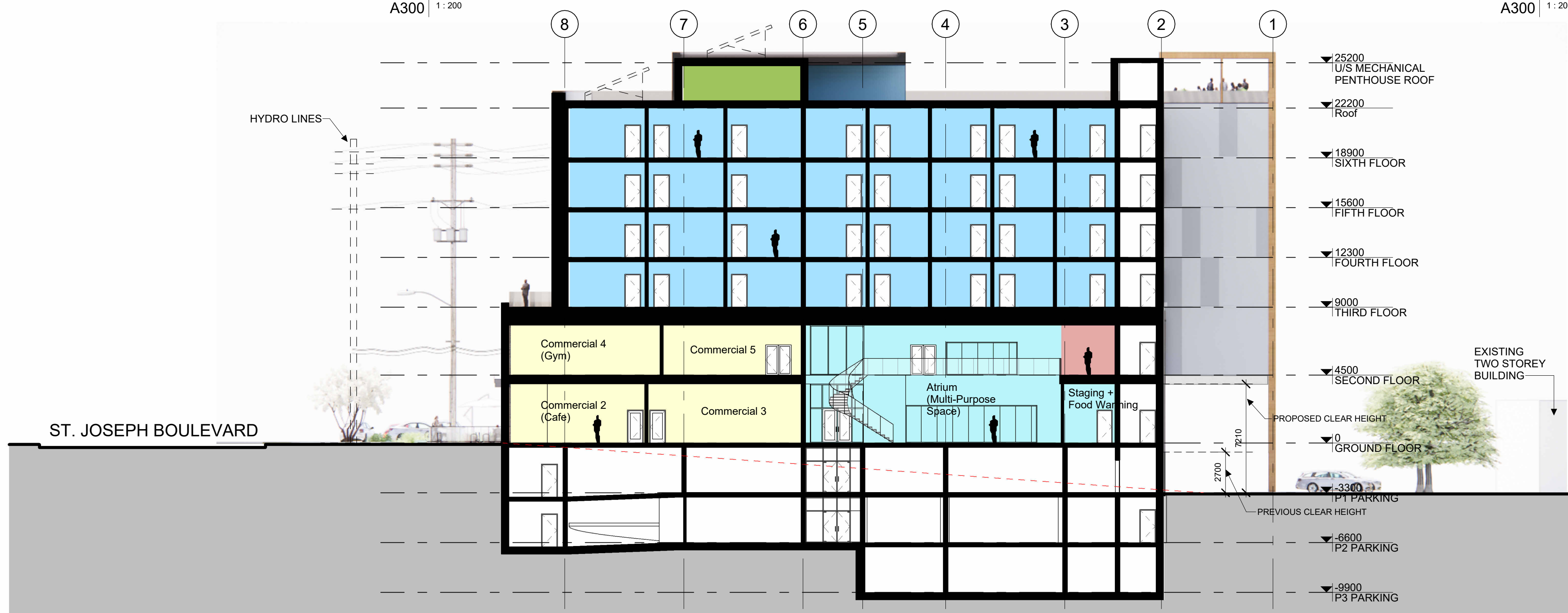
5 BUILDING SECTION A300 | 1:200