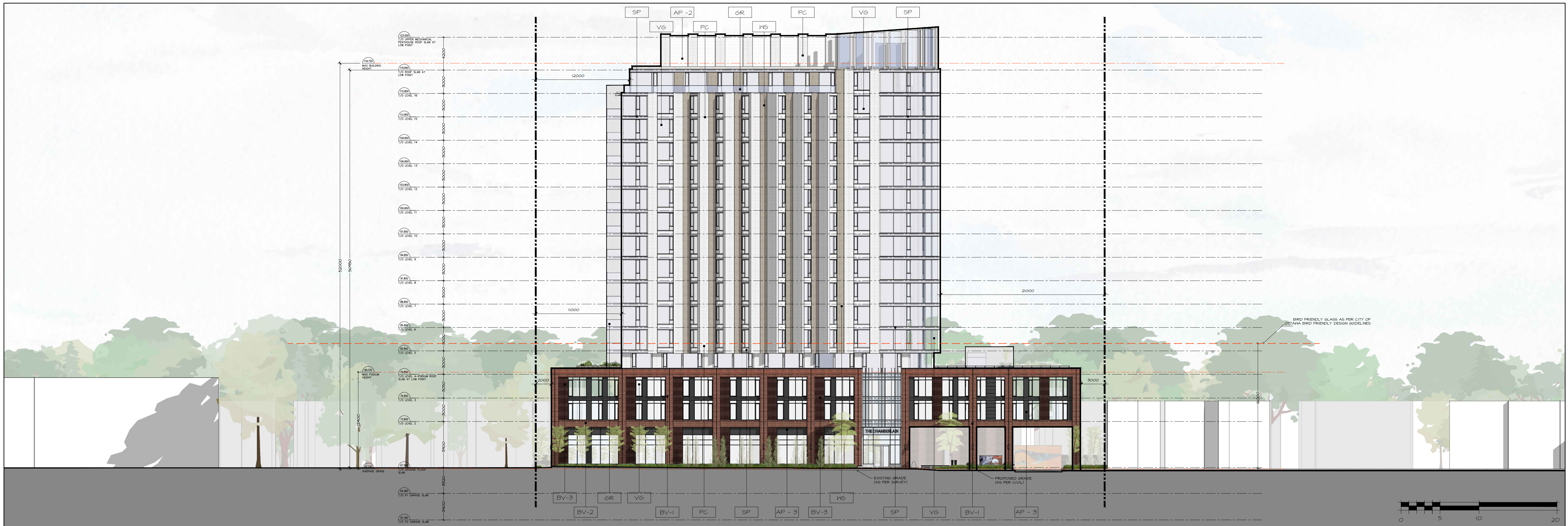
1 NORTH ELEVATION A3.01 1 : 250