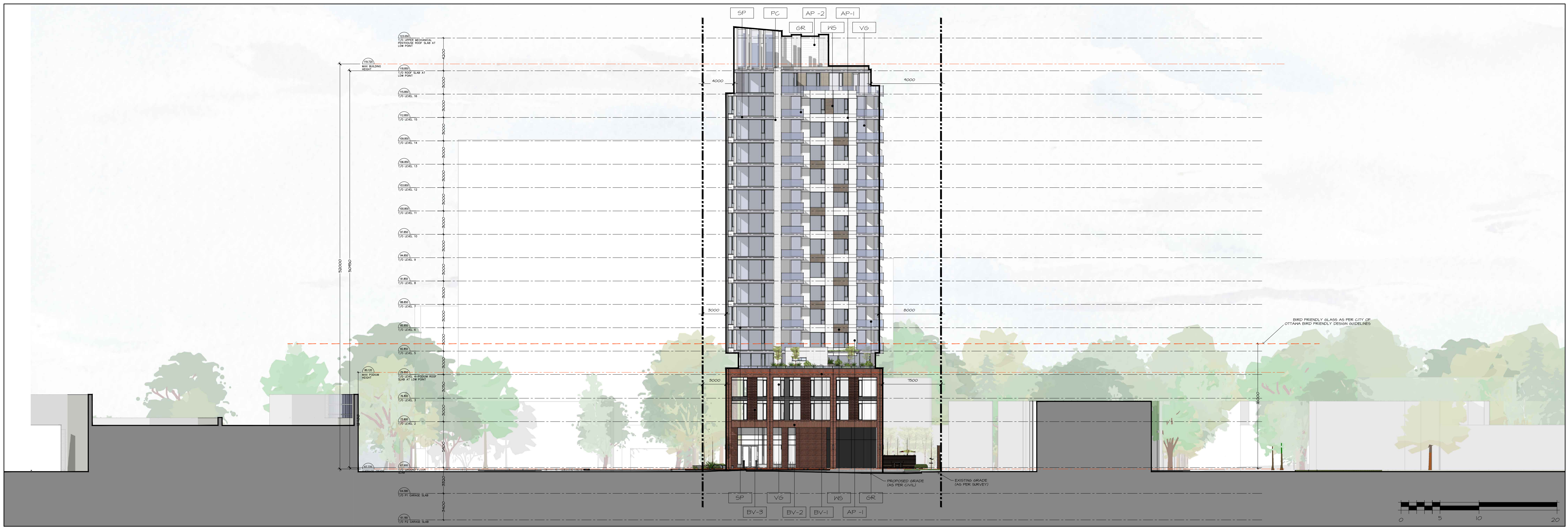
2 WEST ELEVATION A3.01 1 : 250