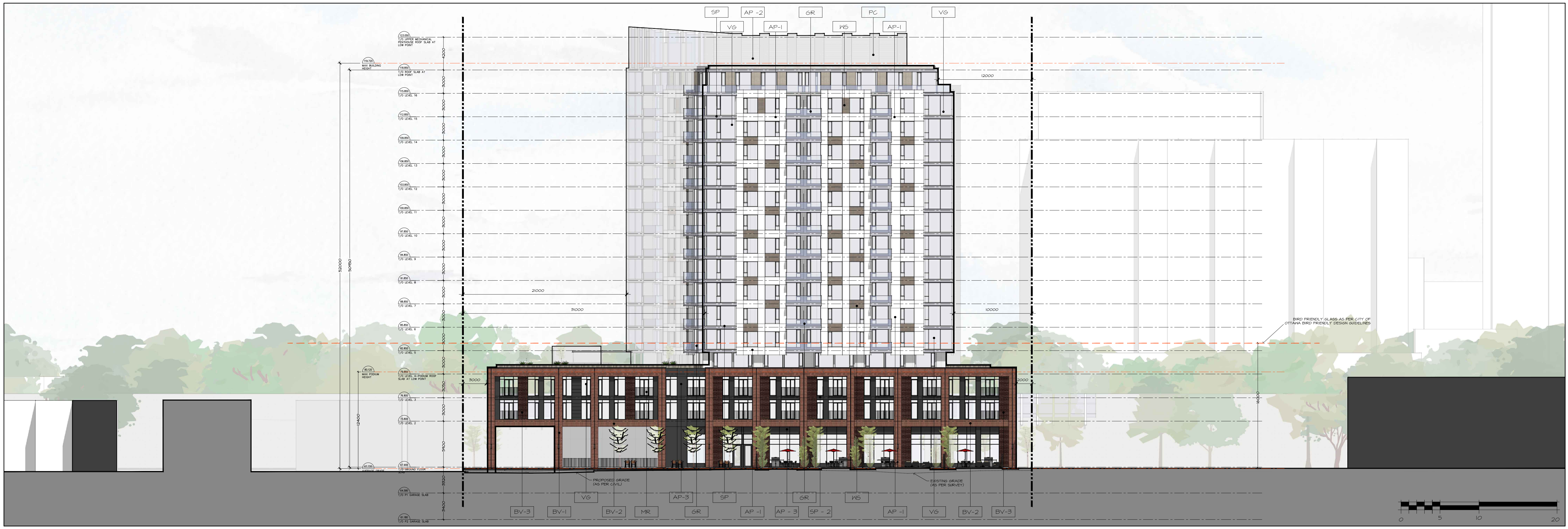
1 SOUTH ELEVATION A3.00 1 : 250