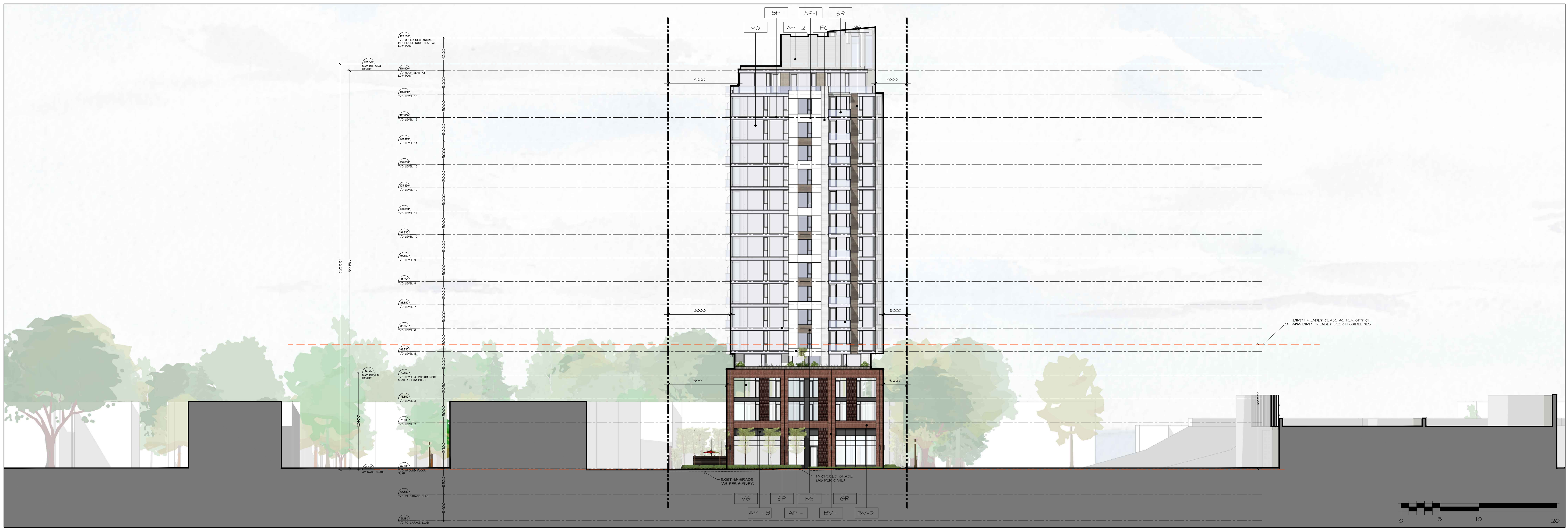
2 EAST ELEVATION A3.00 1 : 250