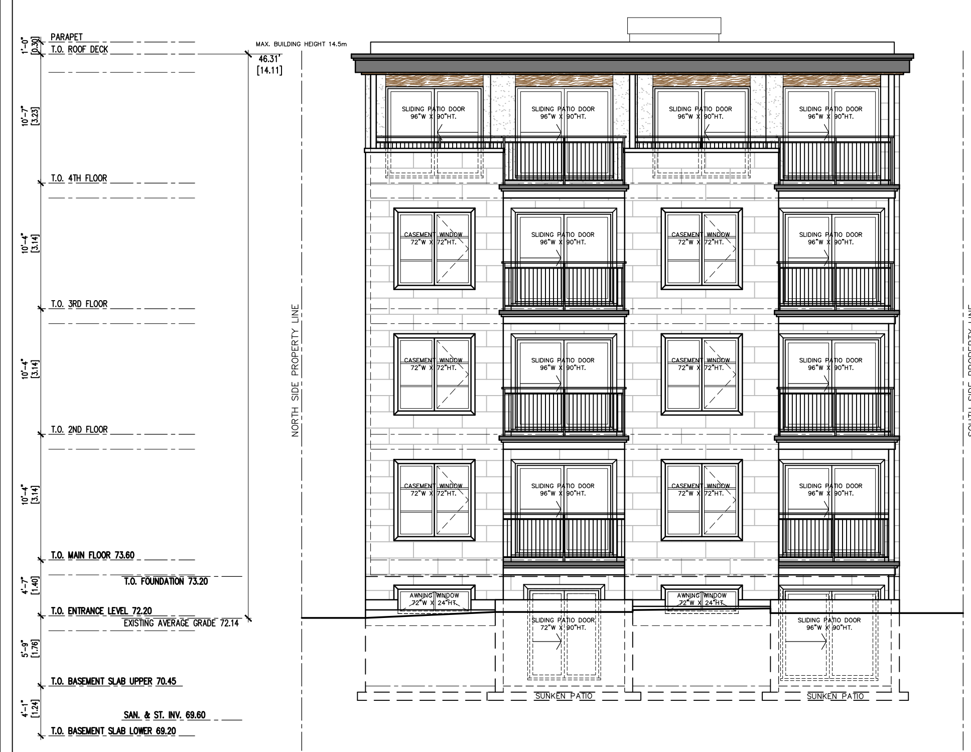
REAR ELEVATION (WEST) SCALE: 1/8" = 1'-0"