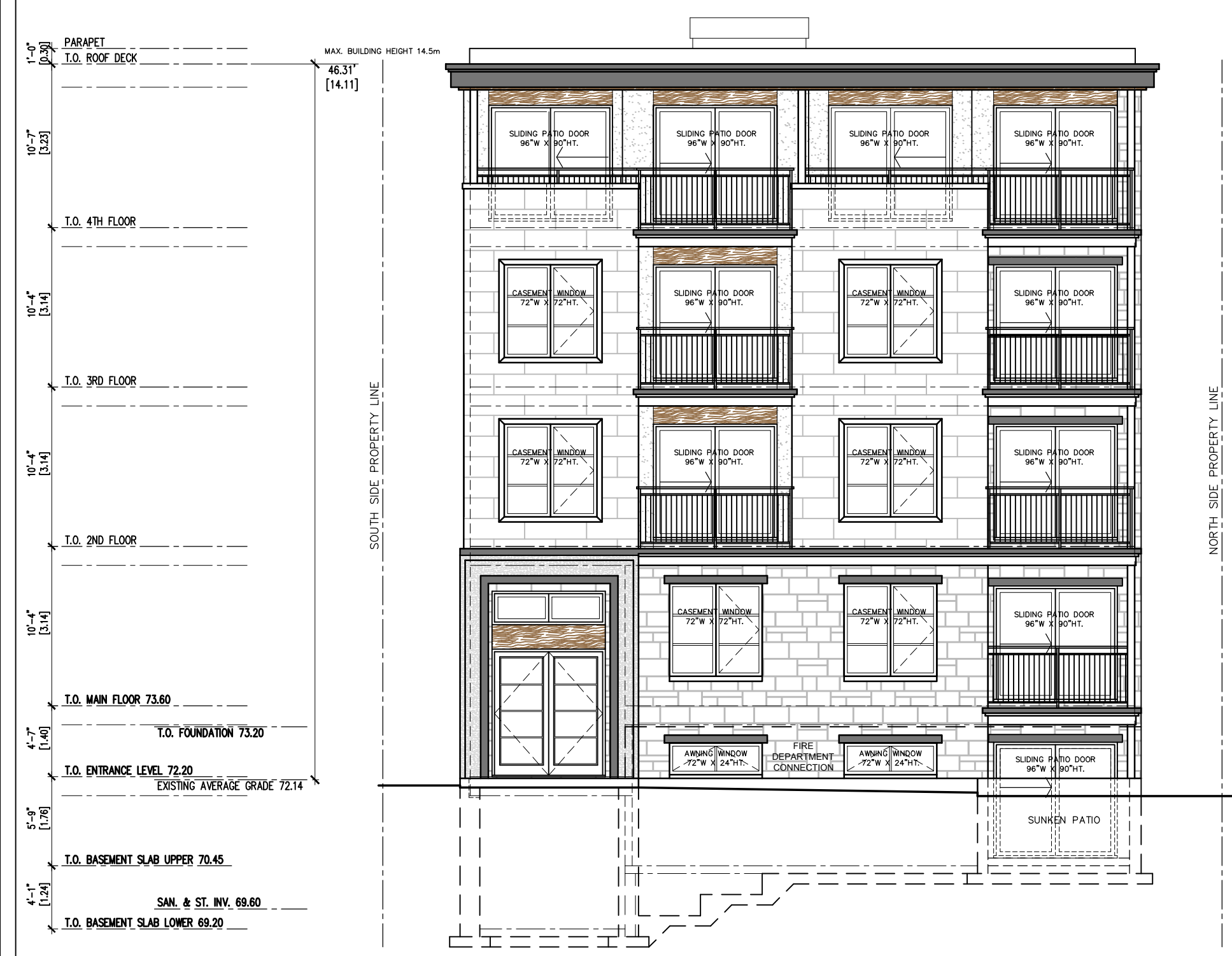
FRONT ELEVATION (EAST) SCALE: 1/8" = 1'-0"

FACADE AREA CALCULATIONS: SEC. 141 (10) 10. The front facade must comprise at least 20 percent of the AREA OF FRONT FACADE = 185.3m 2 (1999.39 sq ft) AREA OF WINDOW = 31.6m 2 (771sq ft) 71.6 / 185.3 = 38.6% *The front facade comprises at least 38.55% windows. 11. At least 20 percent of the area of the front facade must be recessed an additional 0.6 metres from the front setback line. AREA OF FRONT FACADE = 185.3m 2 (1999.39 sq ft) 1.36 (RECS) MIN. LONG RECESSED AREA OF FRONT FACADE = 92.89m 2 (999.9 sq ft) 32.3 / 185.3 = 17.4% *At least 30.02% of the area of the front facade is recessed by at least 1.5 metres from the front setback line.