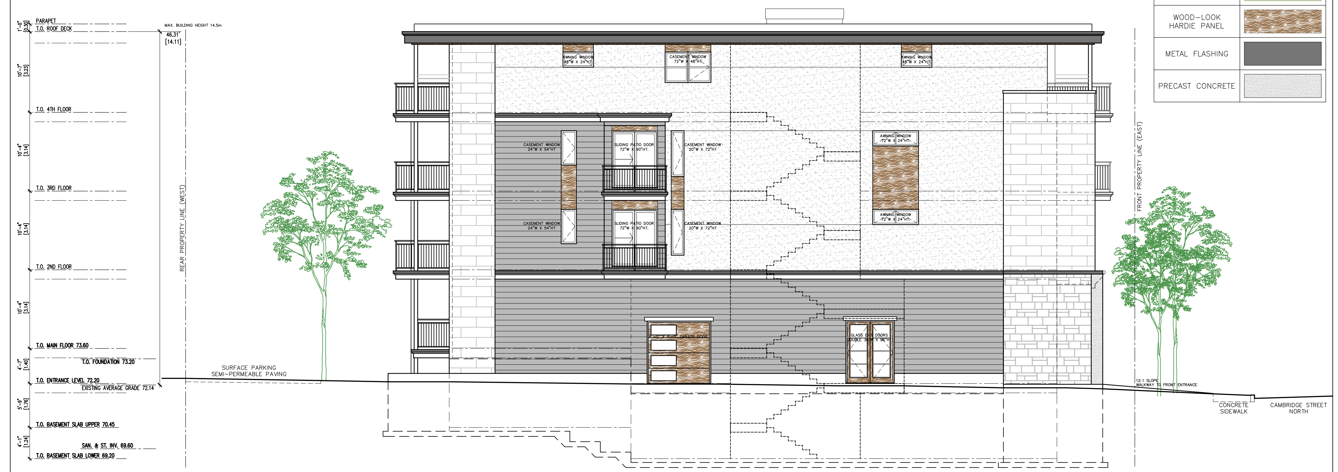
LEFT SIDE ELEVATION (SOUTH) SCALE: 1/8" = 1'-0"