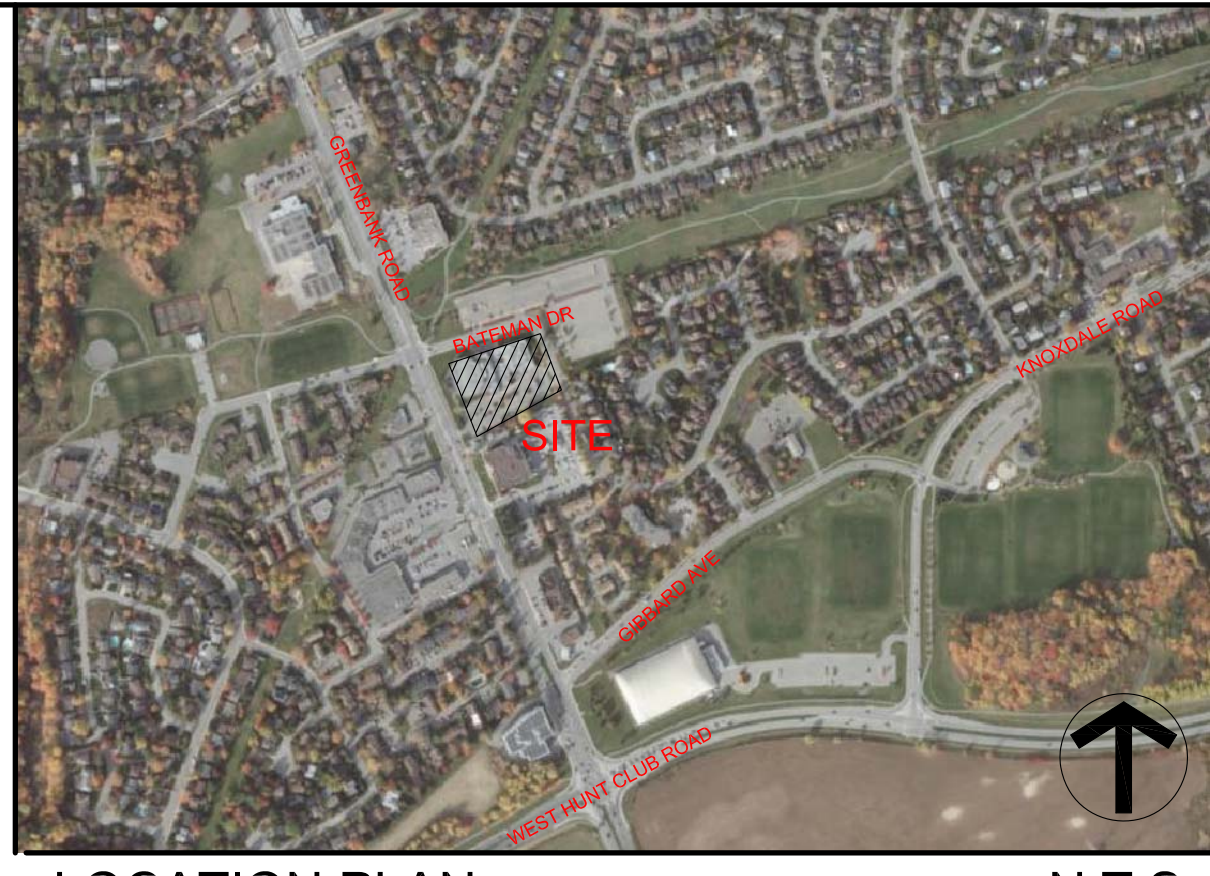
LOCATION PLAN N.T.S.

TREE CANOPY COVER DATA (PROJECTION ASSUMED AT 40 YR. MATURITY) LARGE DECIDUOUS TREES: 10m Dia. Spread 78m 2 per x 6 = 468m 2 CONIFEROUS TREES: 4.5m Dia. Spread 16m 2 per x 3 = 48m 2 TOTAL TREE CANOPY COVER: 516m 2 DEVELOPMENT SITE AREA minus BLDG. FOOTPRINT: 1597m 2 % TREE CANOPY COVER: 32.3