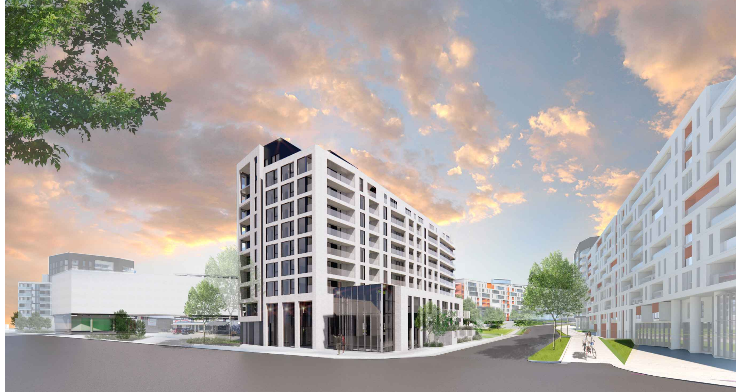
View 02 - CORNER MERIVALE ROAD AND THE NEW PUBLIC STREET