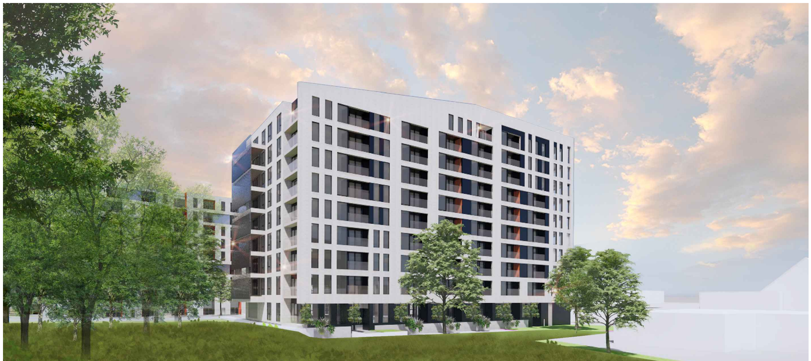
View 03 - FROM THE PUBLIC PARK