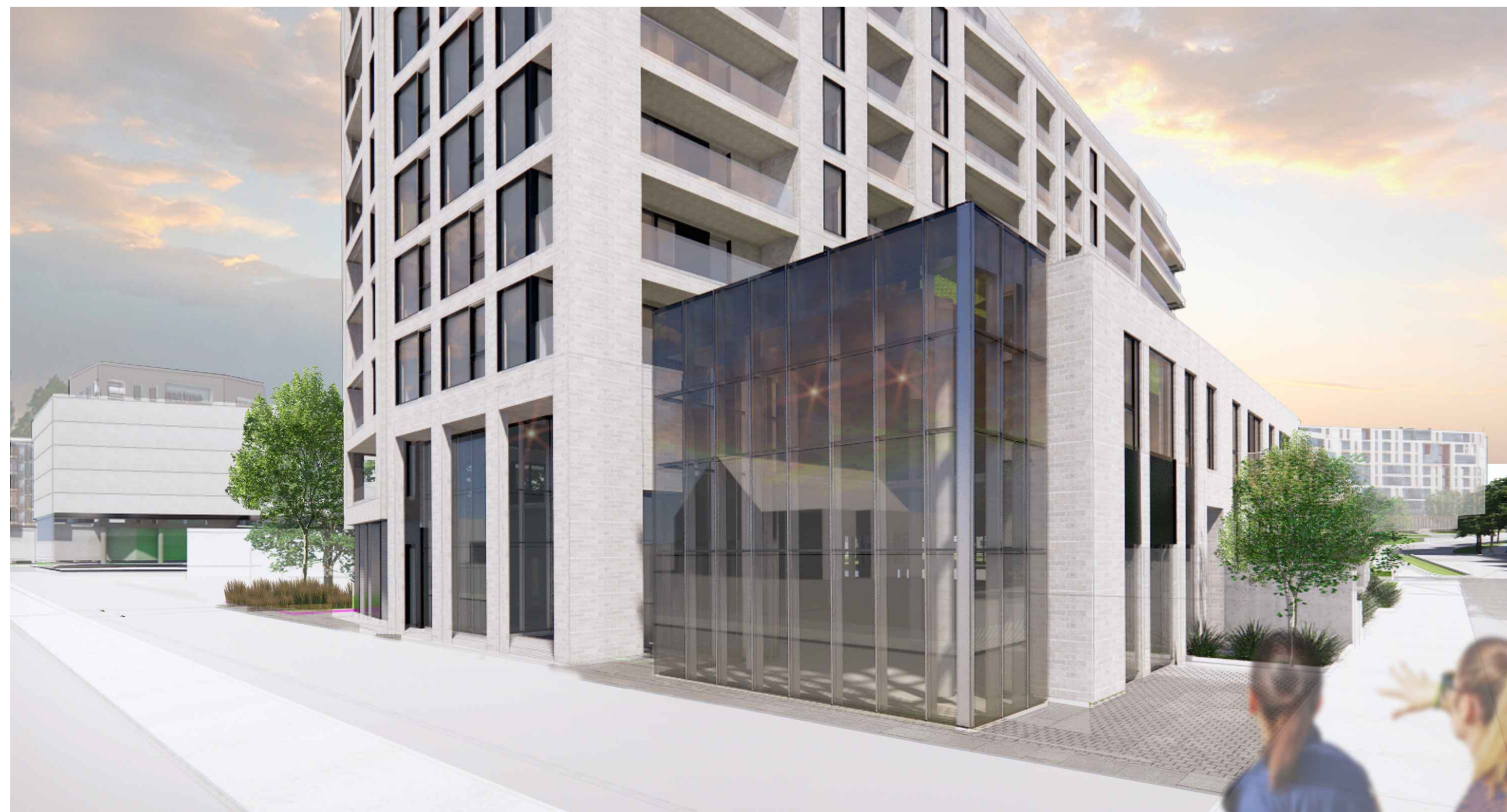
View 01 - CORNER MERIVALE ROAD - BUILDING ACCESS