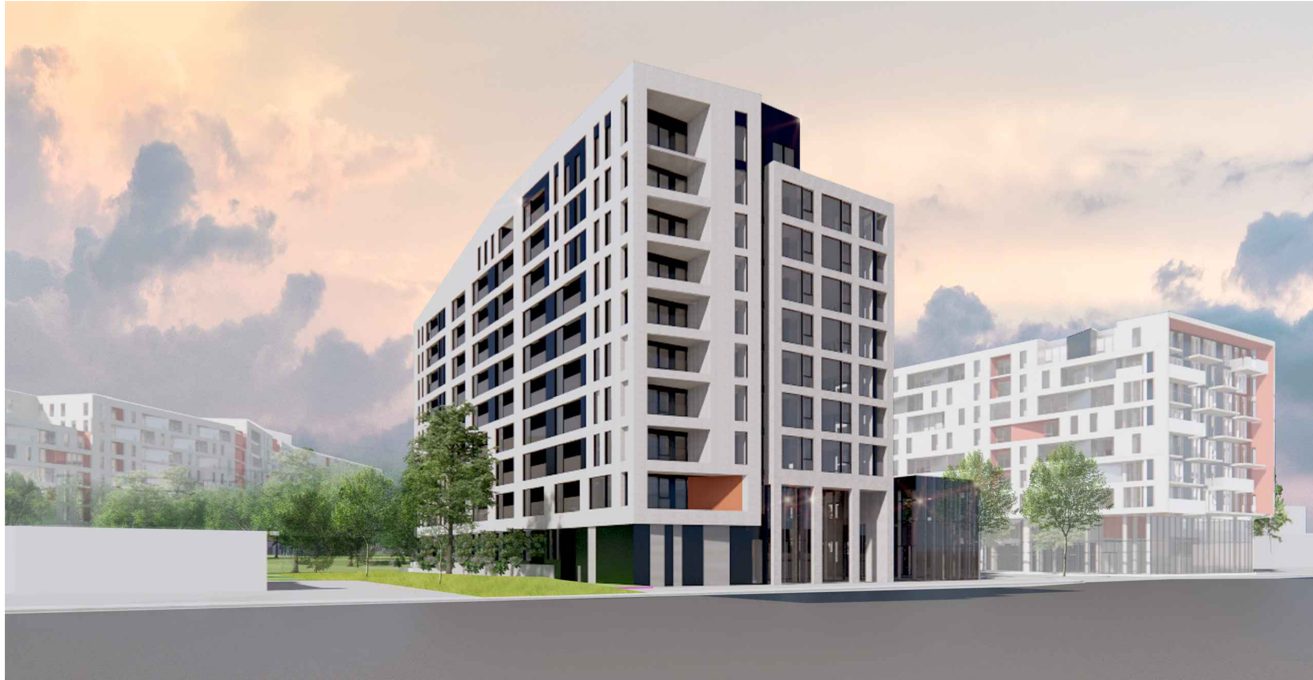
View 05 - SOUTH FROM MERIVALE ROAD