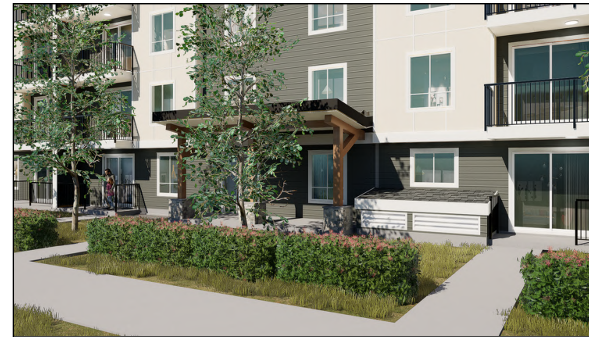
(3) STREET SIDE ENTRANCE