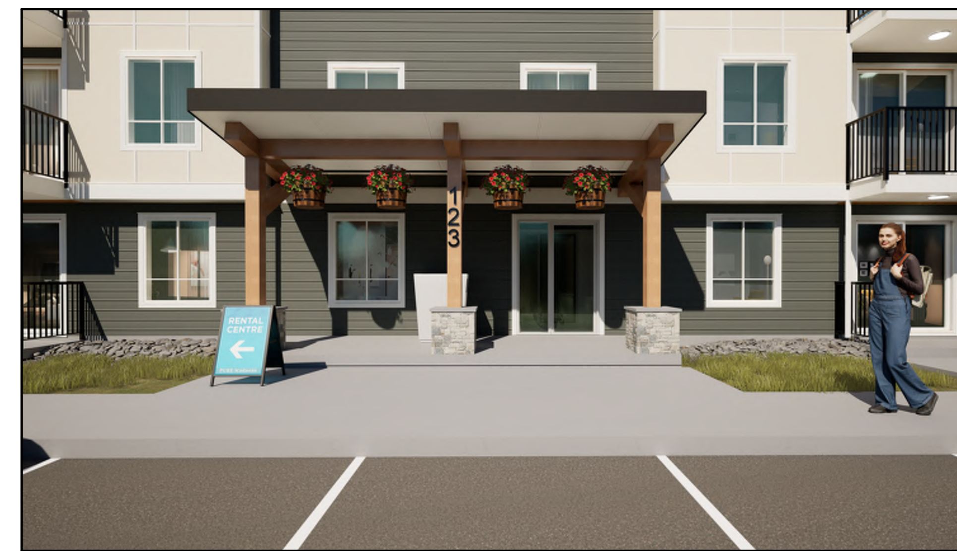
(4) PRINCIPAL ENTRANCE