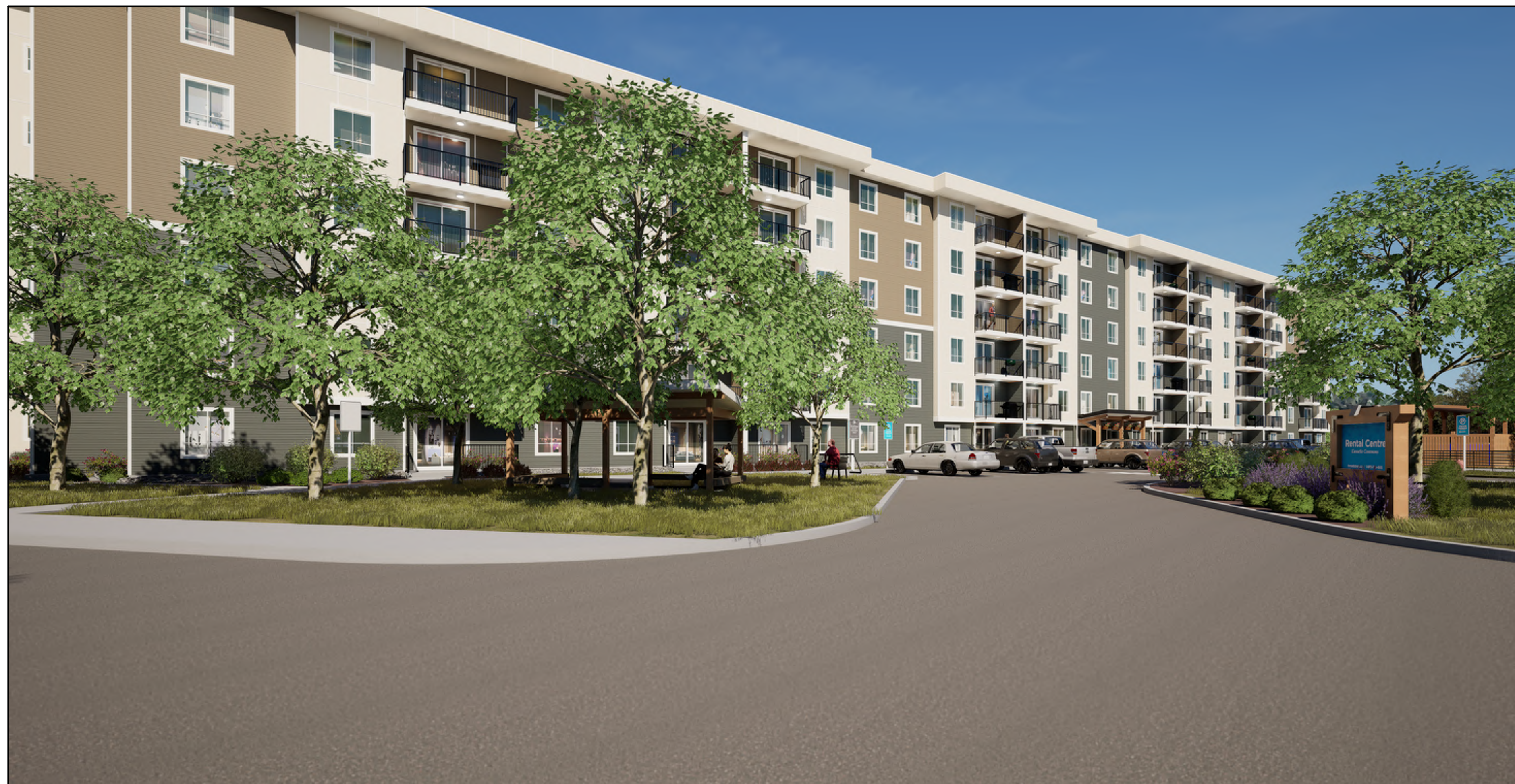
(2) EAST VIEW SITE ENTRANCE