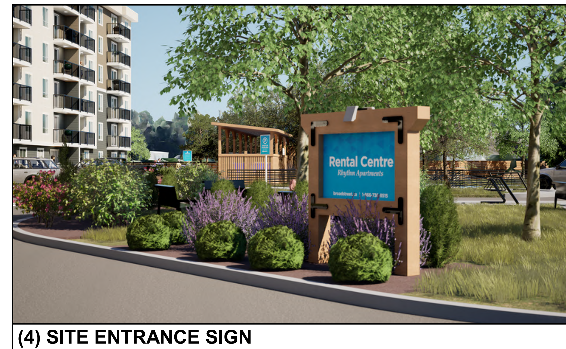
(4) SITE ENTRANCE SIGN