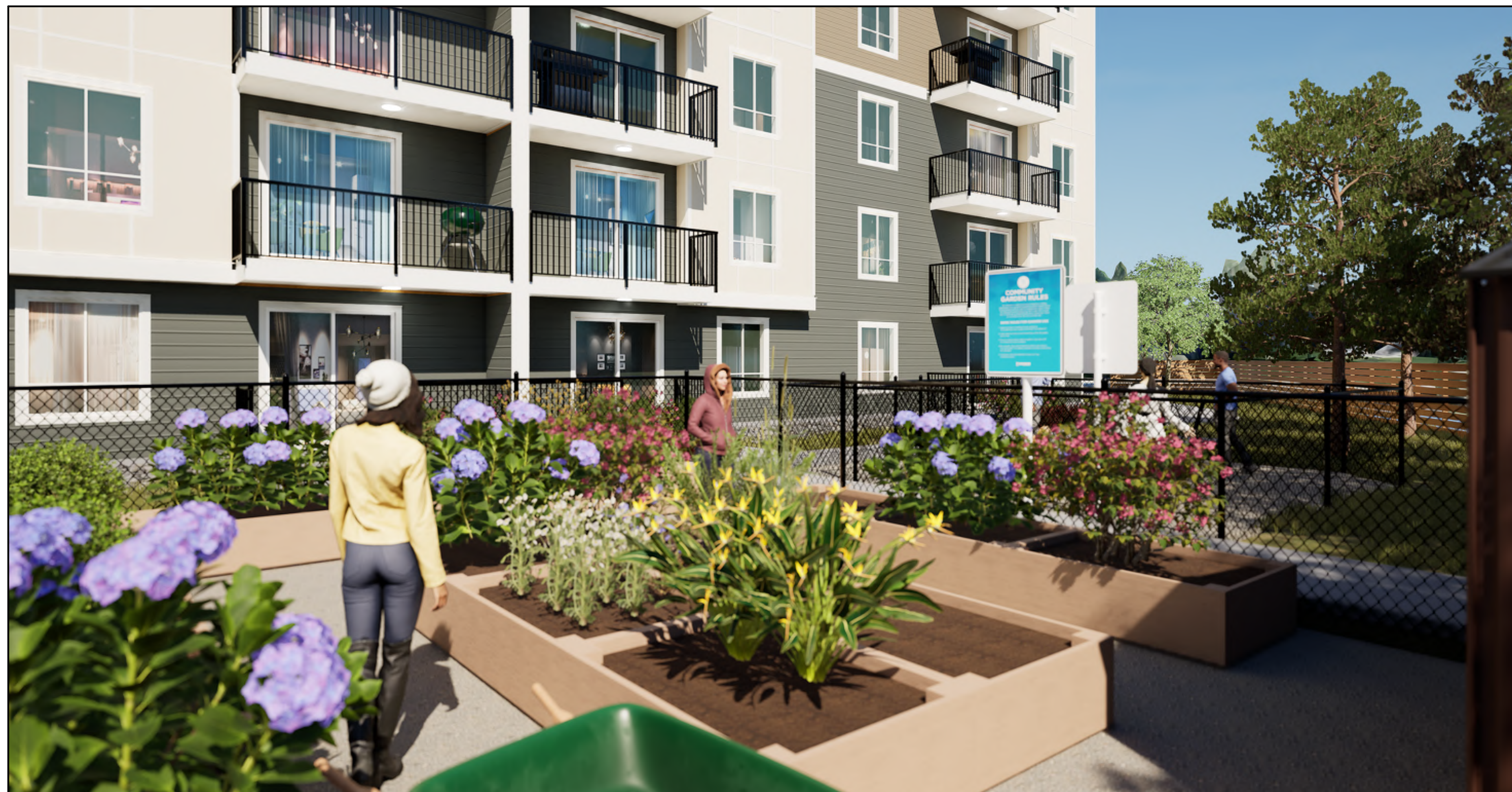
(2) COMMUNITY GARDEN