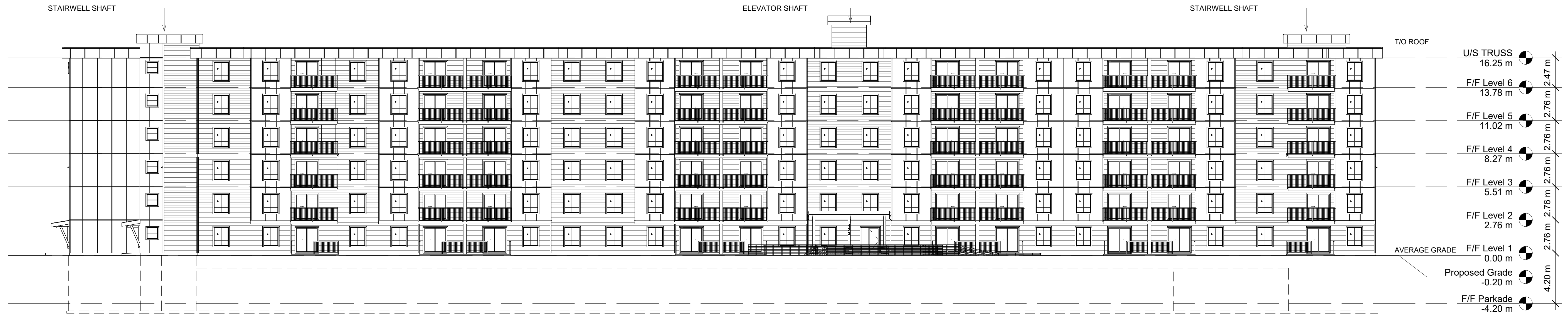
1 NORTH ELEVATION 1 : 175