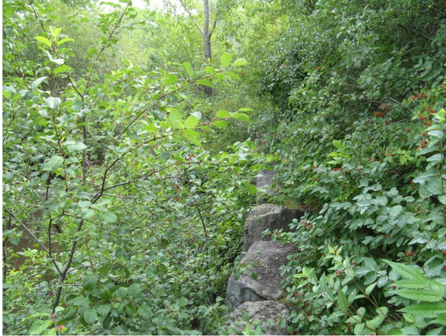
Photo 2 – South side of the Municipal Drain corridor to the north of the site, with large boulder retaining wall. View looking east, with site beginning 7.5 metres from wall