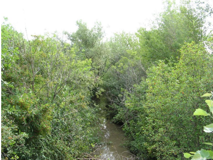
Photo 1 - South Cyrville Municipal Drain immediately to the north of the site. View looking east from the northwest entrance to the site

Wildlife observed during the July 11 th survey included American crow, ring-billed gull, grey catbird, house sparrow, European starling, American robin, northern cardinal, and American goldfinch. No stick nests or other evidence of raptor utilization or trees with suitable wildlife cavities were observed.