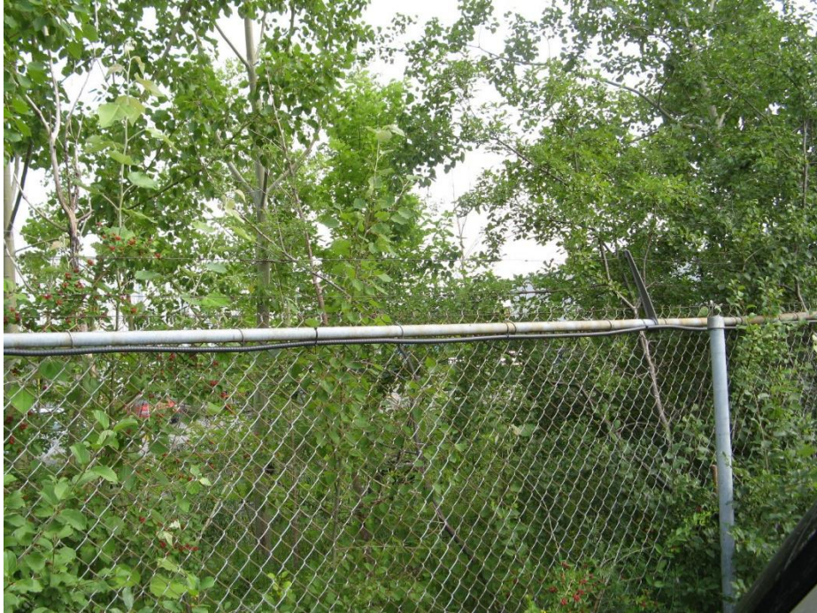
Photo 4 – The Municipal Drain corridor is protected with a chain-link fence along the north property line. This area has fewer trees and plantings are recommended to increase the diversity of the buffer function. View looking north