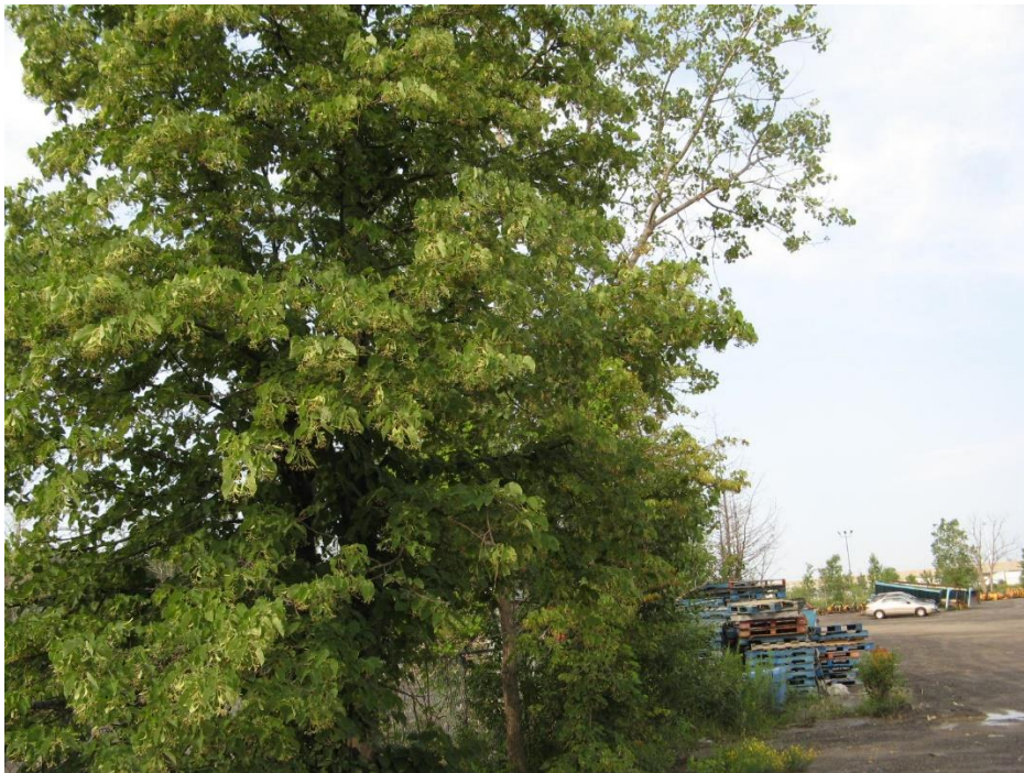
Photo 7 – Cottonwood along southeast boundary of the site. View looking west