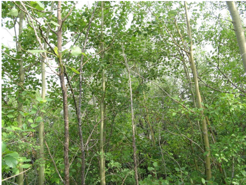
Photo 3 – The corridor between the Municipal Drain and the site is generally well treed with young poplars. View looking north from the centre of the north property line