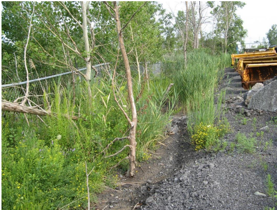
Photo 5 – Dry ditch along the west boundary of the site. View looking north