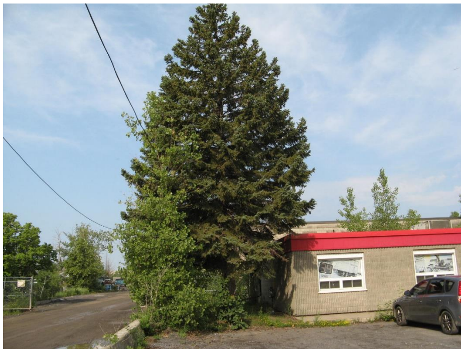
Photo 8 – White spruce in the east portion of the site, west of Star Top Road was the largest tree observed on or adjacent to the site. View looking west