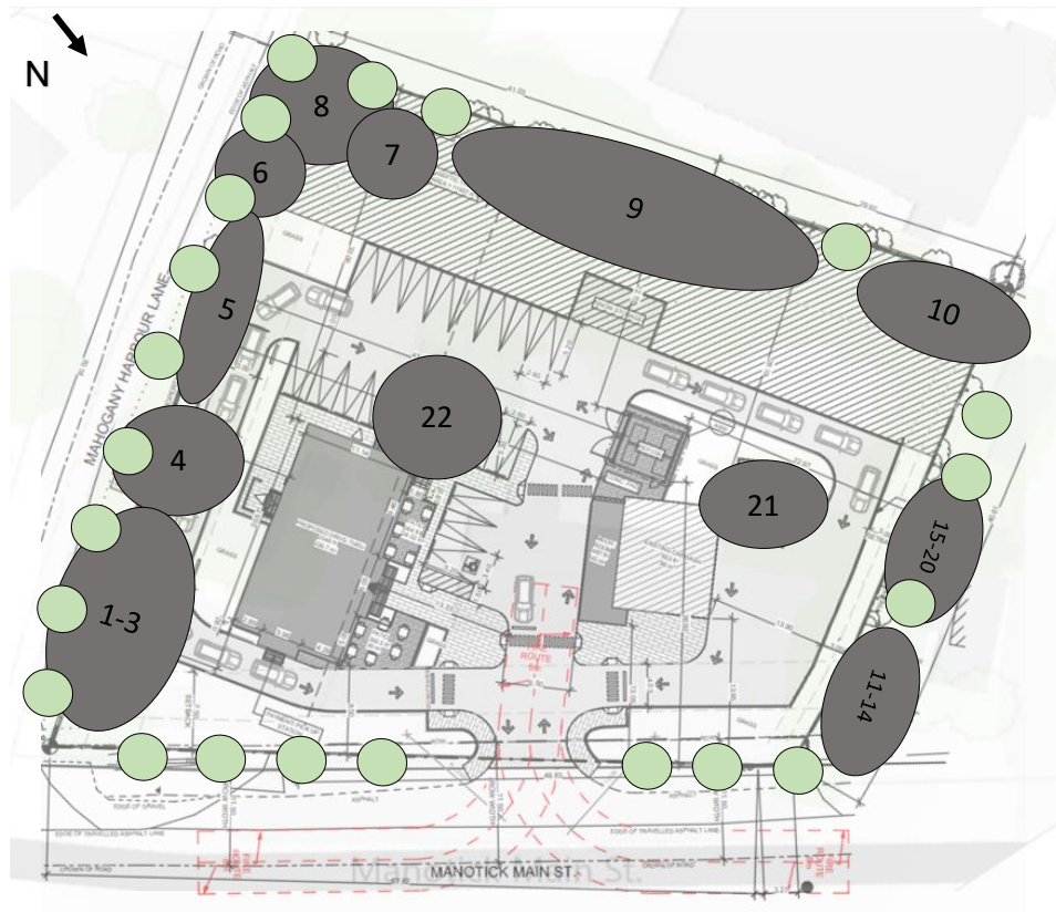
Map #2: Overlay of development plans onto area map.

Trees to be planted Trees or clusters to trees to be removed