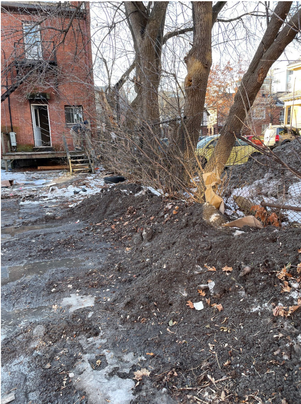
Figure 1: Image showing the compacted soil on the subject property