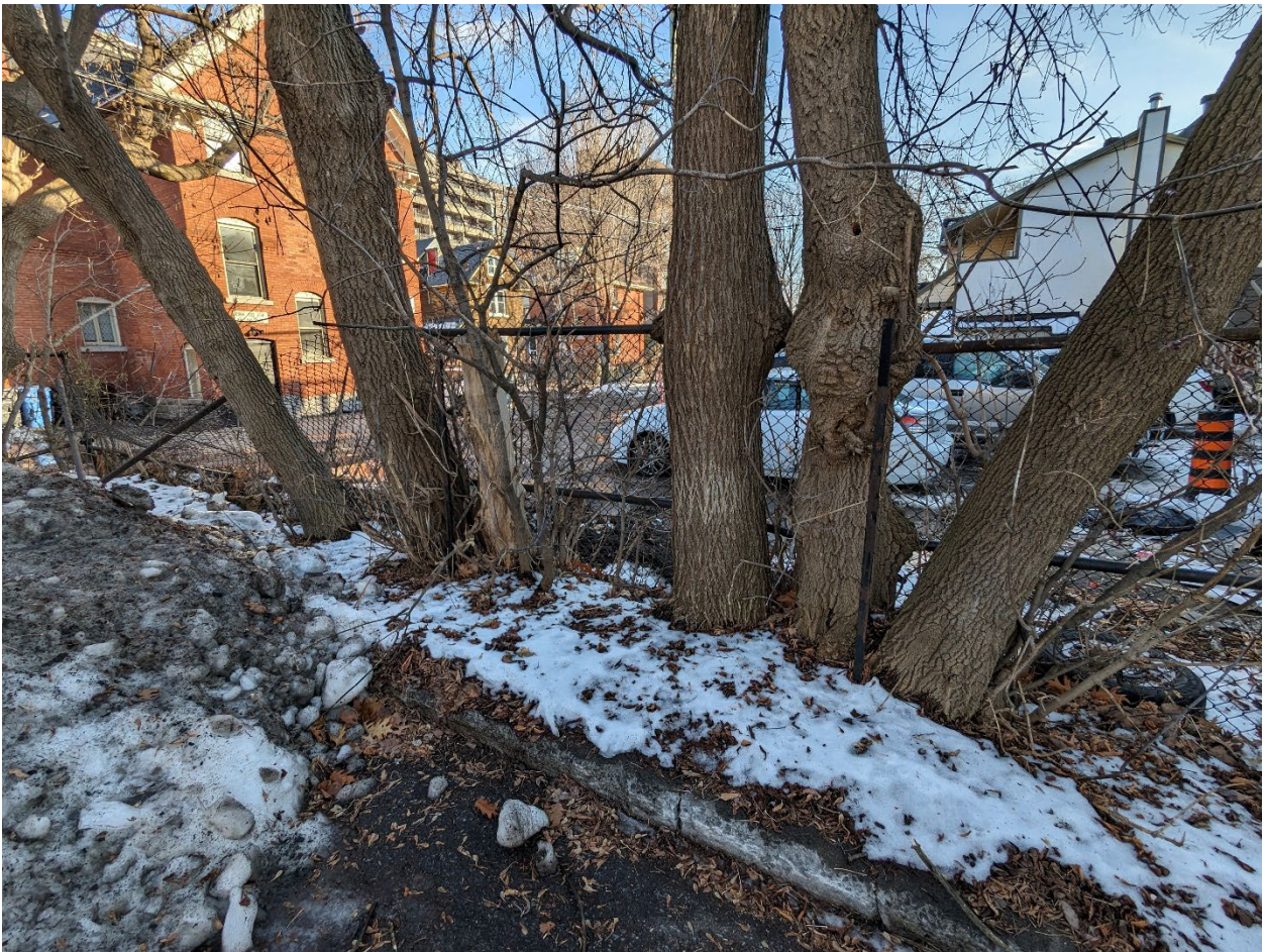
Figure 2: Image showing trees looking from the adjacent property