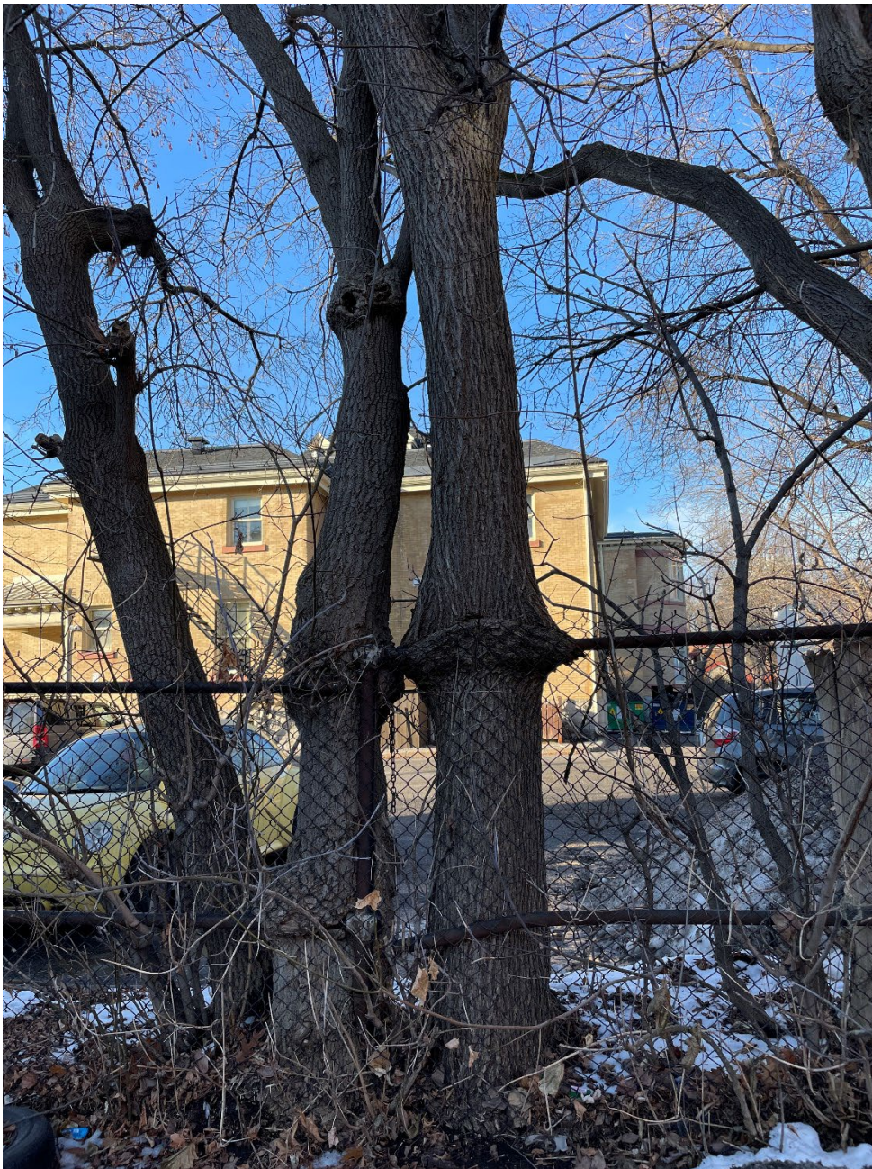
Figure 3 Trees 4 and 5 growing around the fence