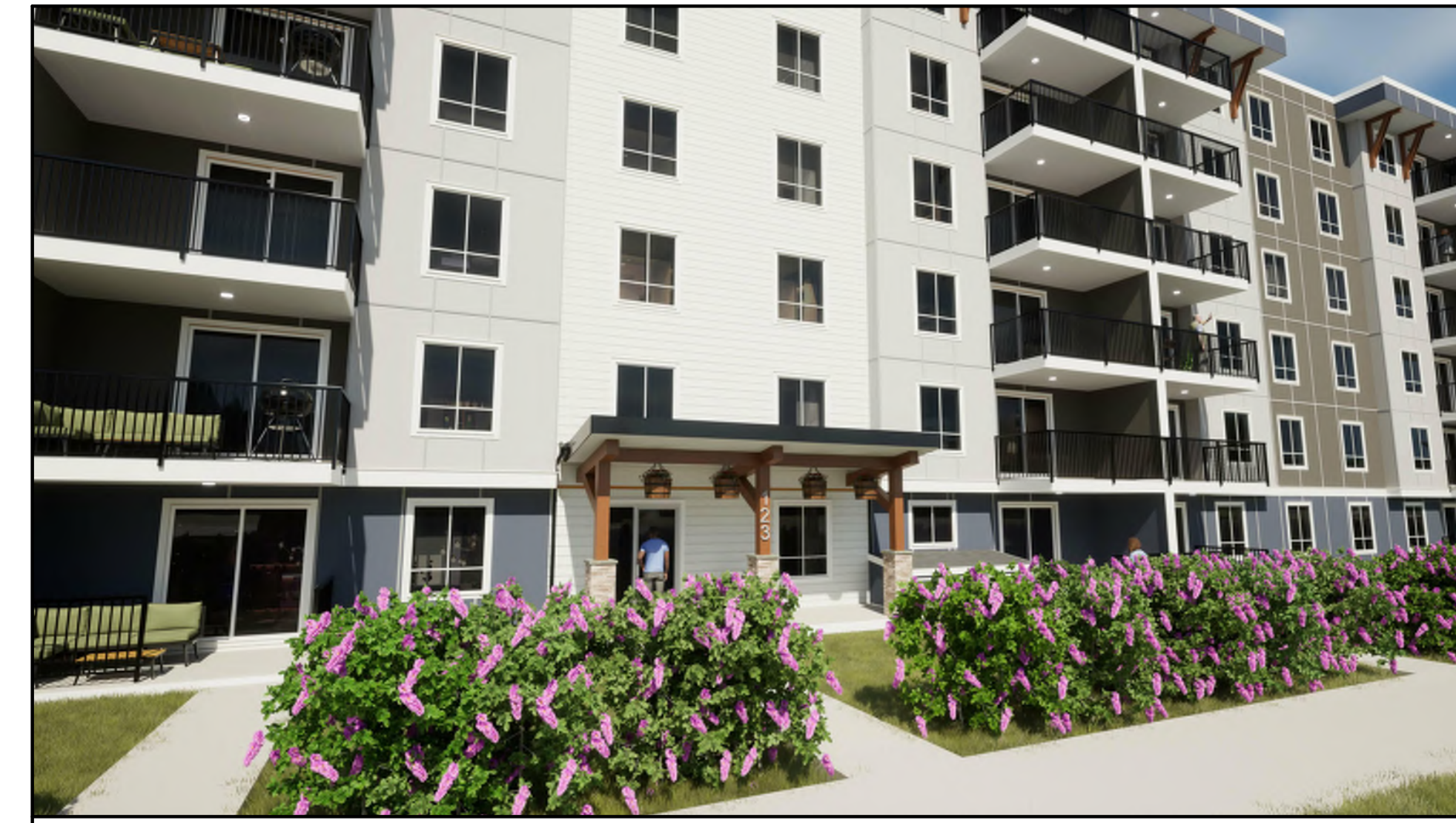
(3) STREET SIDE ENTRANCE