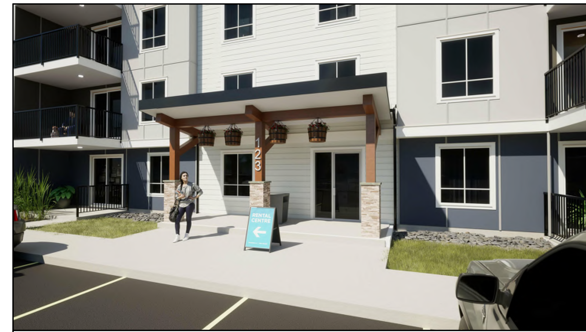
(4) PRINCIPAL ENTRANCE