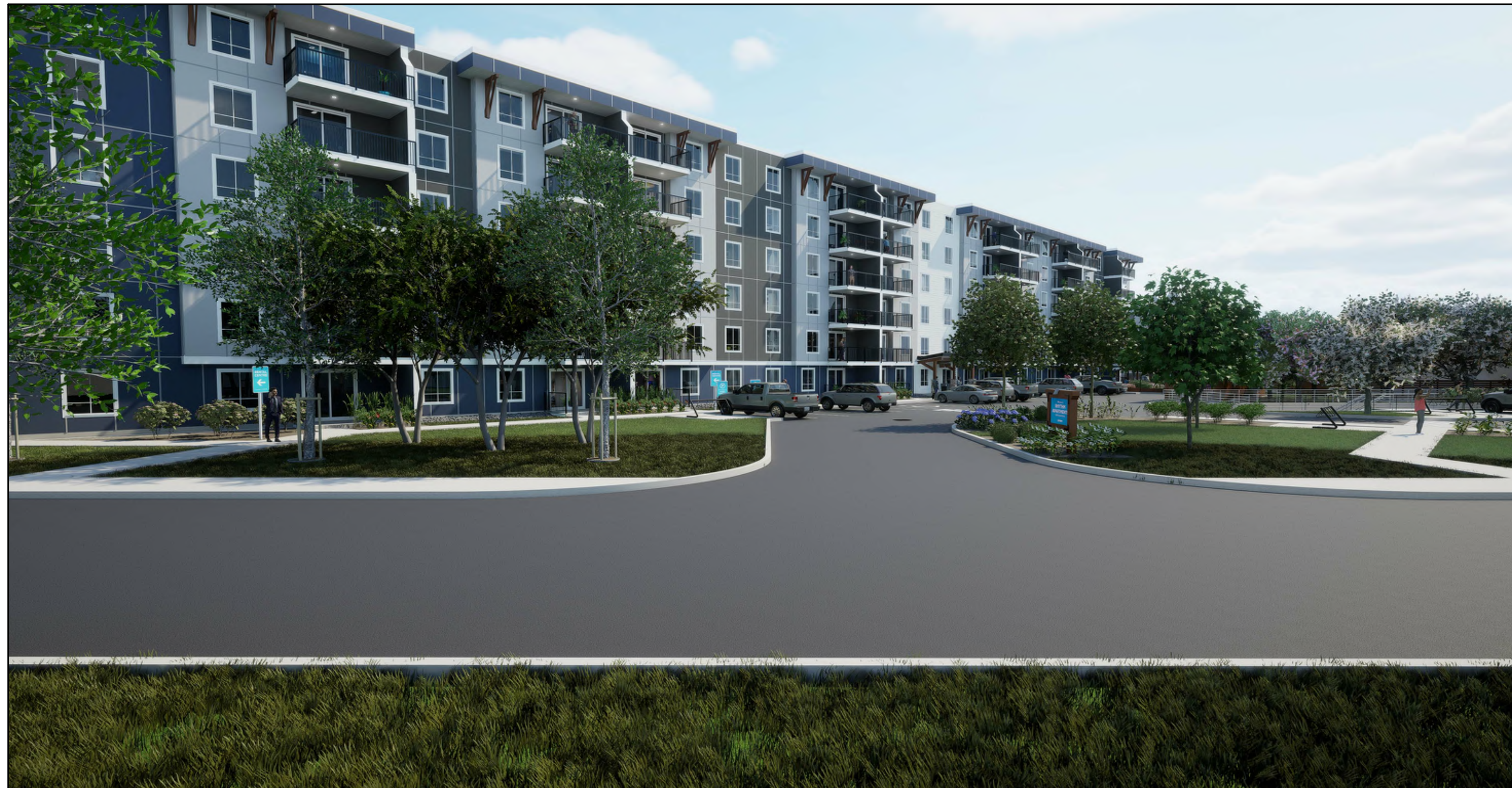
(2) EAST VIEW SITE ENTRANCE