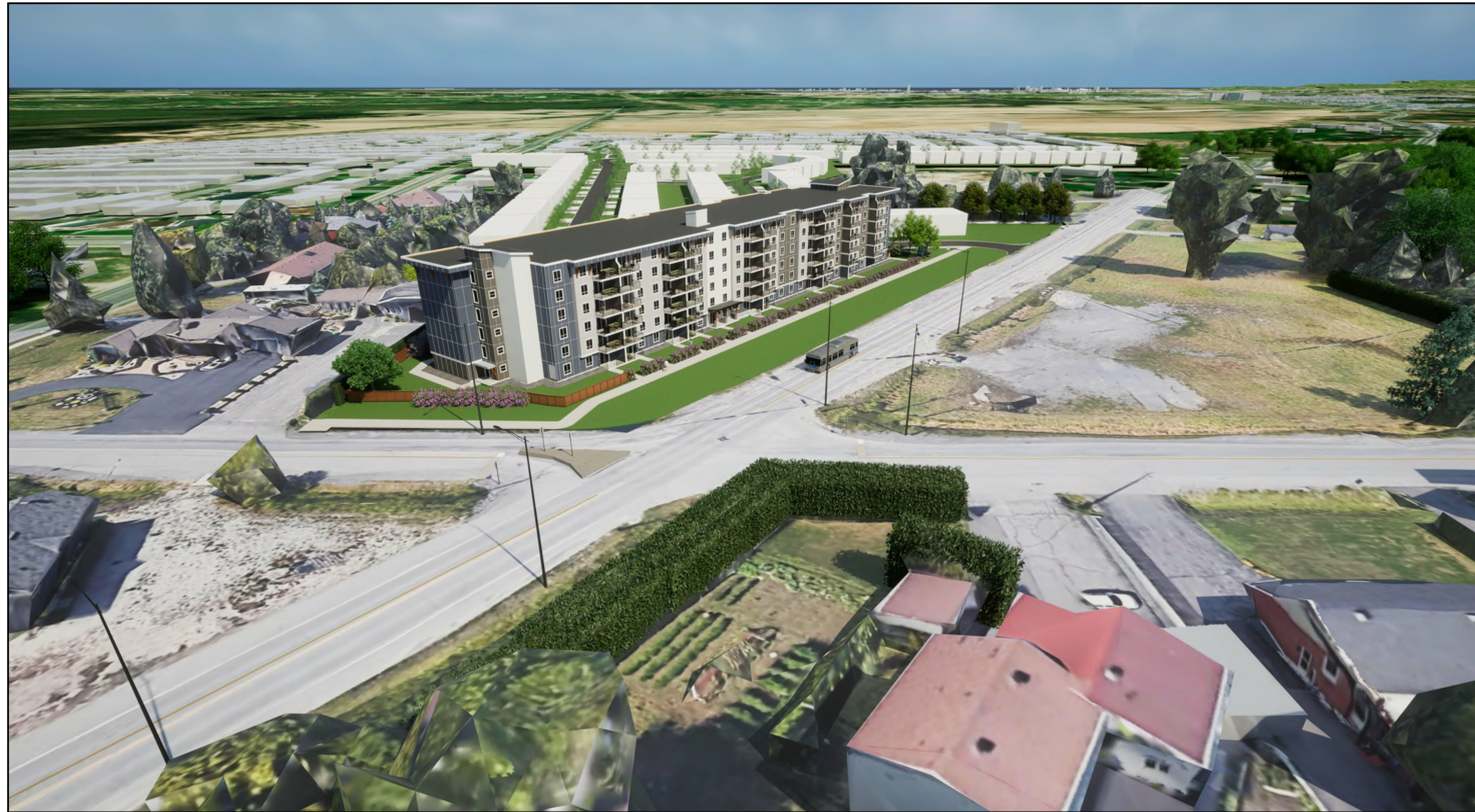
(1) WEST VIEW OF STREET SIDE ENTRANCE