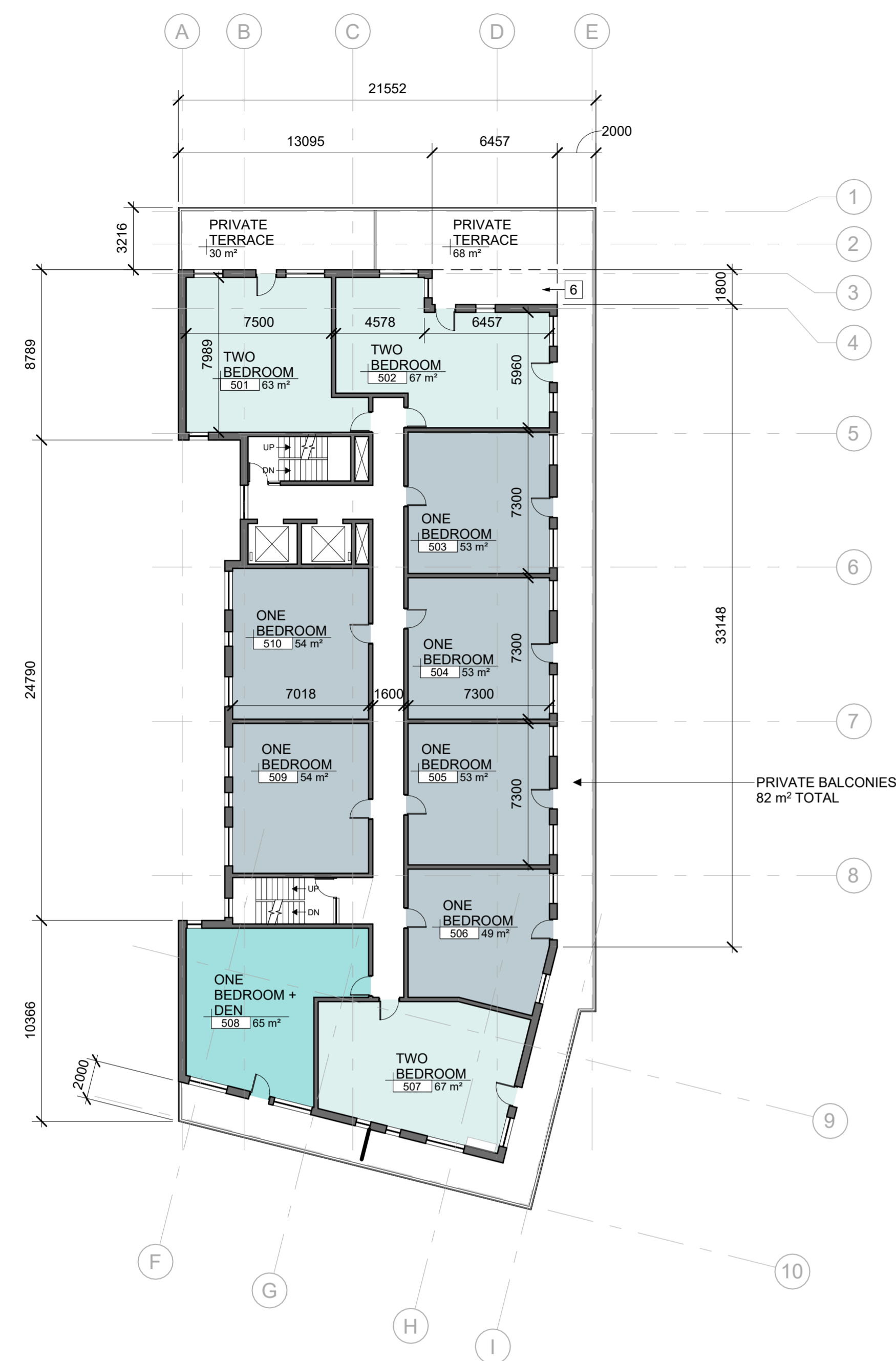
1 FIFTH FLOOR PLAN