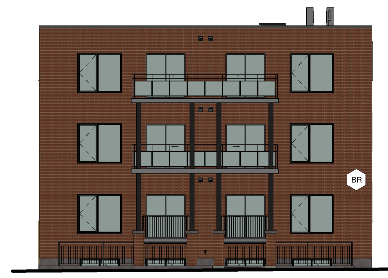
4 WEST ELEVATION A300 | 1:100