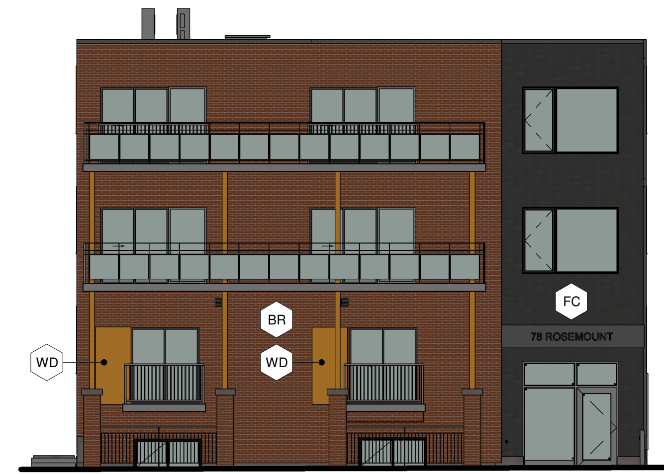
2 EAST ELEVATION A300 | 1:100