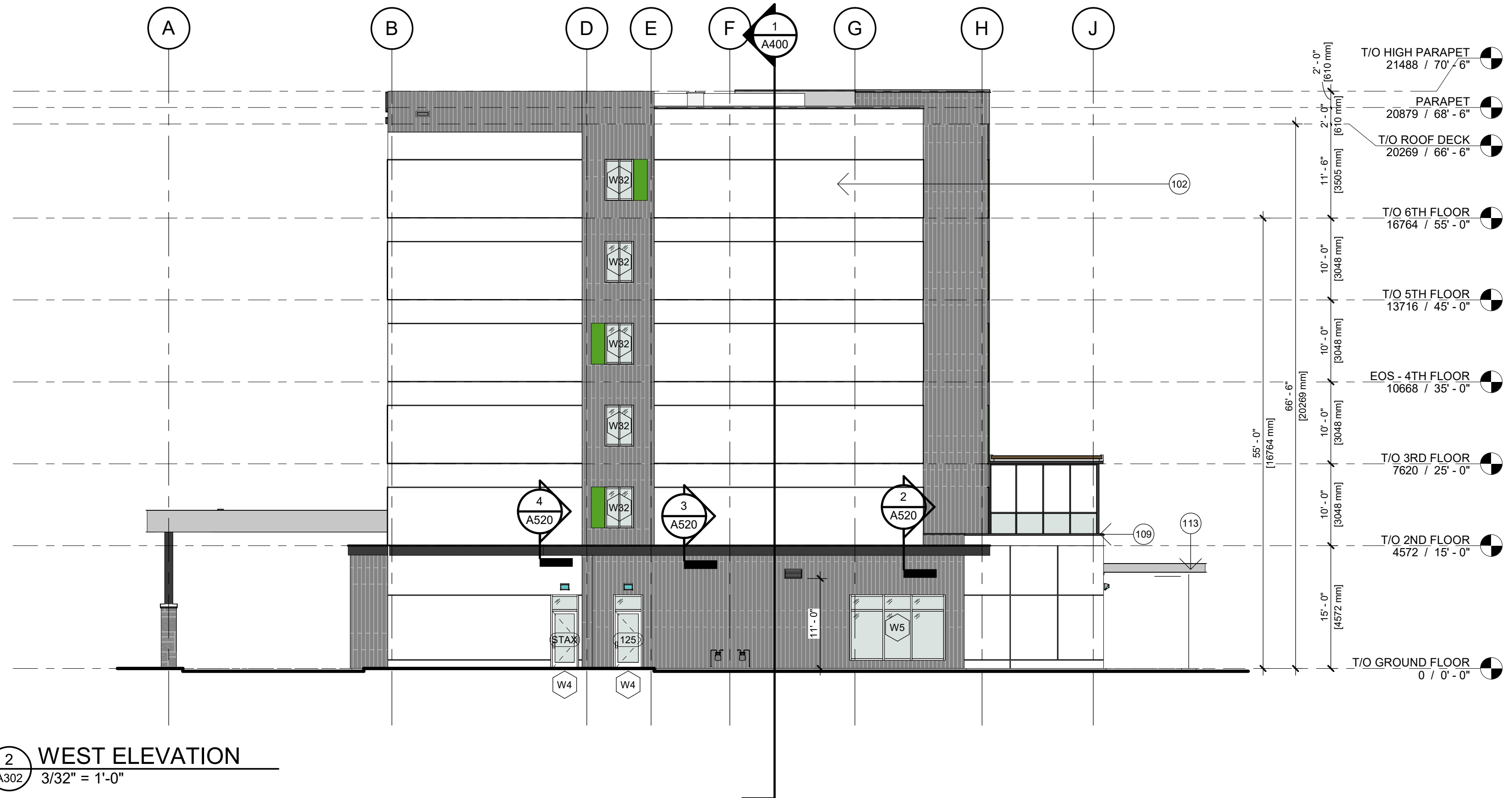
2 WEST ELEVATION A302 3/32" = 1'-0"

BIRD COLLISION DETERRENCE: MINIMUM 90% OF ALL GLAZING FROM GRADE LEVEL TO 18M ABOVE GRADE TO RECEIVE 4mm VISUAL MARKERS APPLIED TO FIRST SURFACE OF THE GLASS WITH A MAXIMUM SPACING OF 50mm X 50mm AS PER OTTAWA BIRD SAFE DESIGN GUIDELINES, GUIDELINE 2. ALL EXTERIOR BUILDING LIGHTING TO BE: DARK SKY COMPLIANT, FULL-CUTOFF CONNECTED TO MOTION DETECTORS OR OTHER AUTOMATIC LIGHTING CONTROLS TO EXTINGUISH NON-ESSENTIAL LIGHTING BETWEEN 11PM AND 6AM MINIMUM WATTAGE REQUIRED TO MEET ONTARIO BUILDING CODE PER OTTAWA BIRD SAFE DESIGN GUIDELINES, GUIDELINE 6