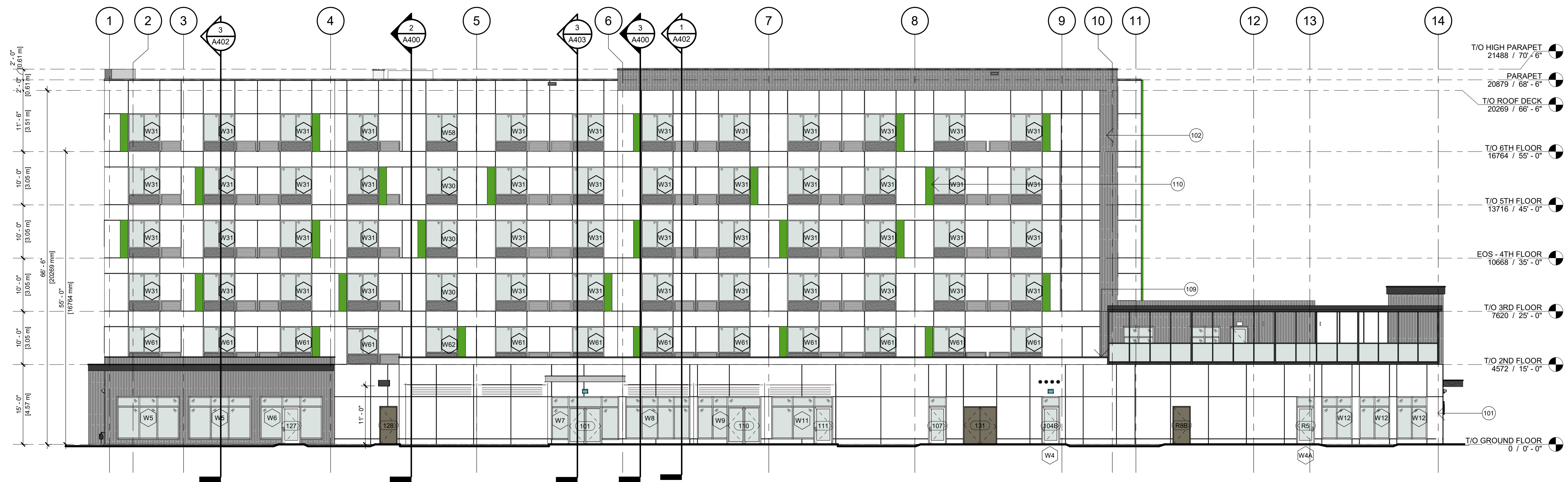
1 SOUTH ELEVATION A302 3/32" = 1'-0"