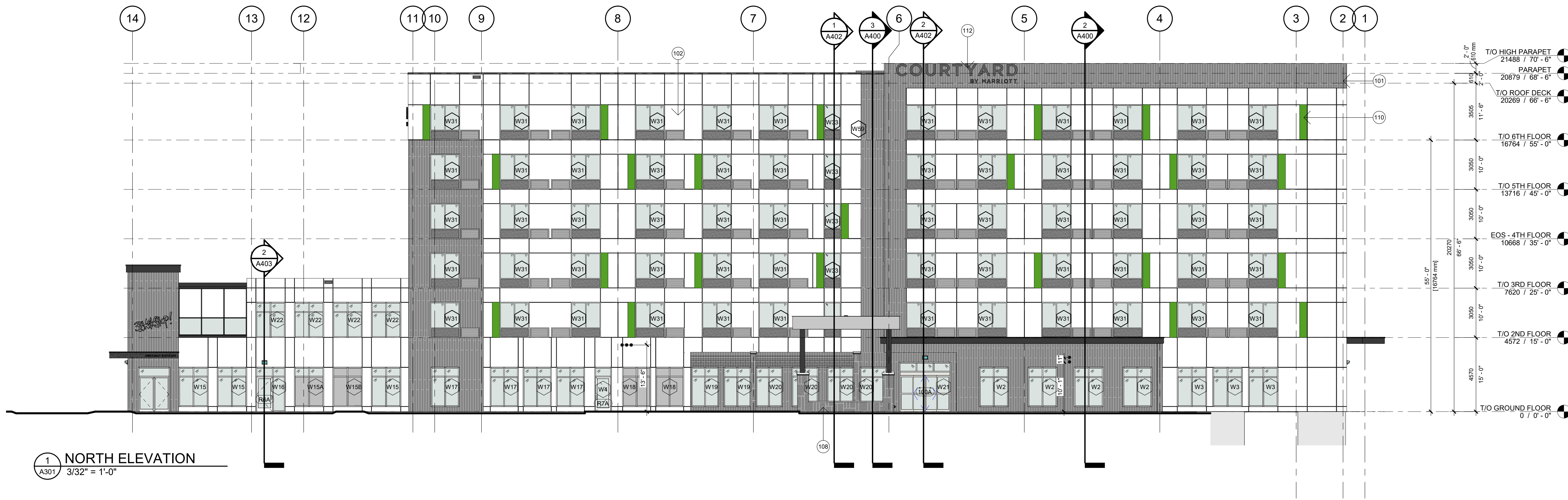
1 NORTH ELEVATION A301 3/32" = 1'-0"