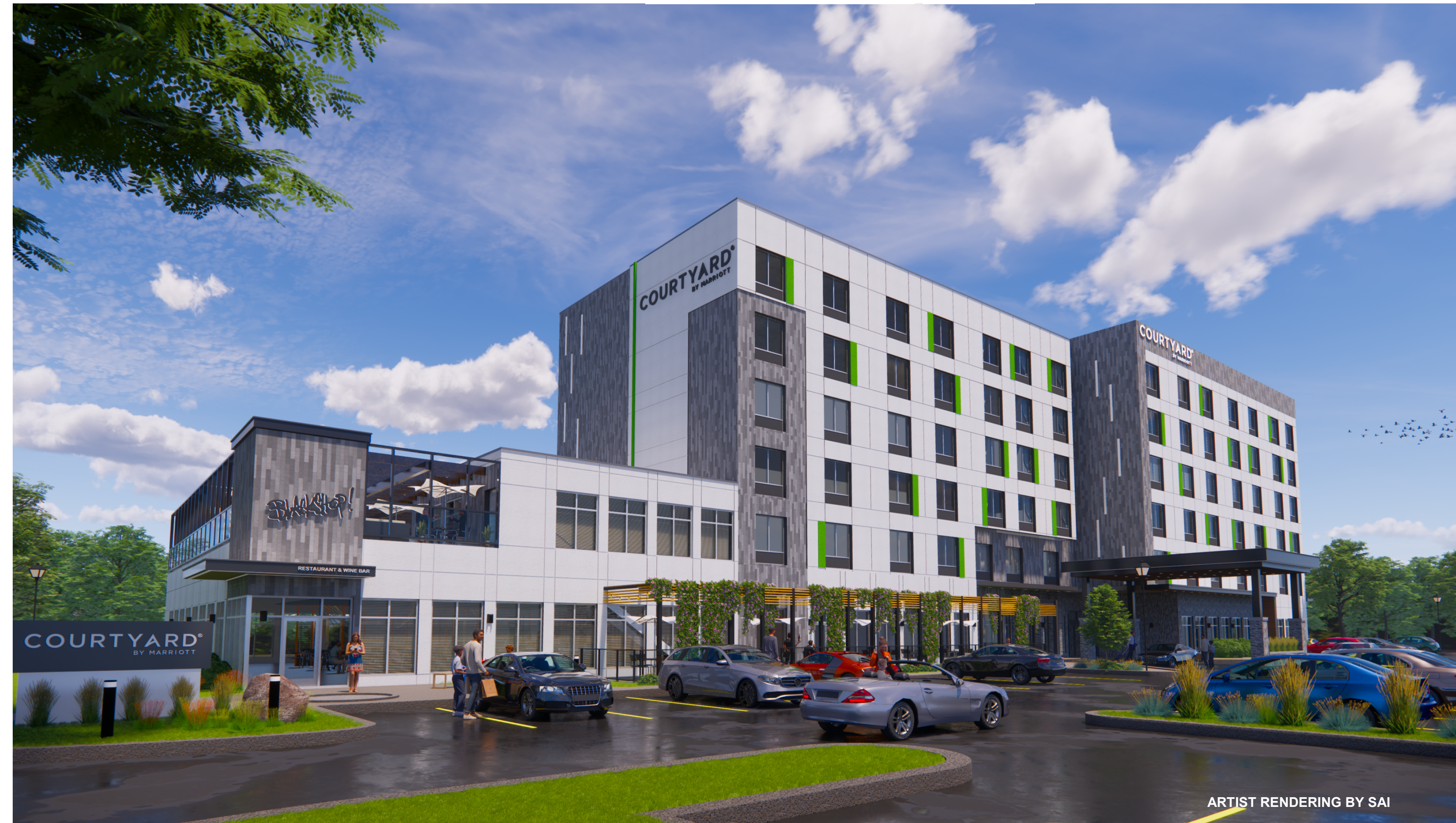
ARTIST RENDERING BY SAI