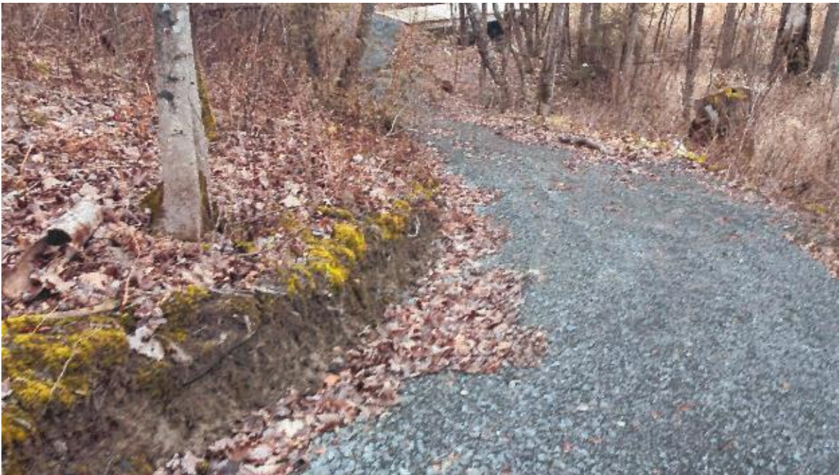
Photo No. 17 – Erosion of cut downhill of pathway. Cut approximately 30 m long x 0.3 m high.