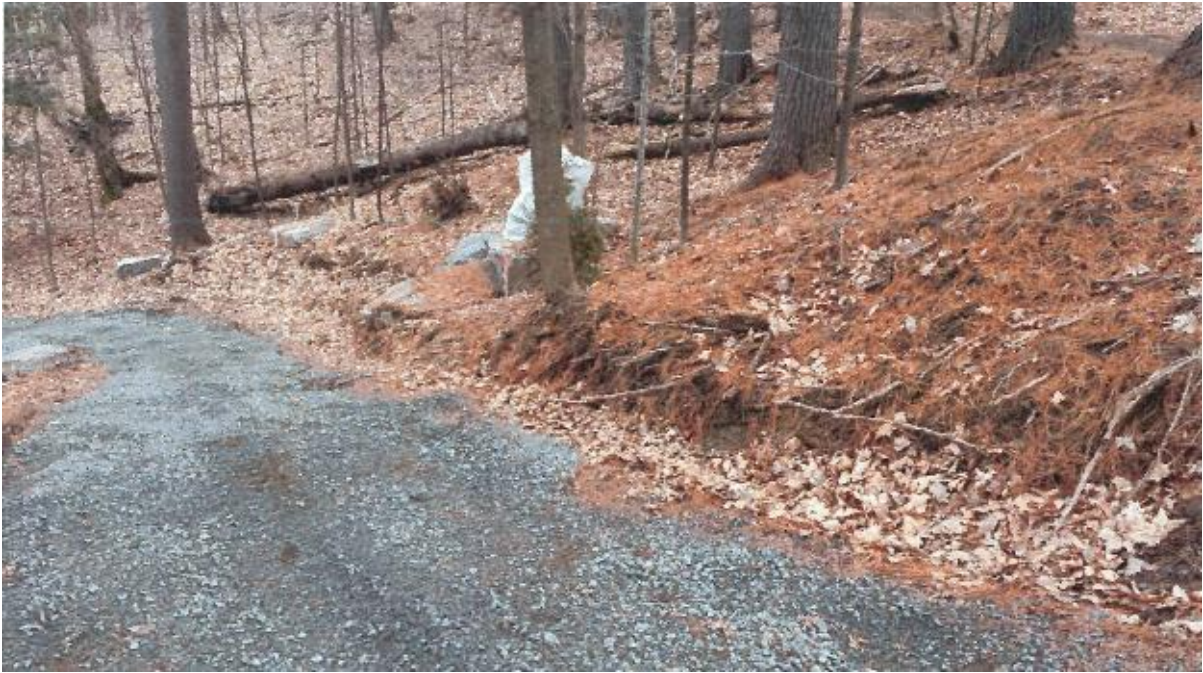
Photo No. 1 – Erosion of cut uphill of the pathway. Cut approximately 18 m long x 0.3 m high