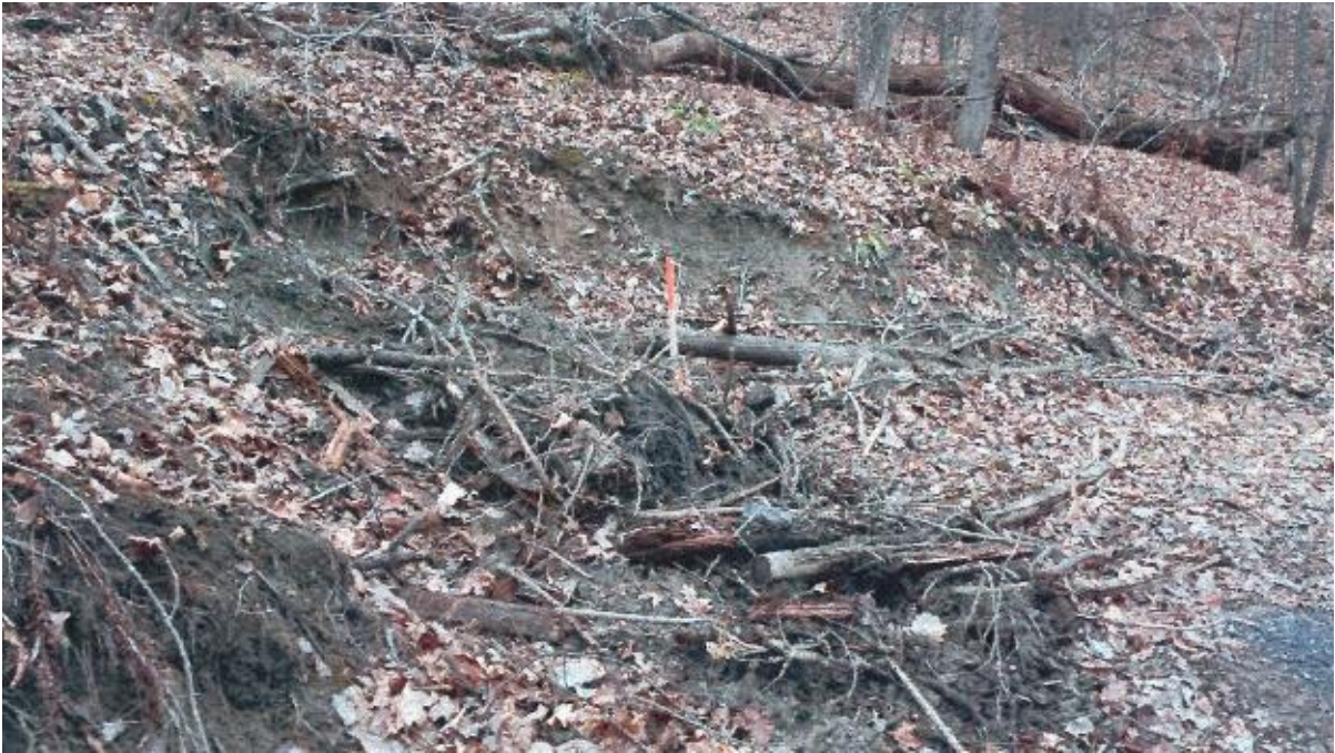
Photo No. 3 – Erosion above pathway approximately 5 m long x 0.4 to 1.0 m high