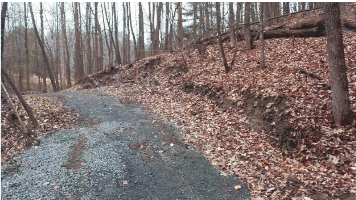
Photo No. 2 – Erosion of cut uphill of pathway. Cut approximately 9 m long x 0.4 m high.