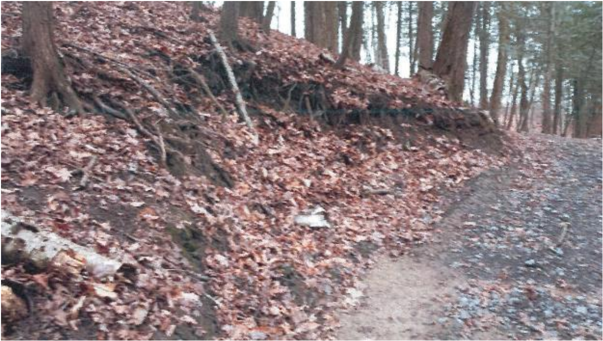
Photo No. 13 – Erosion of slope uphill of pathway. Area approximately 5 m long and 1 m to 1.5 m high.