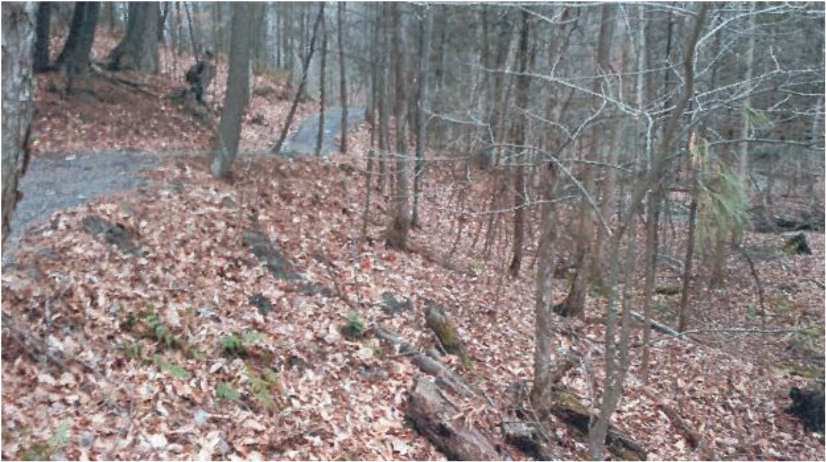
Photo No. 22 – Erosion below pathway. Cut approximately 30 m long x 0.5 to 2 m high.