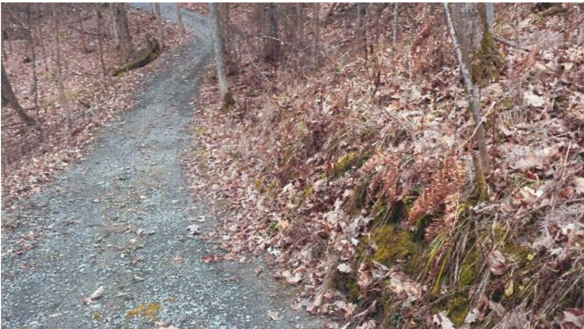
Photo No. 19 – Erosion of cut above pathway. Cut approximately 7 m long x 0.8 m high.