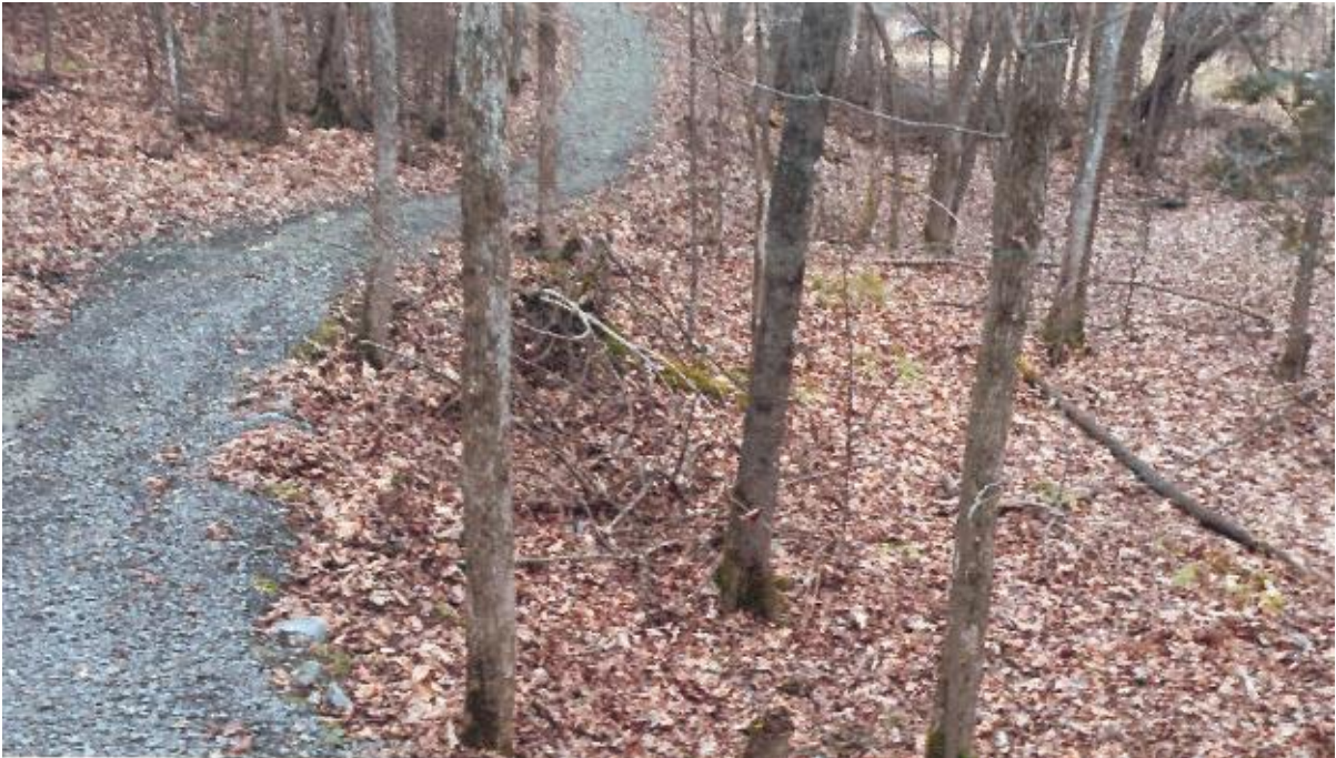
Photo No. 20 – Deep cut downhill of pathway. Cut approximately 12 m long x 0.5 m to 1 m high.