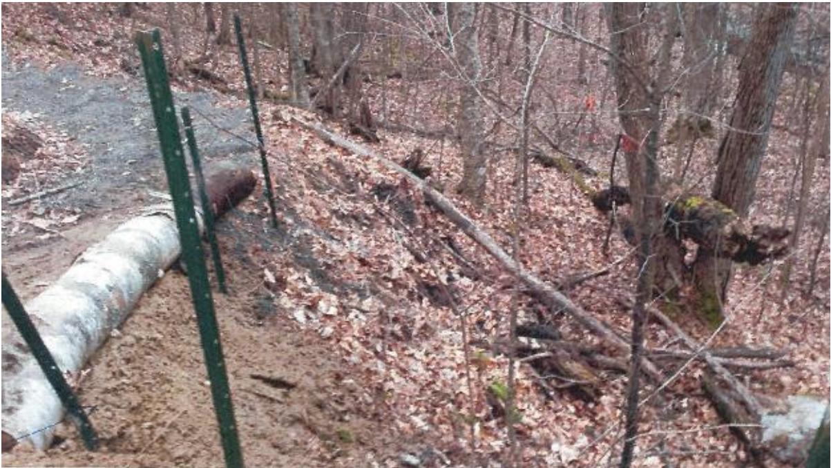
Photo No. 23 – Erosion of slope downhill of pathway. Area approximately 12 m long x 1.5 m to 2 m high.