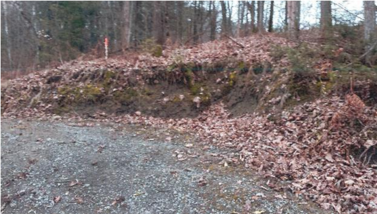
Photo No. 18 – Erosion of cut uphill of pathway. Cut approximately 3 m long x 1.2 m high.