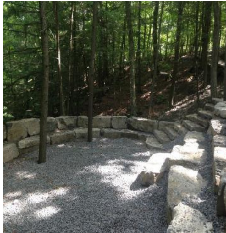
Photo No. 27 –Retaining walls across from the pond and the pathway.