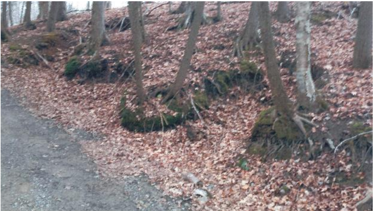
Photo No. 10 – Erosion of cut uphill of pathway. Cut approximately 20 m long x 0.4 m to 1.2 m high.