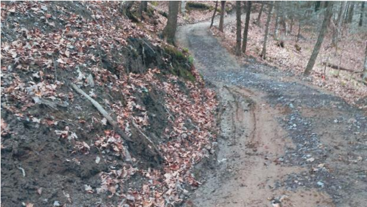
Photo No. 15 – Erosion of cut uphill of pathway. Area approximately 7 m long and 0.8 m to 1.6 m high.