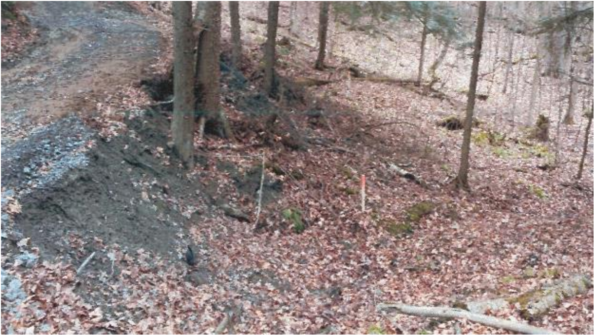
Photo No. 11 – Erosion of slope downhill of pathway. Approximately 18 m long x 1 m to 2 m high.