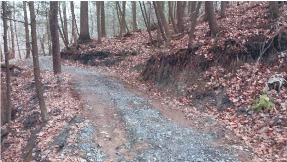
Photo No. 6 – Erosion of cut uphill of pathway. Cut approximately 16 m long x 0.5 m to 1 m high.