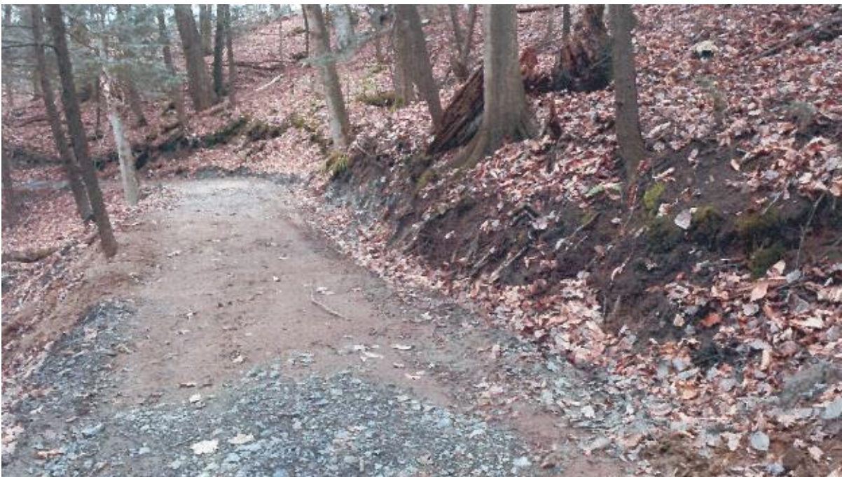
Photo No. 8 – Erosion of cut uphill of pathway. Cut approximately 42 m long x 0.5 m to 1.3 m high.