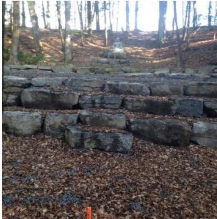
Photo No. 28 – Terraced retaining wall at the Buddhist Meditation section.