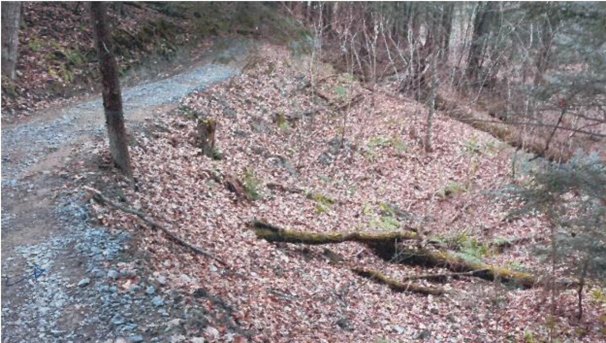
Photo No. 7 – Erosion of slope downhill of pathway. Area approximately 30 m long x 1 m to 3 m high.