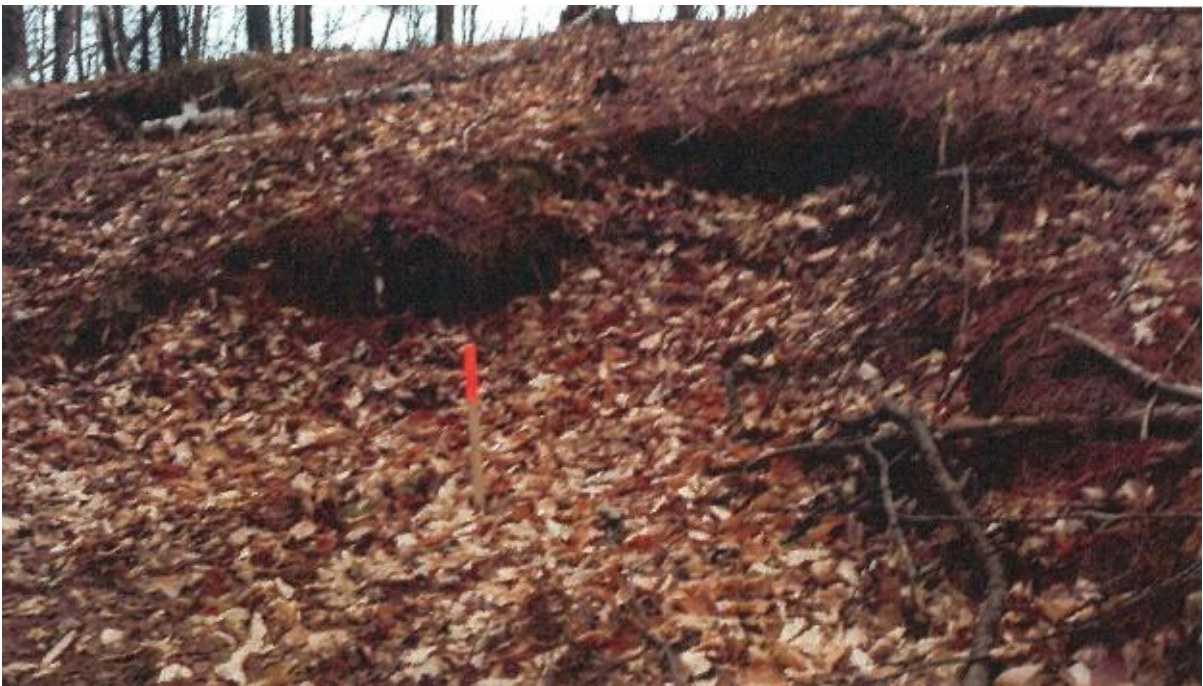
Photo No. 25 – Erosion of cut above pathway. Cut approximately 4 m long x 0.6 m high.