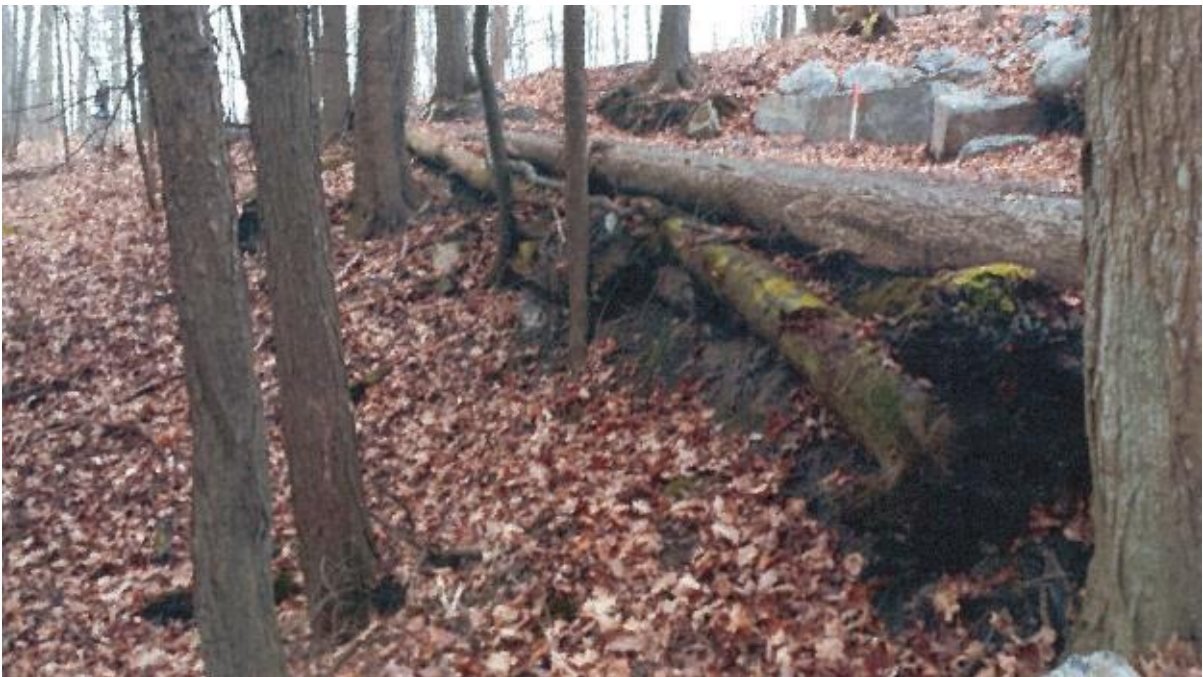
Photo No. 14 – Erosion of slope downhill of pathway. Note placement of logs to prevent erosion.