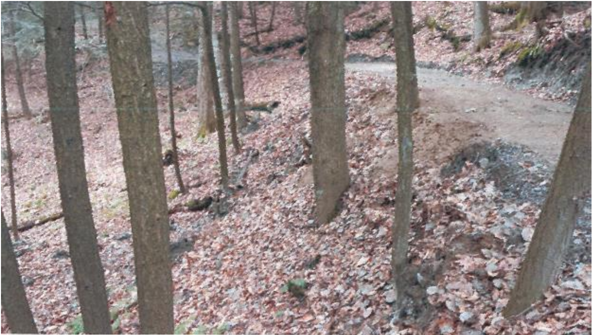
Photo No. 9 – Erosion of slope downhill of pathway. Area approximately 30 m long by 2 m to 3 m high.