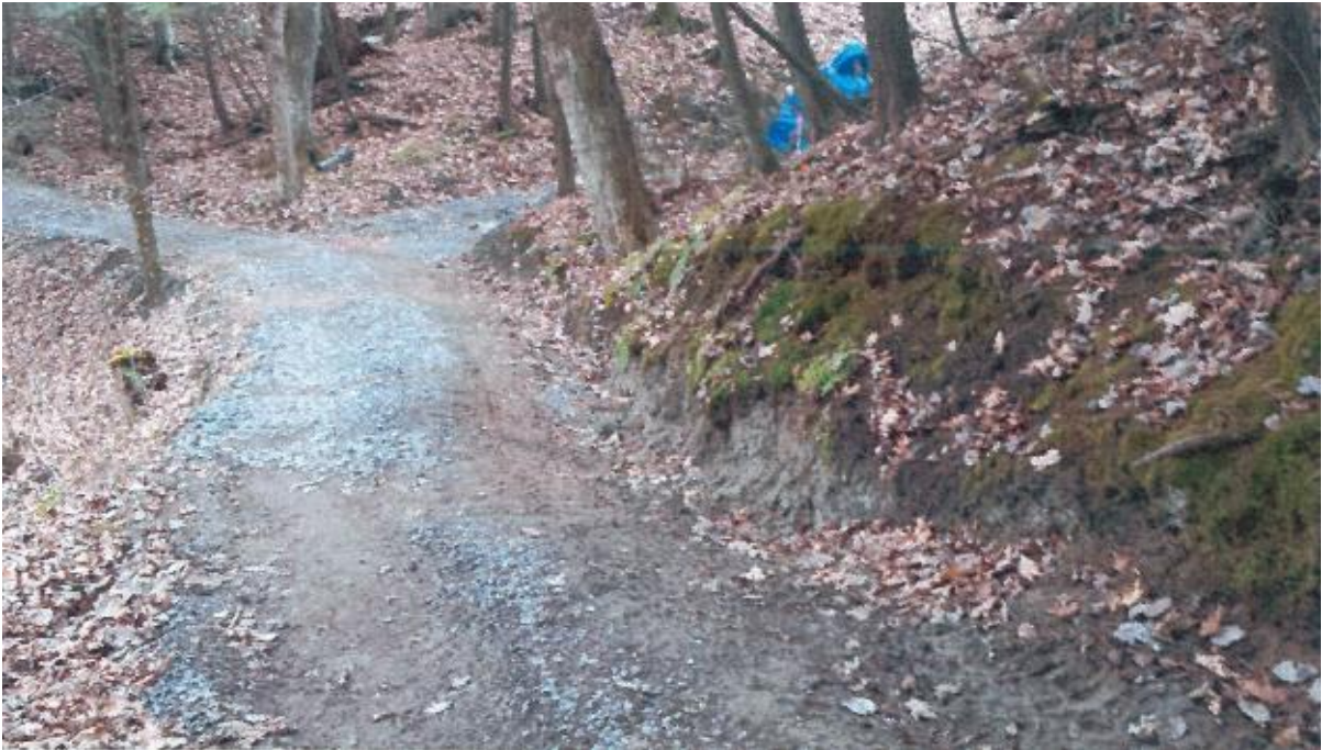
Photo No. 5 – Erosion of cut uphill of pathway. Cut approximately 12 m long x 0.9 m high.