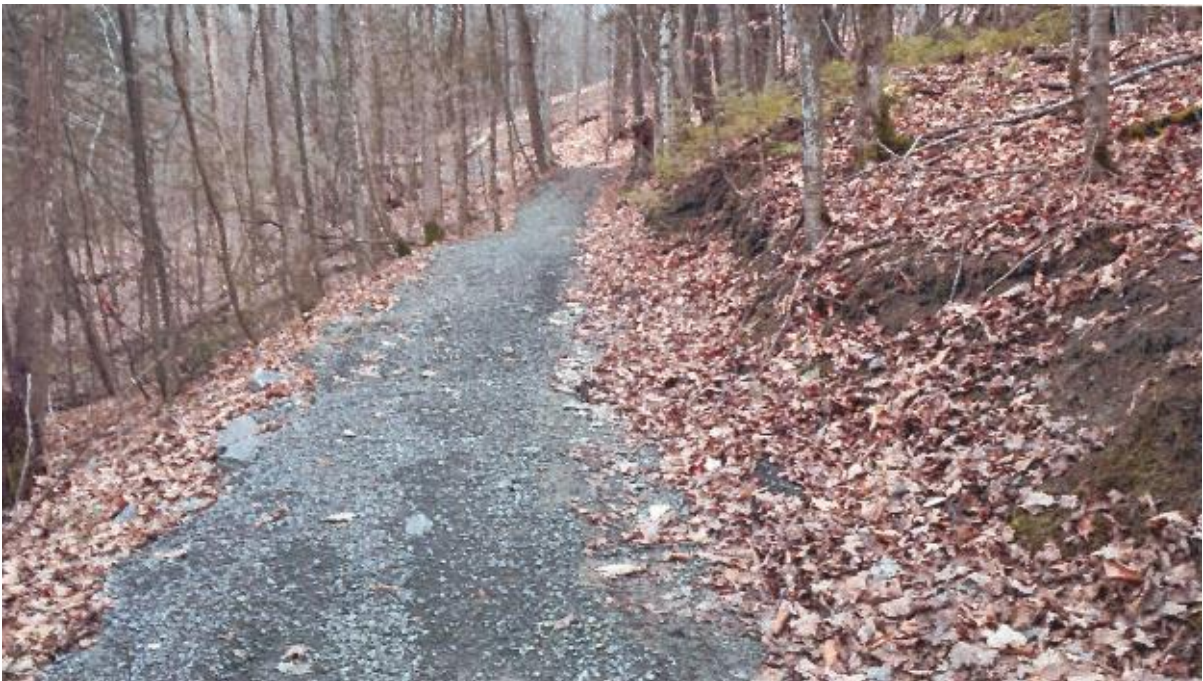
Photo No. 21 – Erosion of cut above pathway. Cut approximately 45 m long x 0.3 m to 0.8 m high.