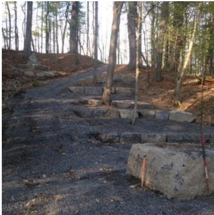
Photo No. 29 – Terraced retaining wall at the Christian Meditation area.