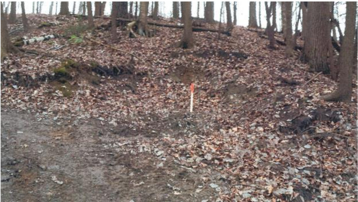
Photo No. 4 – Erosion above pathway. Approximately 3 m deep and 0.6 m to 1.3 m high.