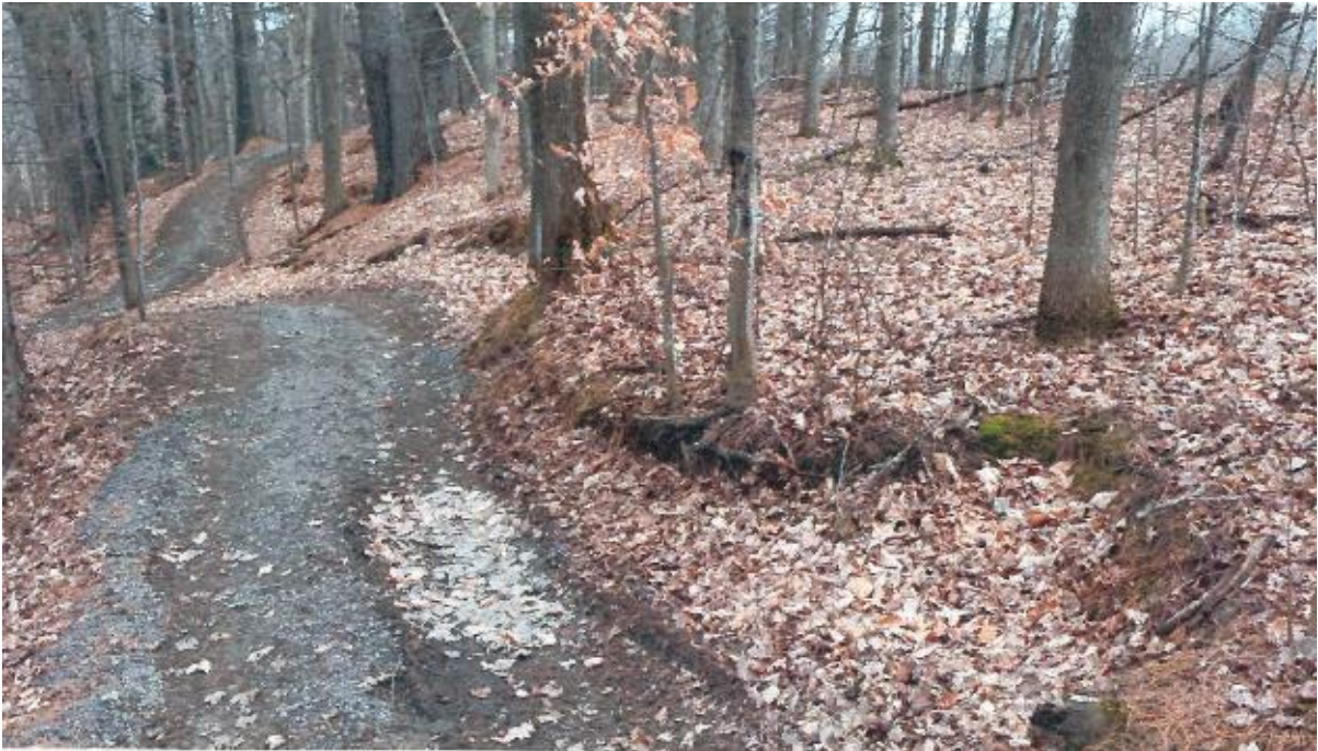
Photo No. 24 – Erosion of cut above pathway. Cut approximately 20 m long x 0.4 m high.