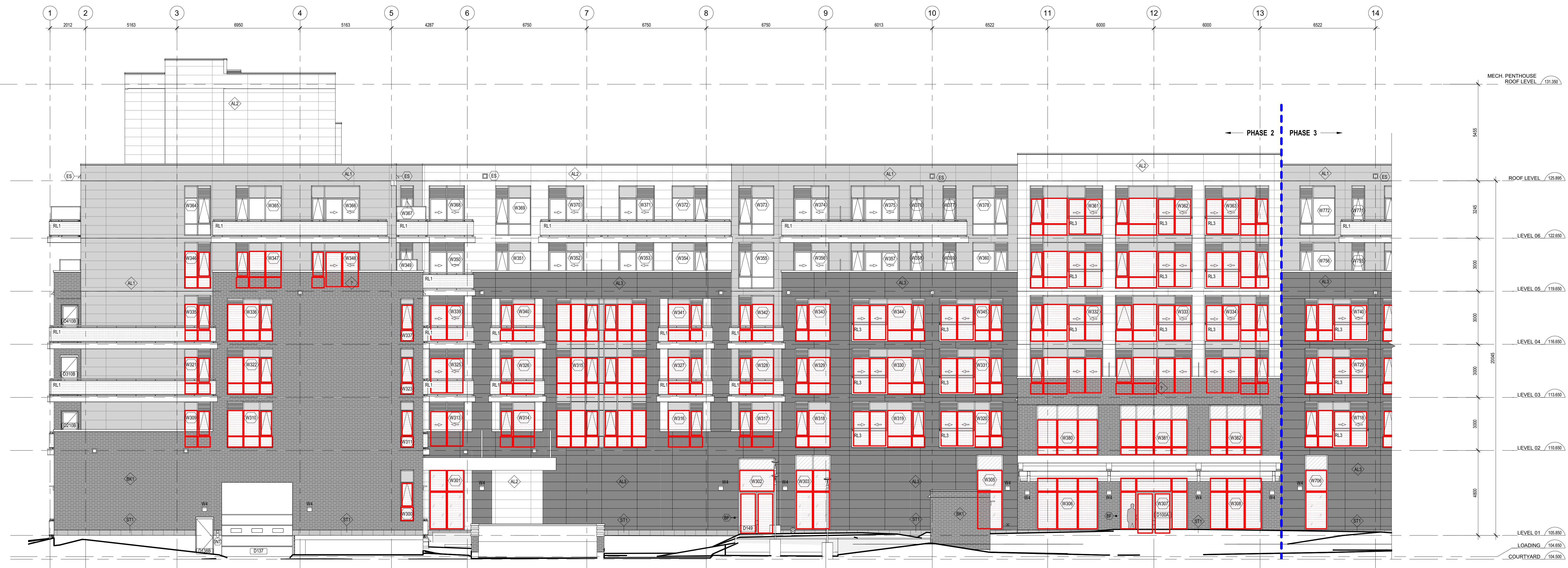
2 WEST BUILDING ELEVATION - PHASE 2 A-200A SCALE 1: 100