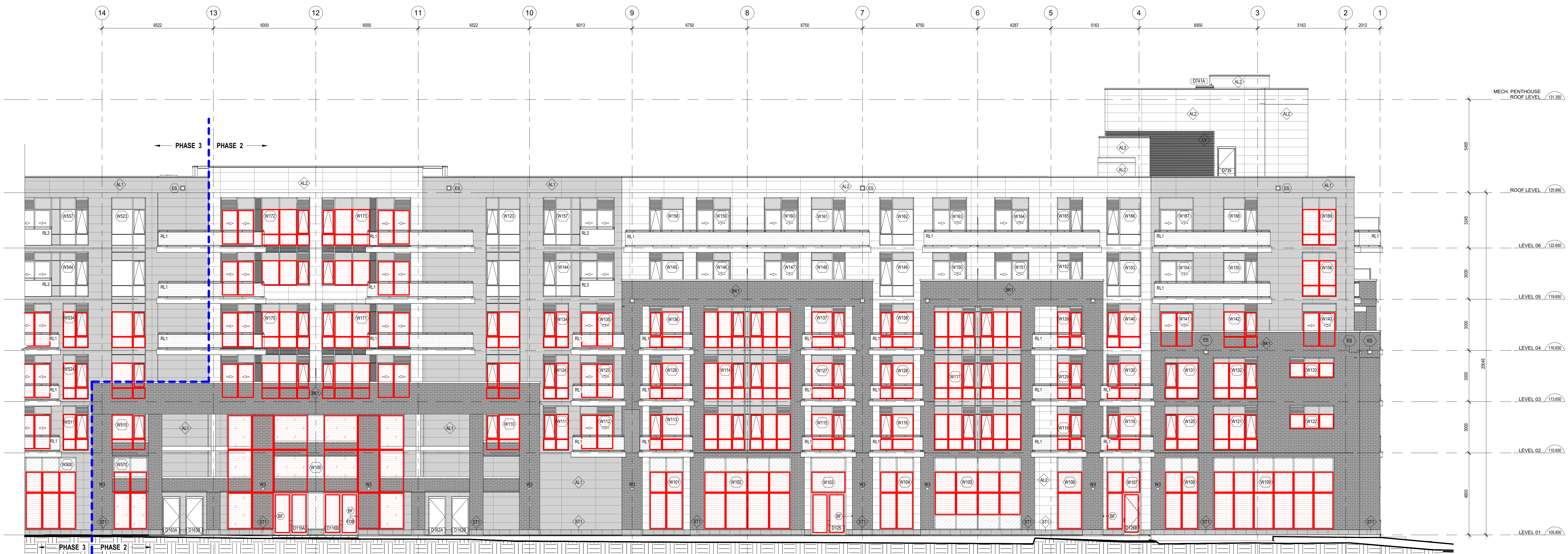
1 EAST BUILDING ELEVATION - PHASE 2 A-200A SCALE 1: 100

NOTE: THIS DRAWING IS THE PROPERTY OF THE ARCHITECT AND MAY NOT BE REPRODUCED OR USED WITHOUT THE EXPRESSED CONSENT OF THE ARCHITECT. THE CONTRACTOR SHALL CHECK AND REPORT ALL DIMENSIONS AND REPORT ANY DISCREPANCIES OR DISCREPANCIES TO THE ARCHITECT BEFORE PROCEEDING WITH THE WORK. DO NOT SCALE THE DRAWINGS RELEASE / REVISION RECORD No. Description Date 1 Issued for Site Plan 18-11-07 2 Issued for Site Plan Update 18-11-20 3 Issued for Site Plan Coordination 20-05-19 4 Issued for Interior Design Coordination 20-10-20 5 Issued for Client Review 21-01-01 6 Issued for Coordination 21-03-04 7 Issued for Coordination 21-11-04 8 Issued for Coordination 21-12-08 9 Issued for Building Permit 21-12-20 10 Issued for Coordination 22-01-28 11 Issued for Coordination 22-02-04 12 Issued for Tender Package 2 22-03-21 13 Issued for Tender Package 2 - Addendum #3 22-04-01 14 Issued for Consultant Coordination 22-08-13 15 Issued for SPC Coordination Meeting 22-08-11 16 Issued for Internal Review 22-08-12 17 Issued for MBE Tender 22-08-19 18 Issued for Reconciliation to Building Permit 22-10-02 19 Issued for SPC Amendment 23-01-16 20 Issued for Coordination 23-02-10 21 Issued for Full Building Permit 23-05-16 22 Issued for Response to SPC Comments 23-06-16 23 Issued for Emergency Windows & Storm Tender 23-08-03 24 Issued for Response to SPC Comments 23-08-01