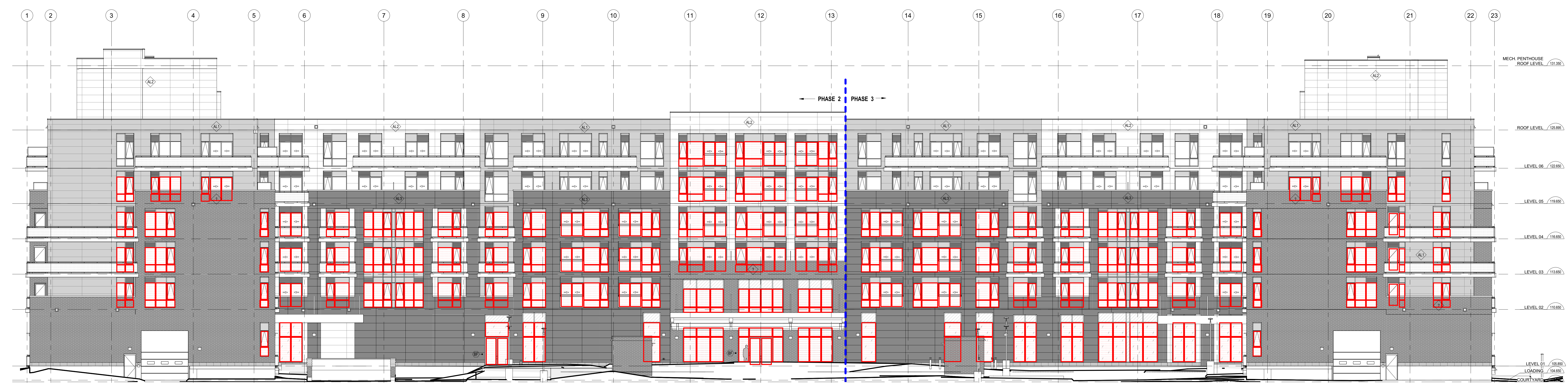
1 WEST BUILDING KEY ELEVATION A-200 SCALE: 1:125

PROJECT NAME WELLINGS OF STITTSVILLE PHASE 2 & 3 20 CEDARHURST COURT, STITTSVILLE, ON PROJECT NO. 19-1784 DRAWN: CG SCALE: As indicated CHECKED: RAC DESIGNED BY: RAC KEY BUILDING ELEVATIONS DATE: 2023.09.01 FILE NO: 2017-23-0008