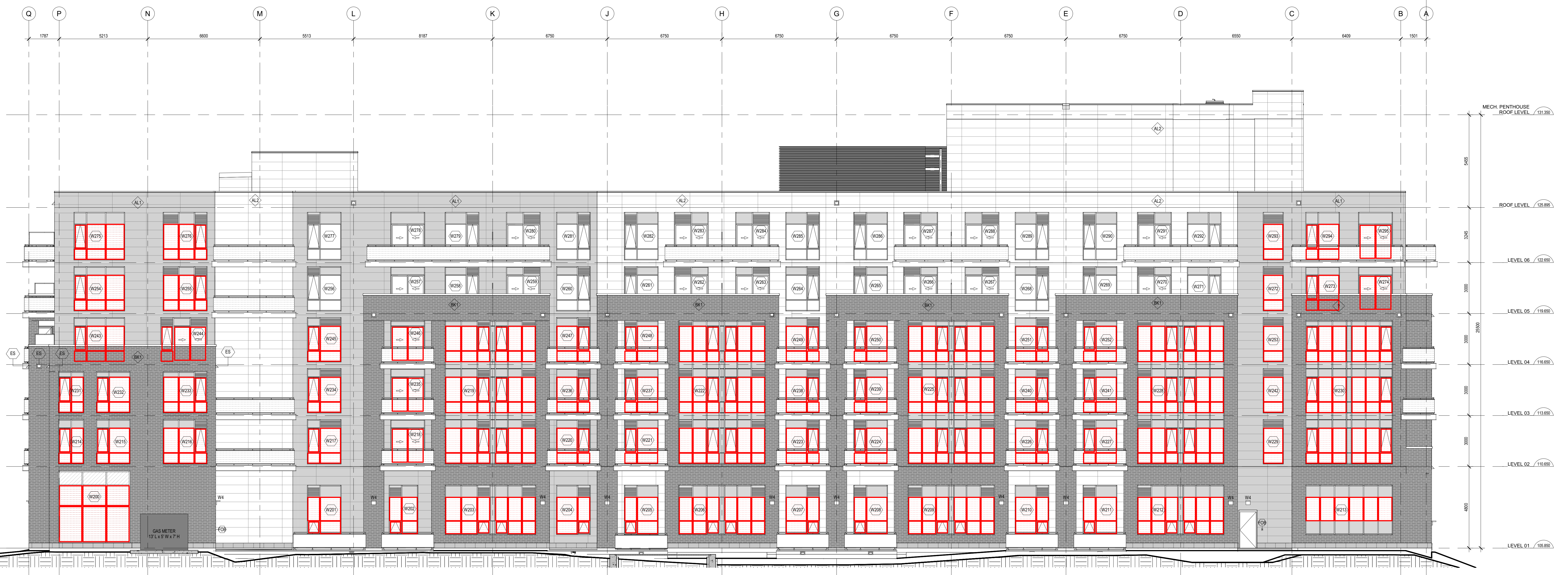
1 NORTH BUILDING ELEVATION - PHASE 2 SCALE 1 : 100