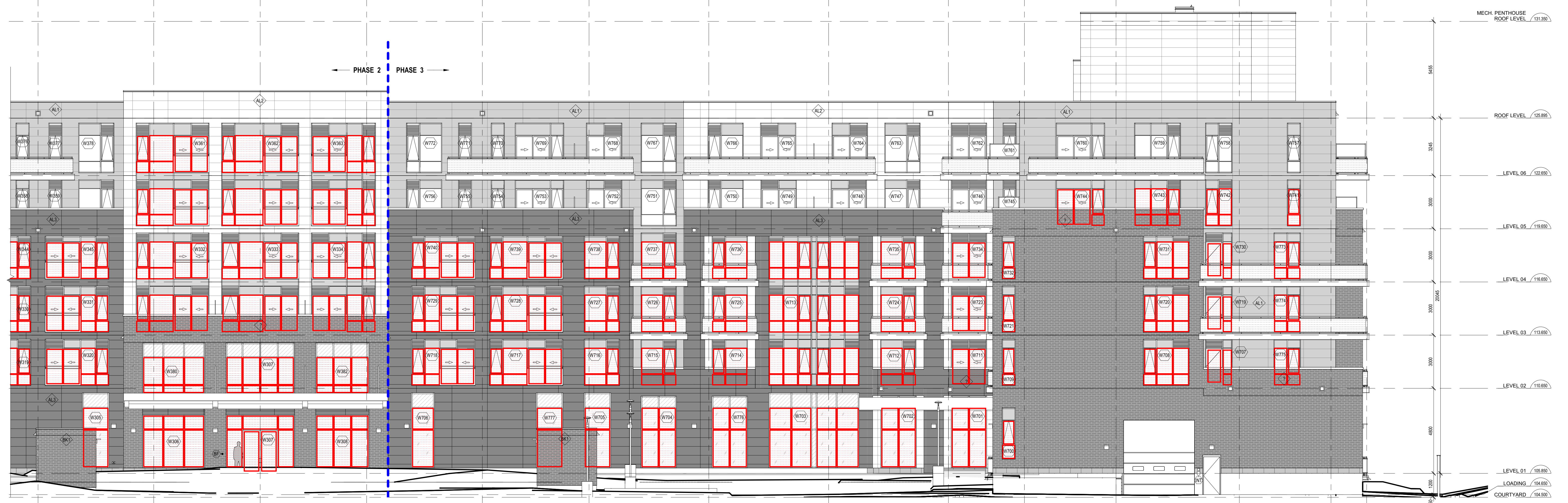
2 WEST BUILDING ELEVATION - PHASE 3 SCALE 1:100