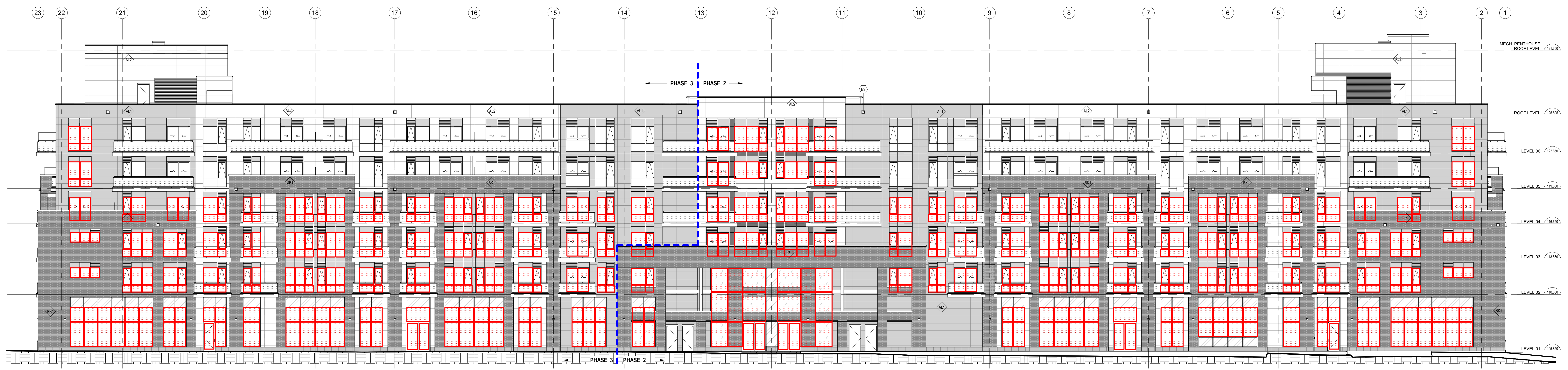
2 EAST BUILDING KEY ELEVATION A-200 SCALE: 1:125