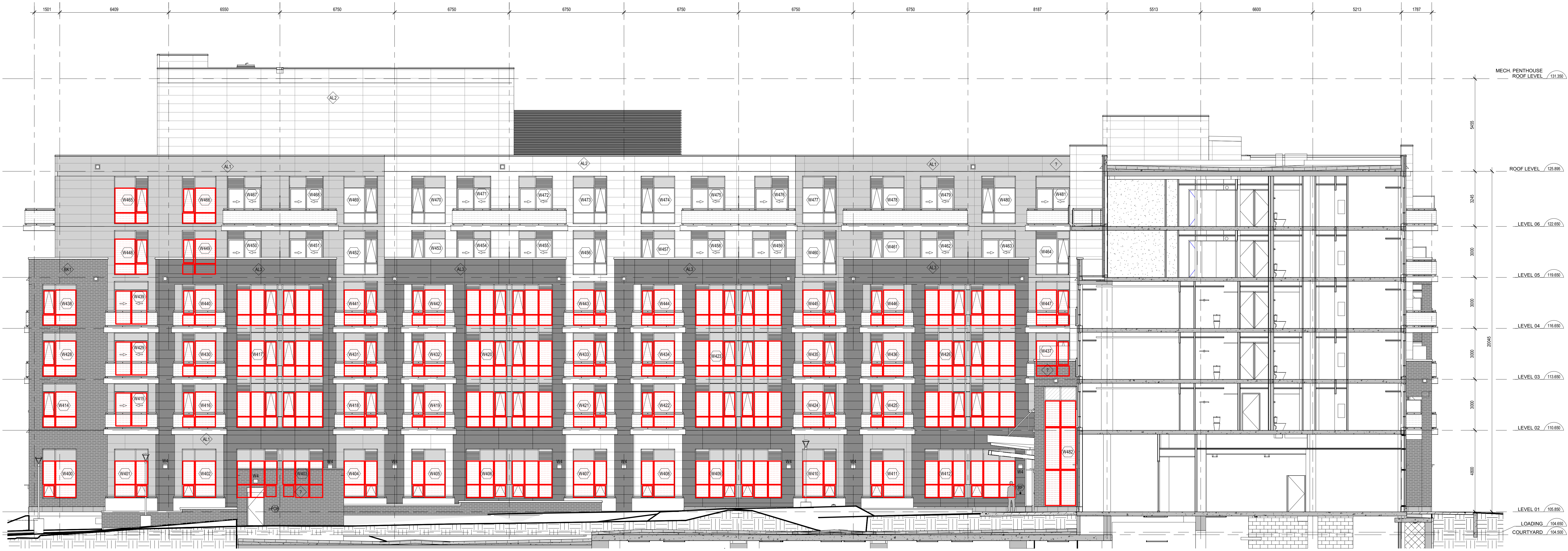
2 SOUTH BUILDING ELEVATION - PHASE 2 SCALE 1 : 100