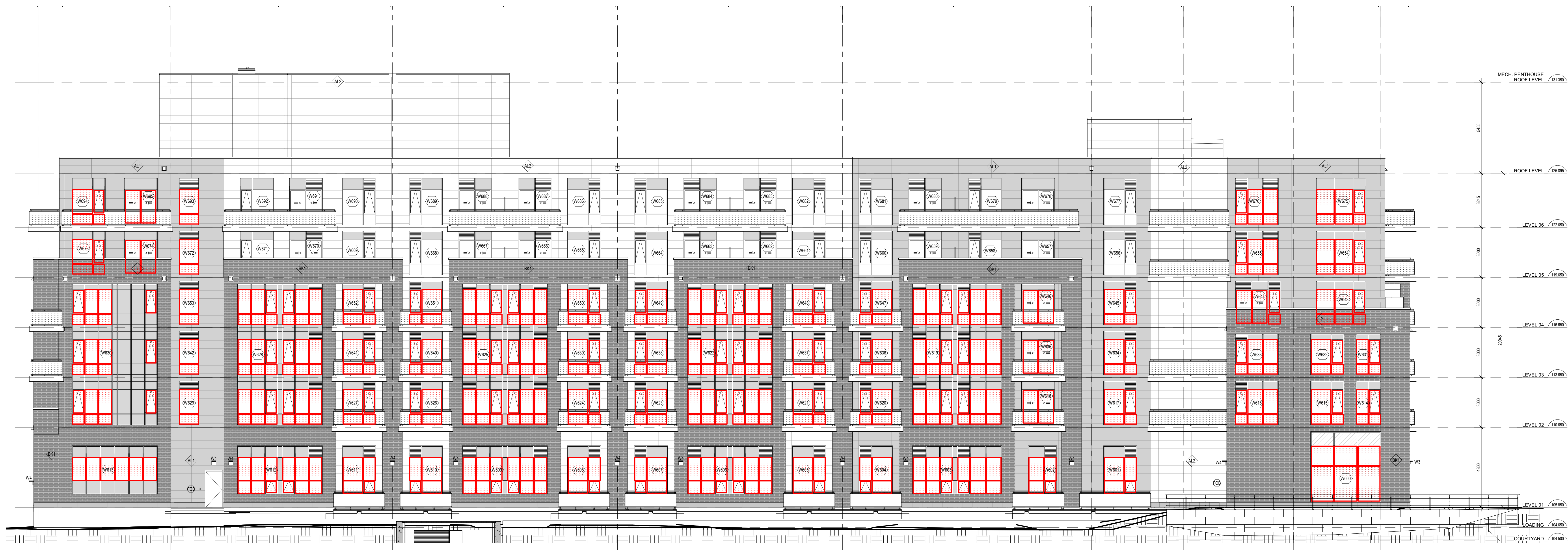
2 SOUTH BUILDING ELEVATION - PHASE 3 A-201B SCALE 1:100