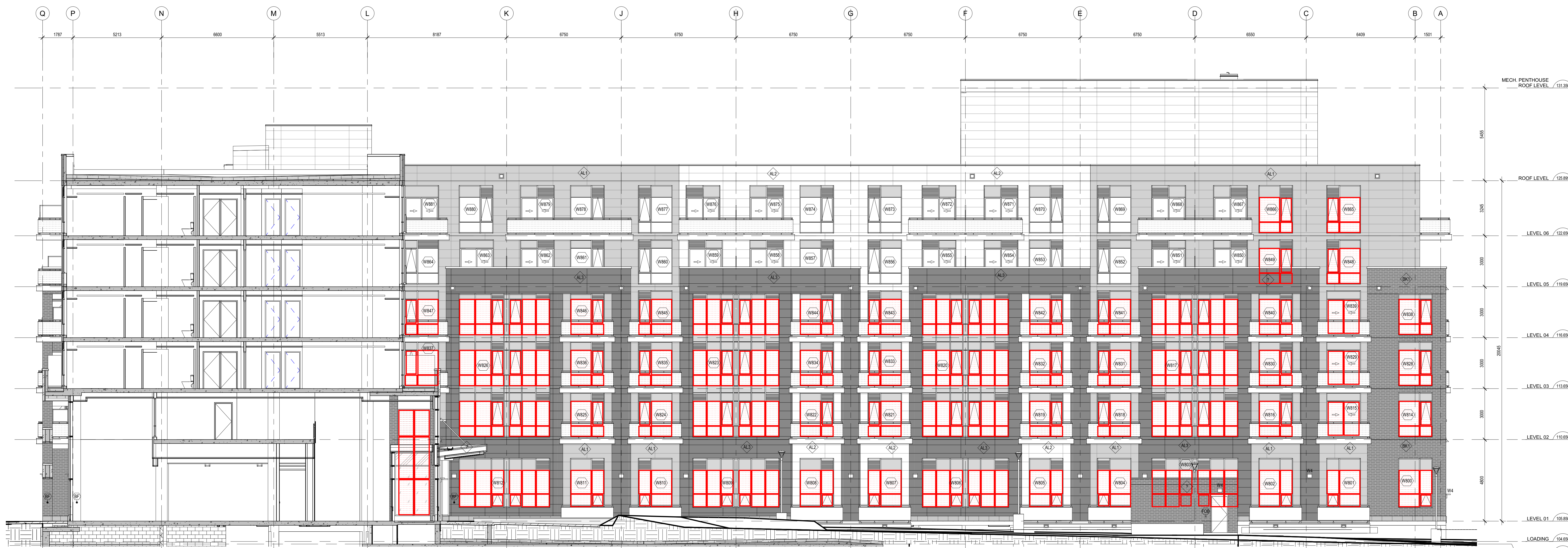
1 NORTH BUILDING SECTIONAL ELEVATION - PHASE 3 A-201B SCALE 1:100