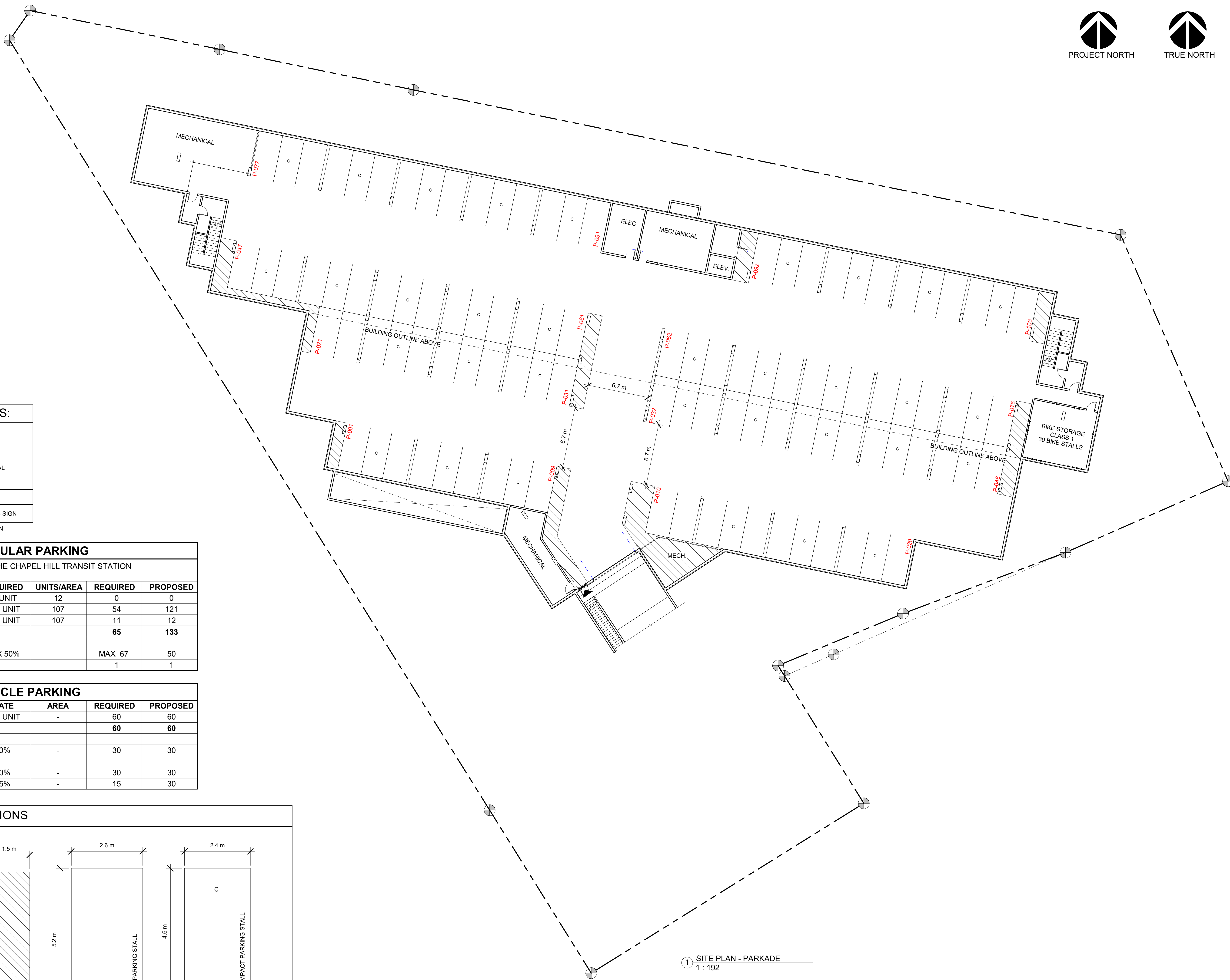
1 SITE PLAN - PARKADE 1 : 192