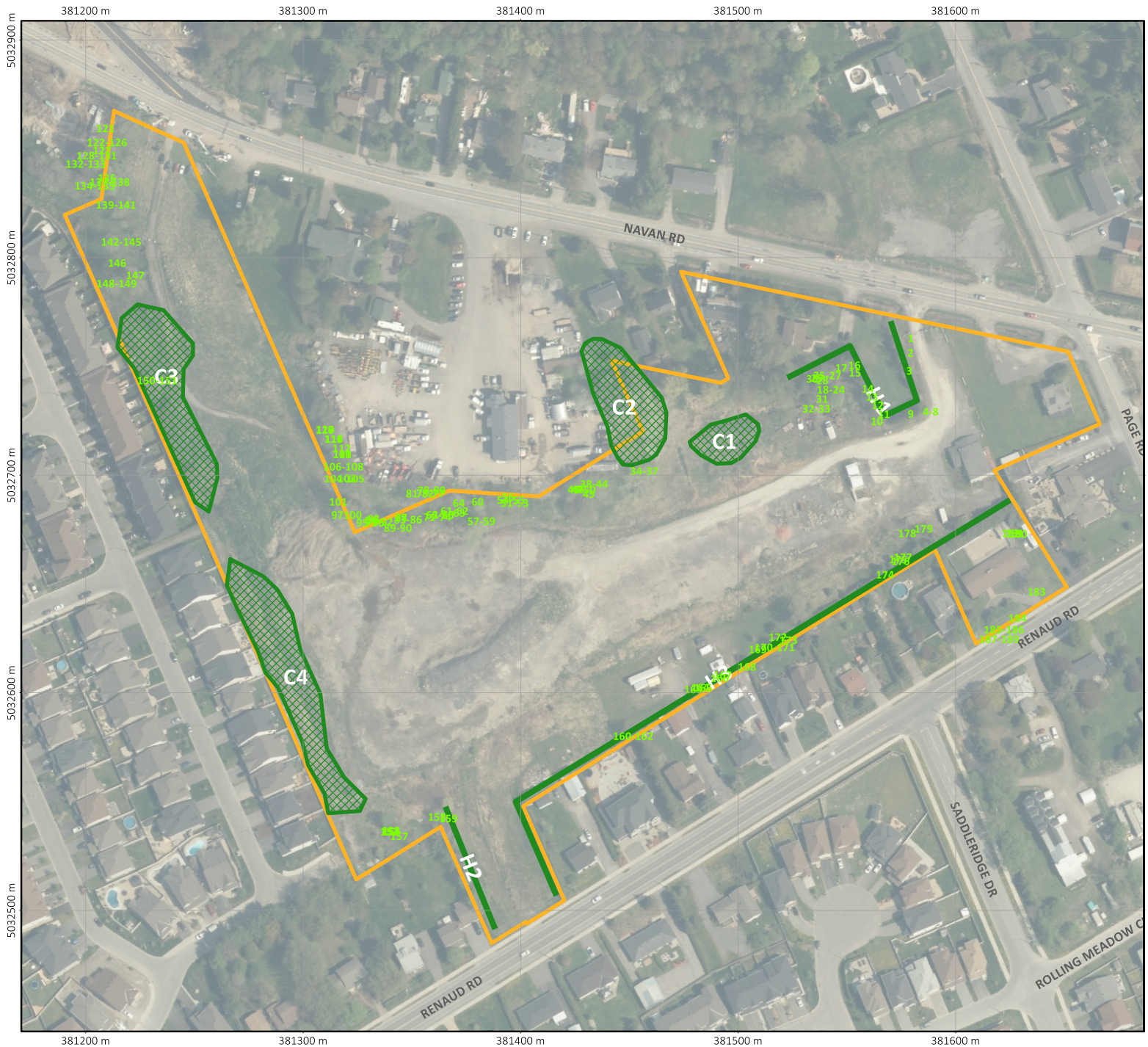
Figure 1 Site Context and Tree Locations