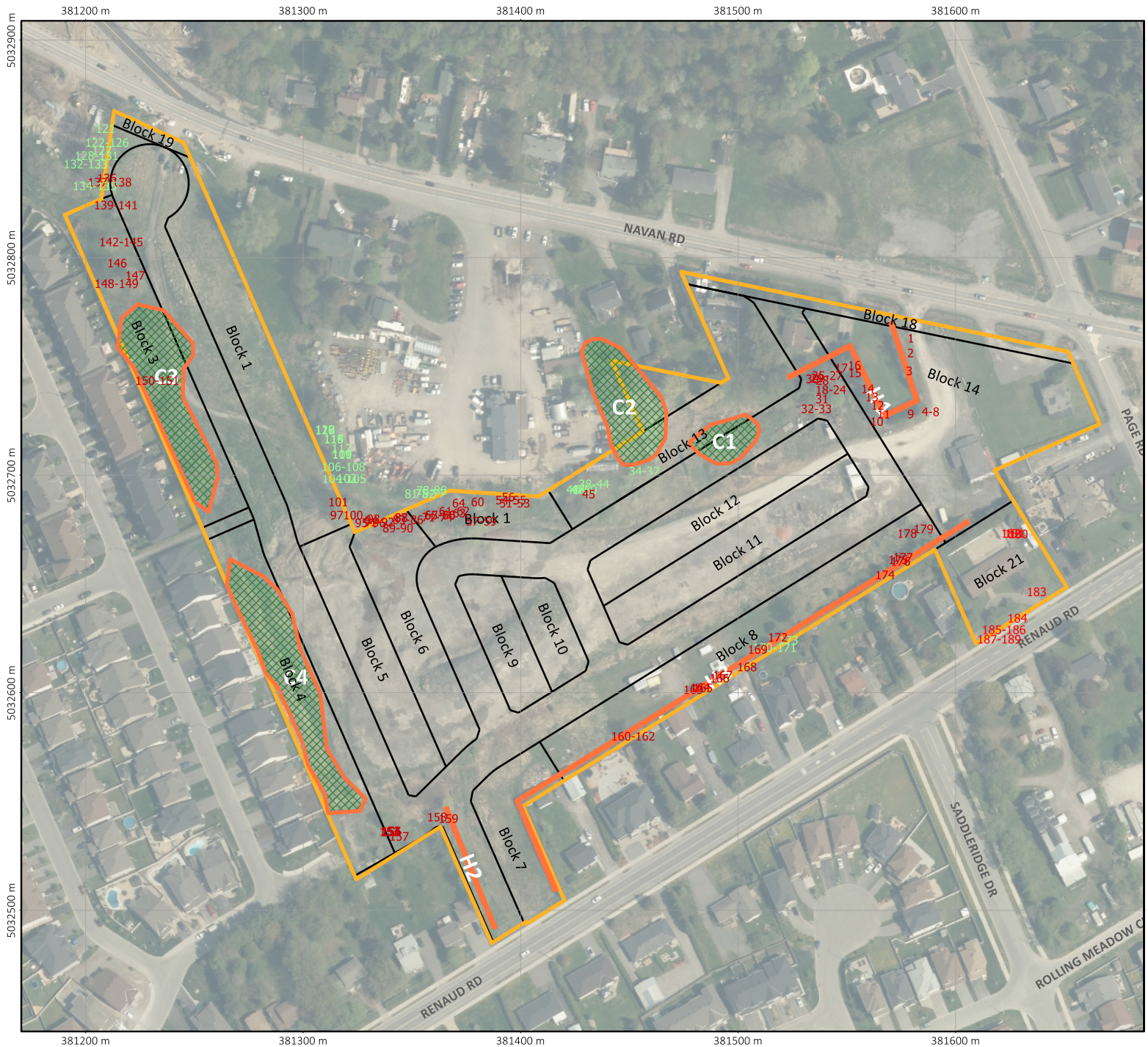
Figure 2 Locations of Trees Relative to the Proposed Development