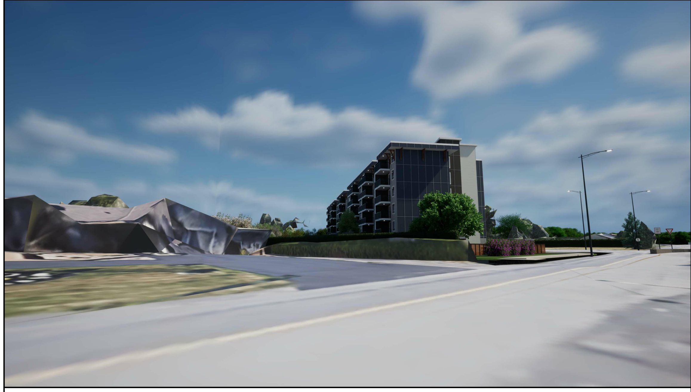
(3) NORTH - WEST VIEW