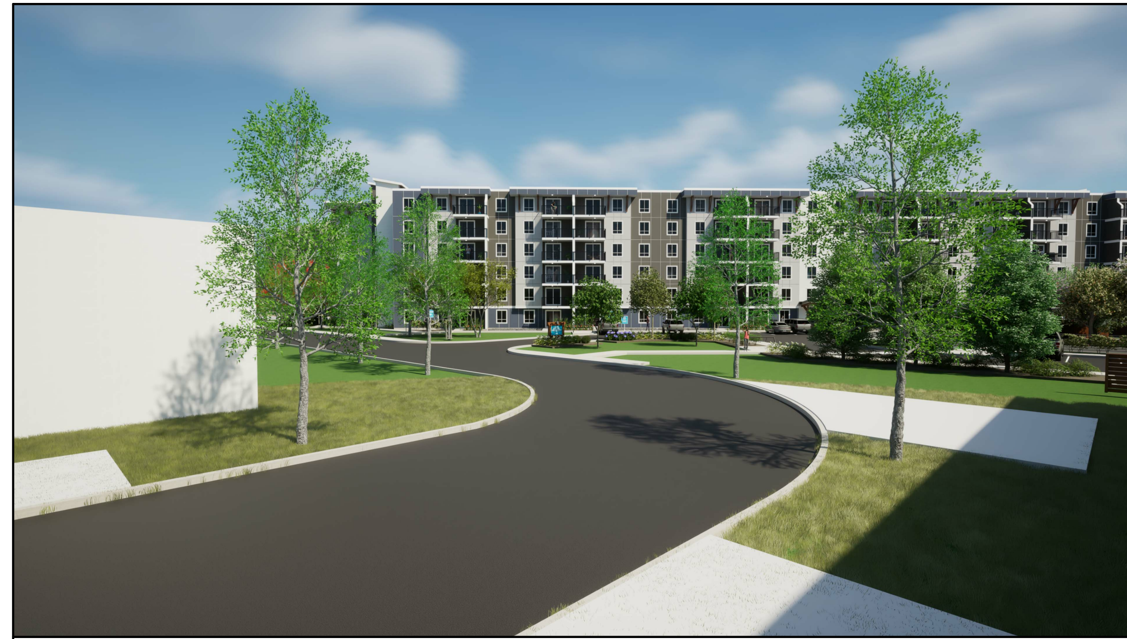
(4) NORTH VIEW