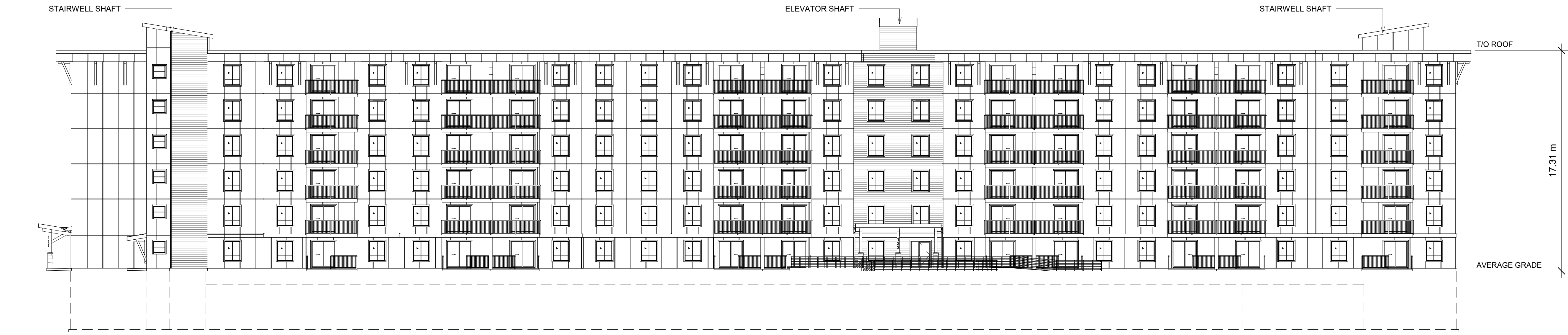
1 NORTH ELEVATION 1 : 175