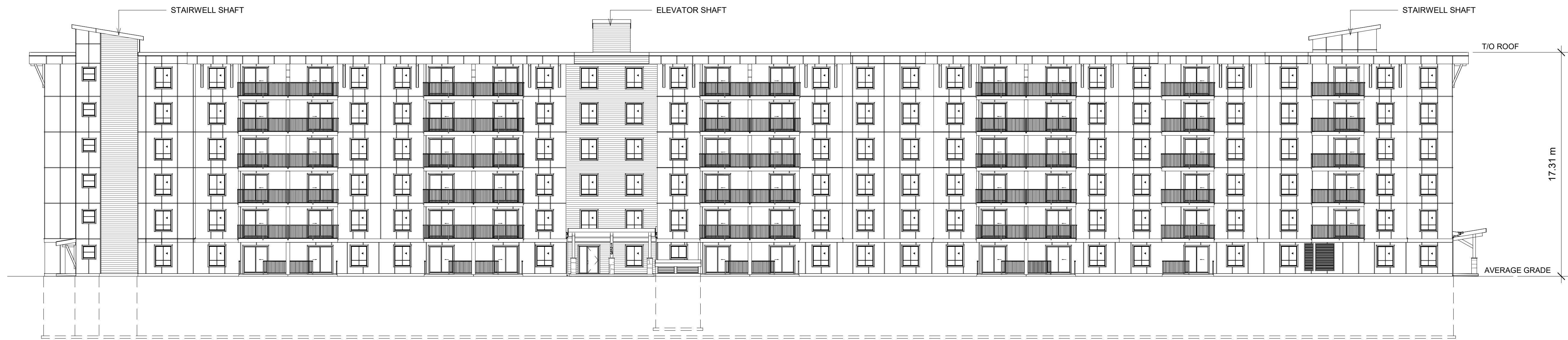
2 SOUTH ELEVATION 1 : 175