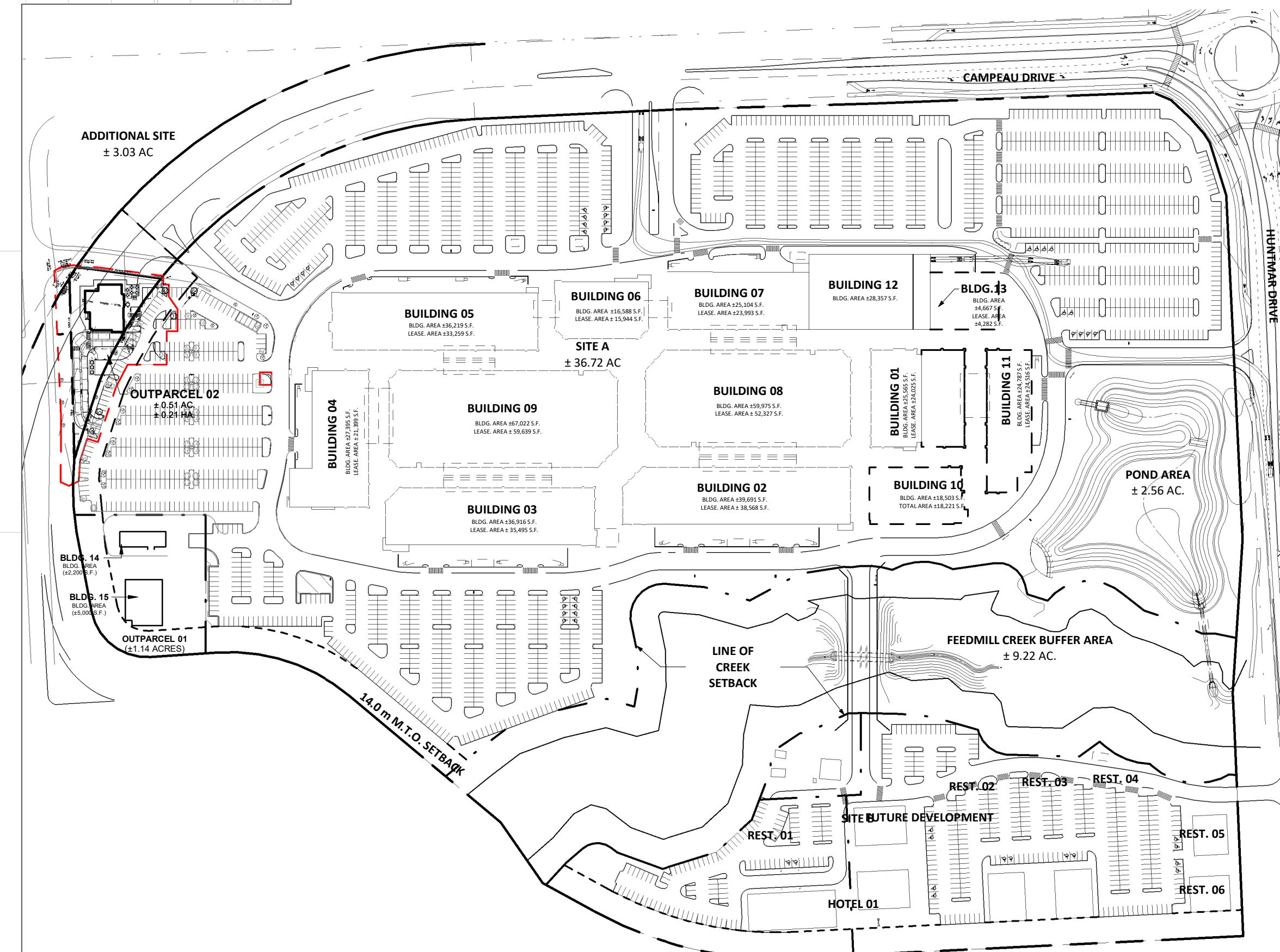
3 OVERALL SITE PLAN A100 1 : 2200