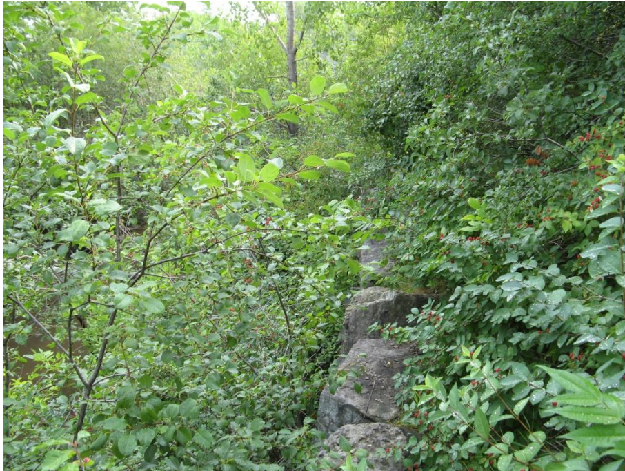
Photo 2 – South side of the Municipal Drain corridor to the north of the site, with large boulder retaining wall. View looking east, with site beginning 7.5 metres from wall