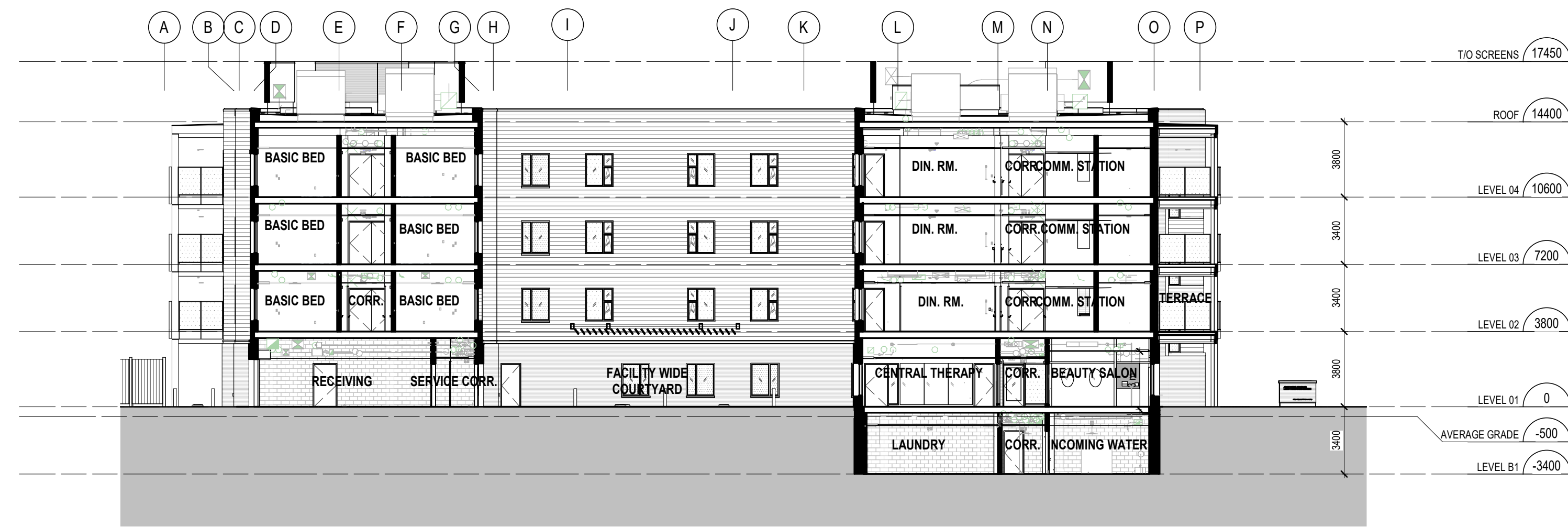
3 BUILDING SECTION - LOOKING NORTH A5.01 1:200