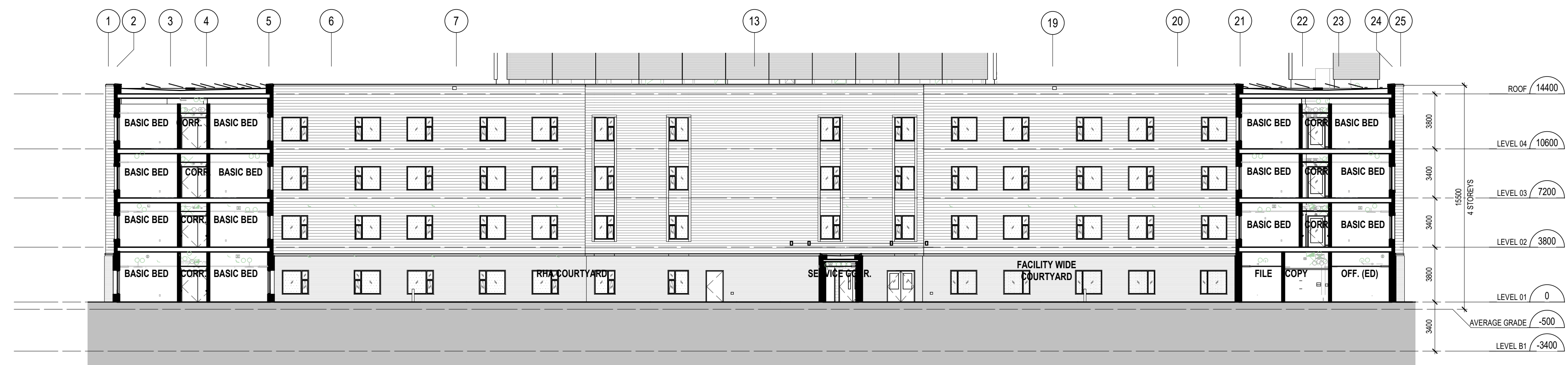
1 BUILDING SECTION - LOOKING EAST A5.01 1:200

G Wildman GERALDINE WILDMAN ACTING MANAGER, DEVELOPMENT REVIEW, EAST PLANNING, REAL ESTATE & ECONOMIC DEVELOPMENT DEPARTMENT, CITY OF OTTAWA