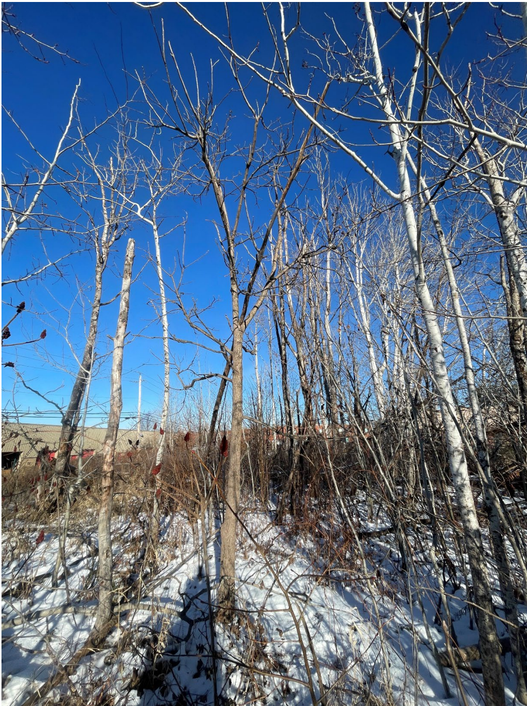
Figure 2: Polygon B, medium sized poplars in the northern section