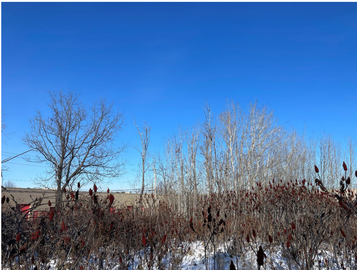
Figure 1: Taken from centre of property looking north. Small poplars in Polygon A on right, and black walnut (tree 7) on left