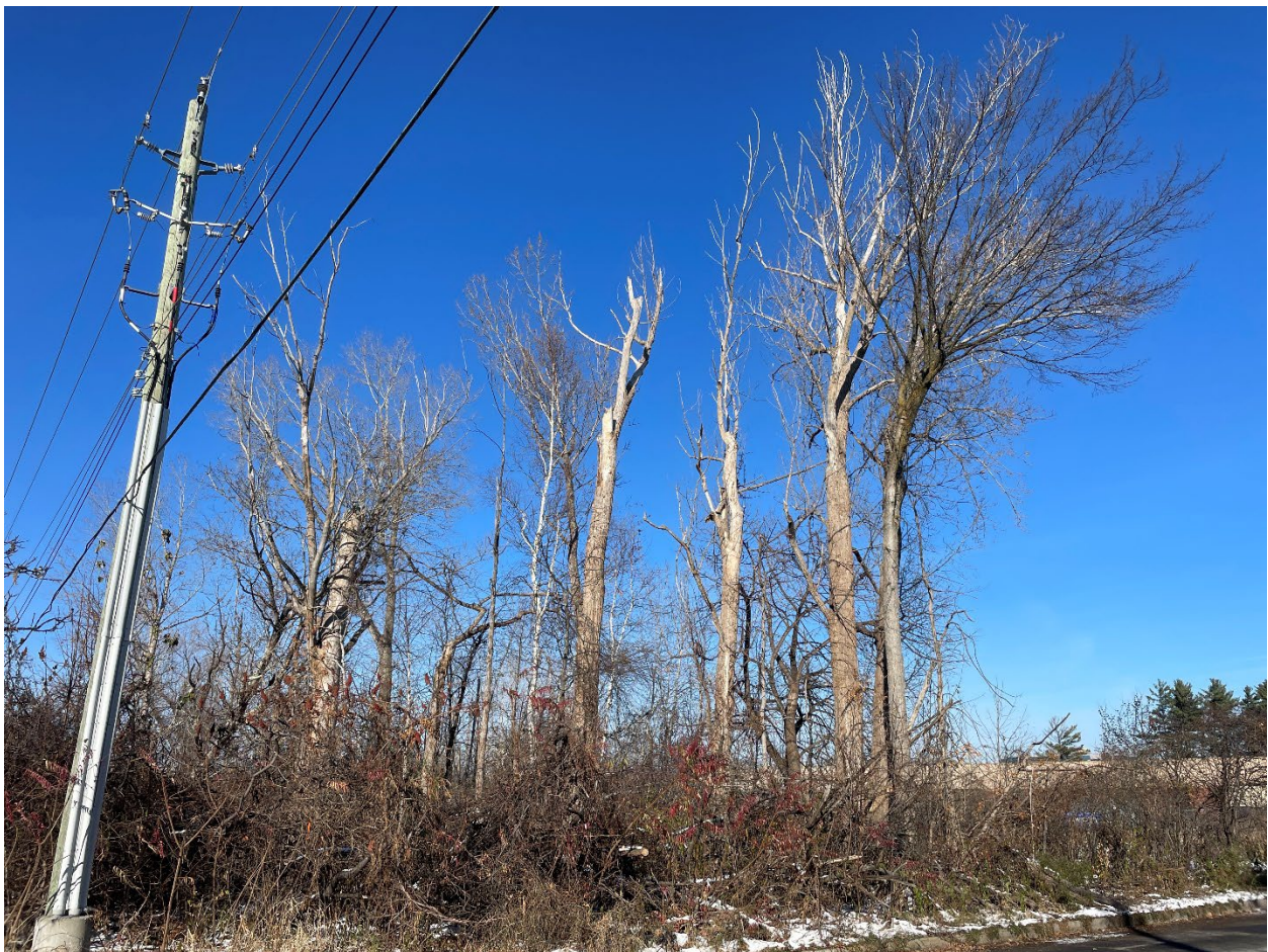
Figure 5: Trees in the southern tip (polygon E) part of the old hedgerow. Elm tree (Tree #1) is on the right