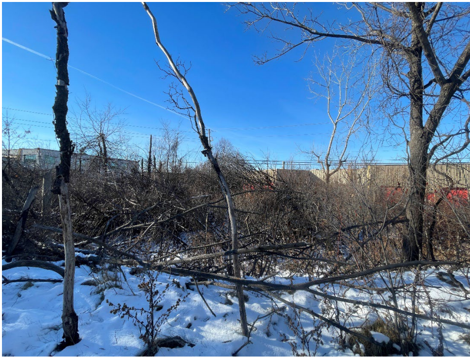
Figure 3: Polygon C - depression with blowdown