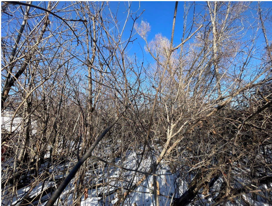
Figure 4: Example of dense thicket in Polygon D