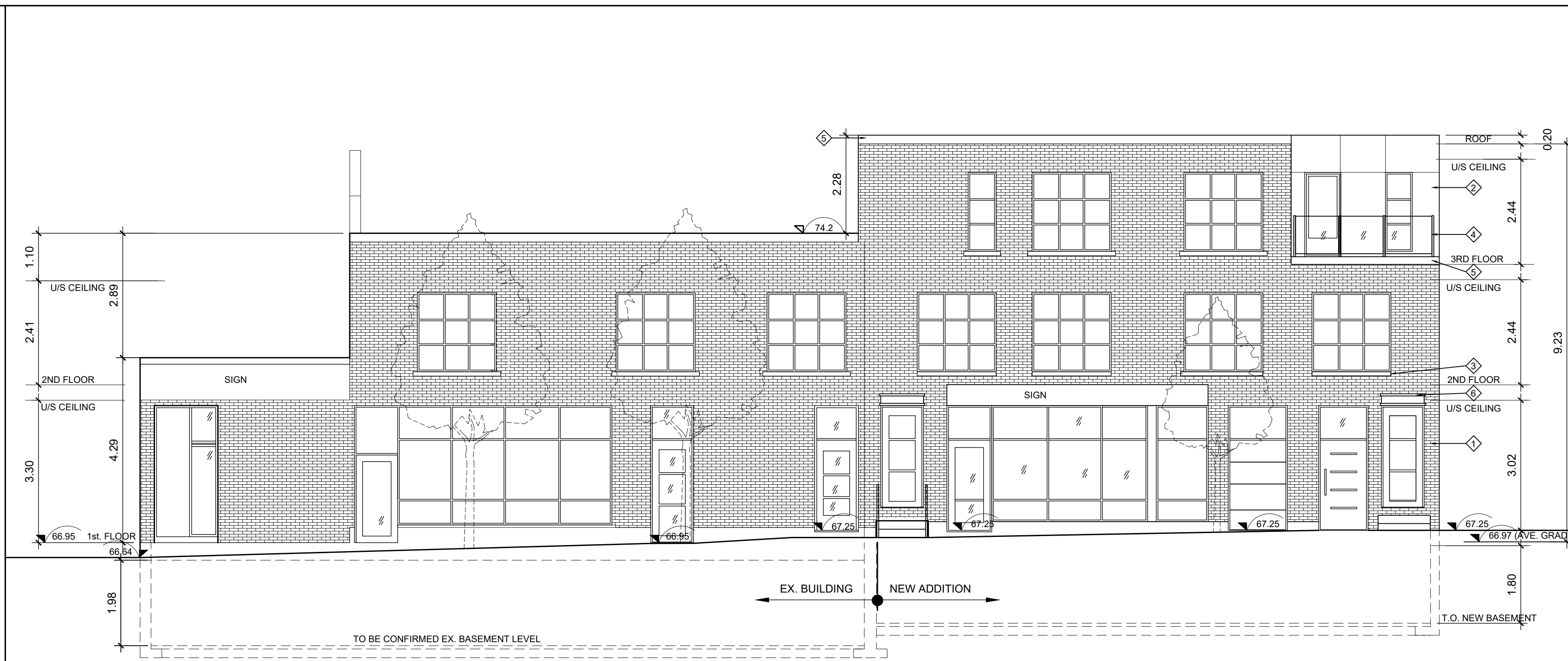
2 EL WEST ELEVATION SCALE: 1/75