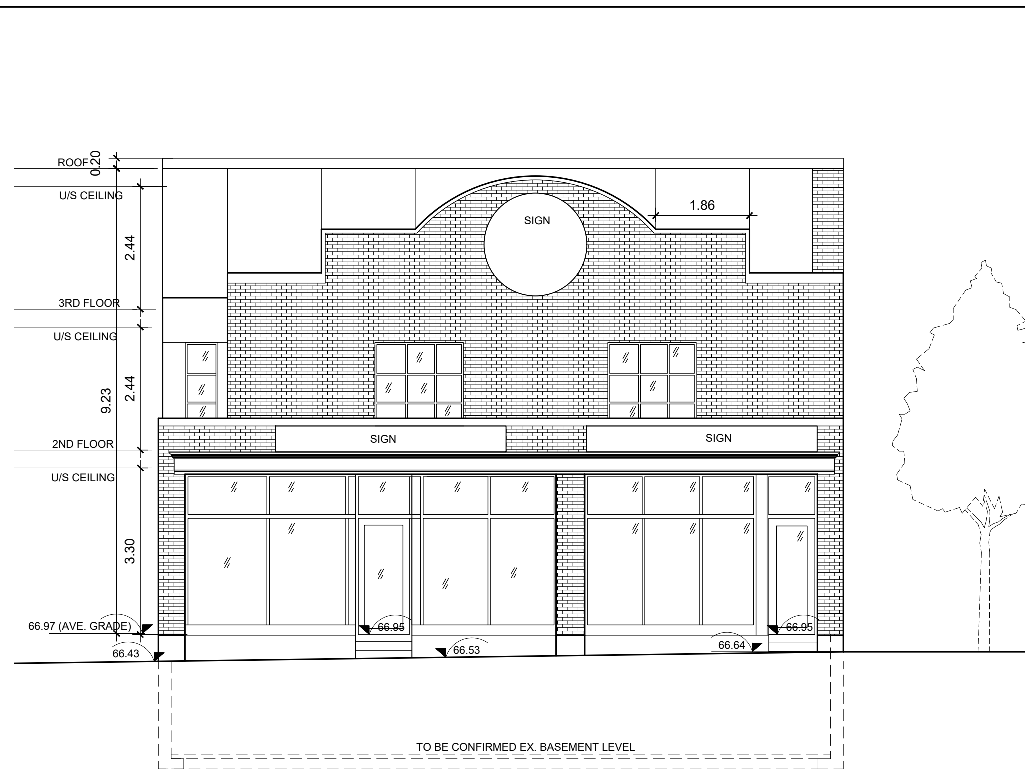
1 EL NORTH ELEVATION SCALE: 1/75