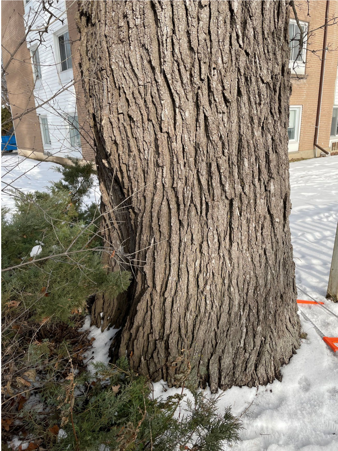
Figure 2: Wound at base of trunk along the west side