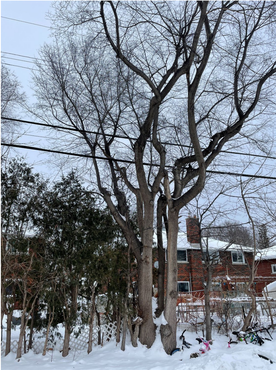
Figure 5: Tree 8, Siberian elm to be retained