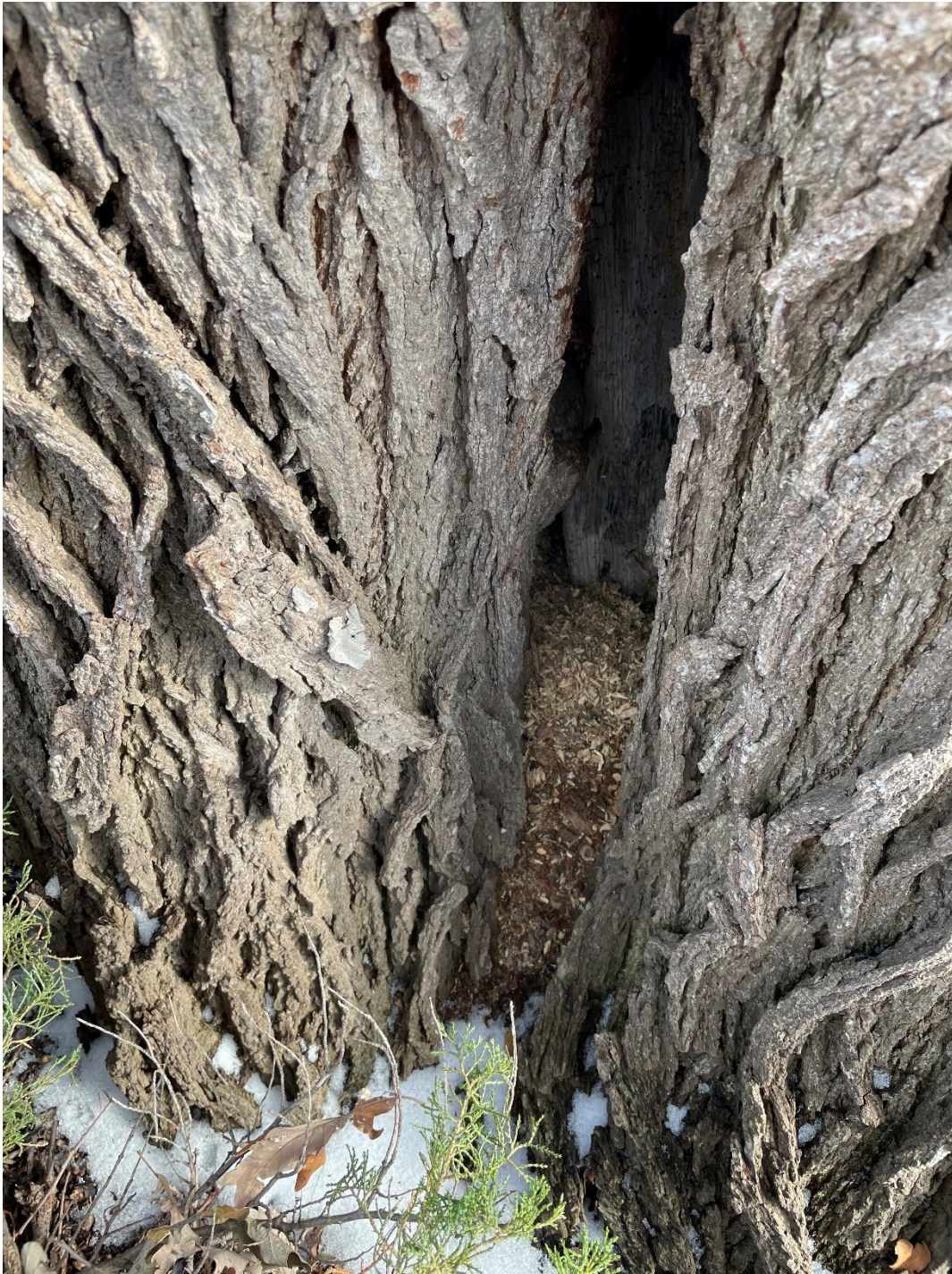
Figure 3: Picture showing cavity. Decay and cavity extend 70 cm into tree