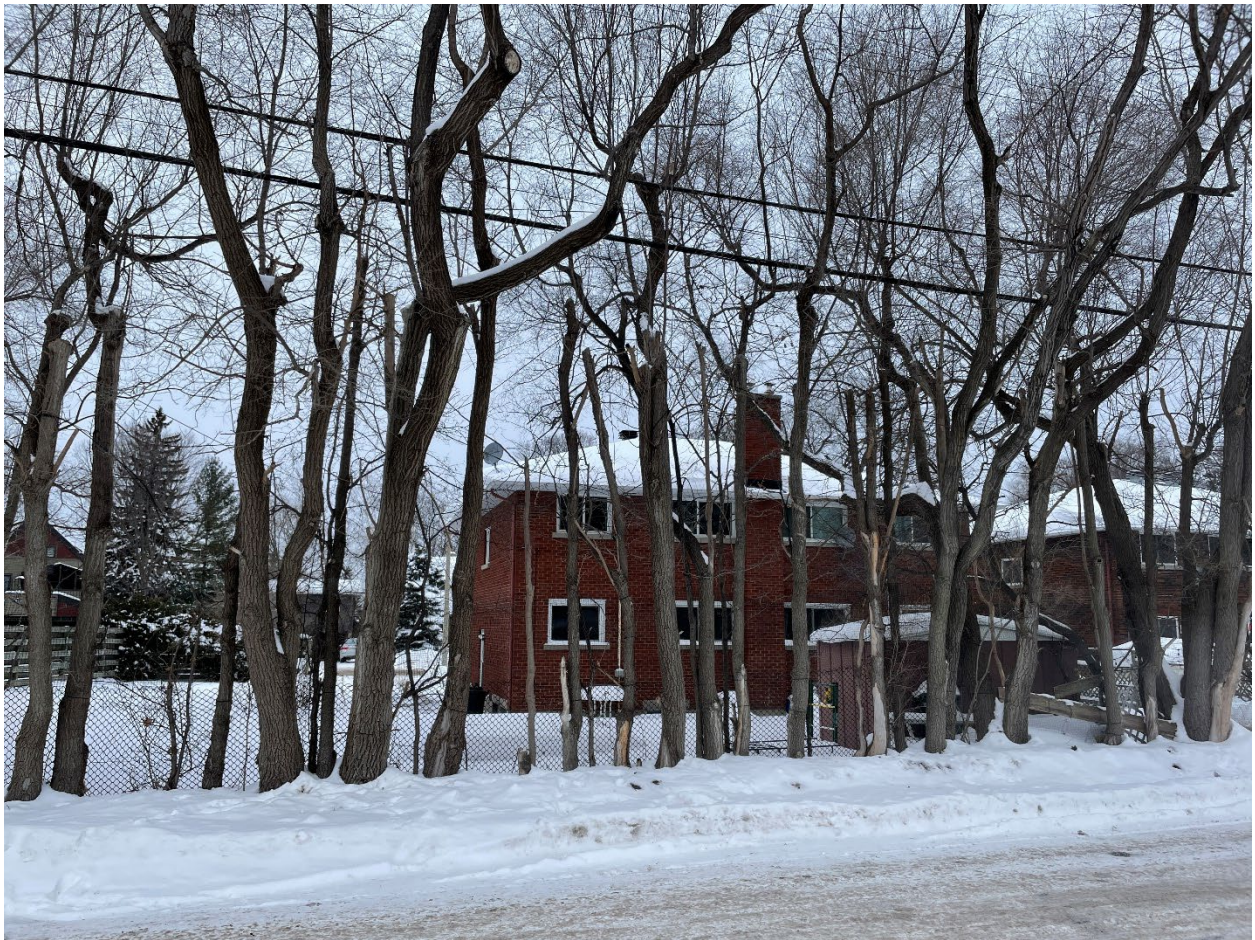
Figure 4: Trees grouping #9 - Siberian elm along northern property line under hydro – to be retained