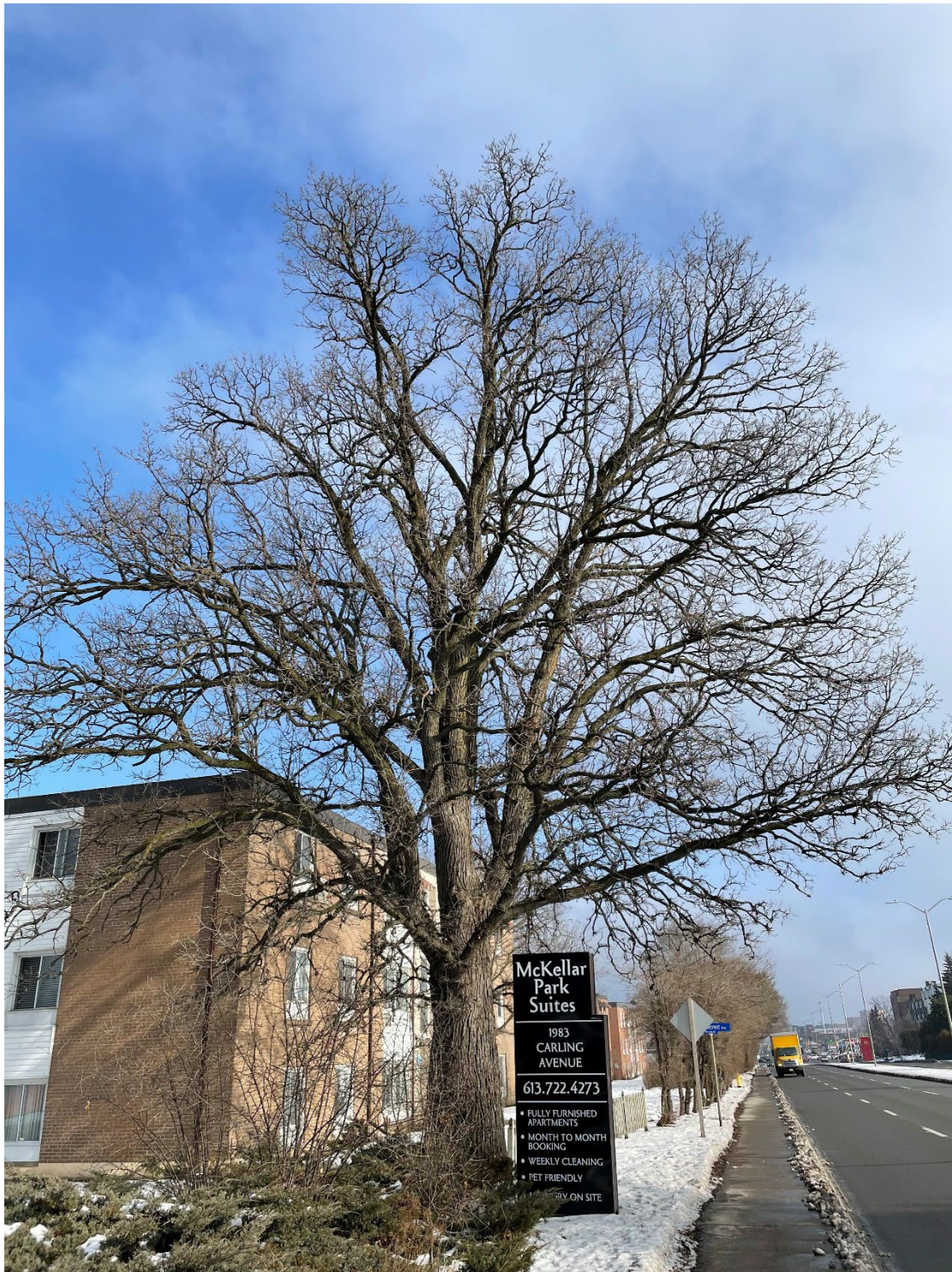
Figure 1: Large bur oak along Carling, facing east