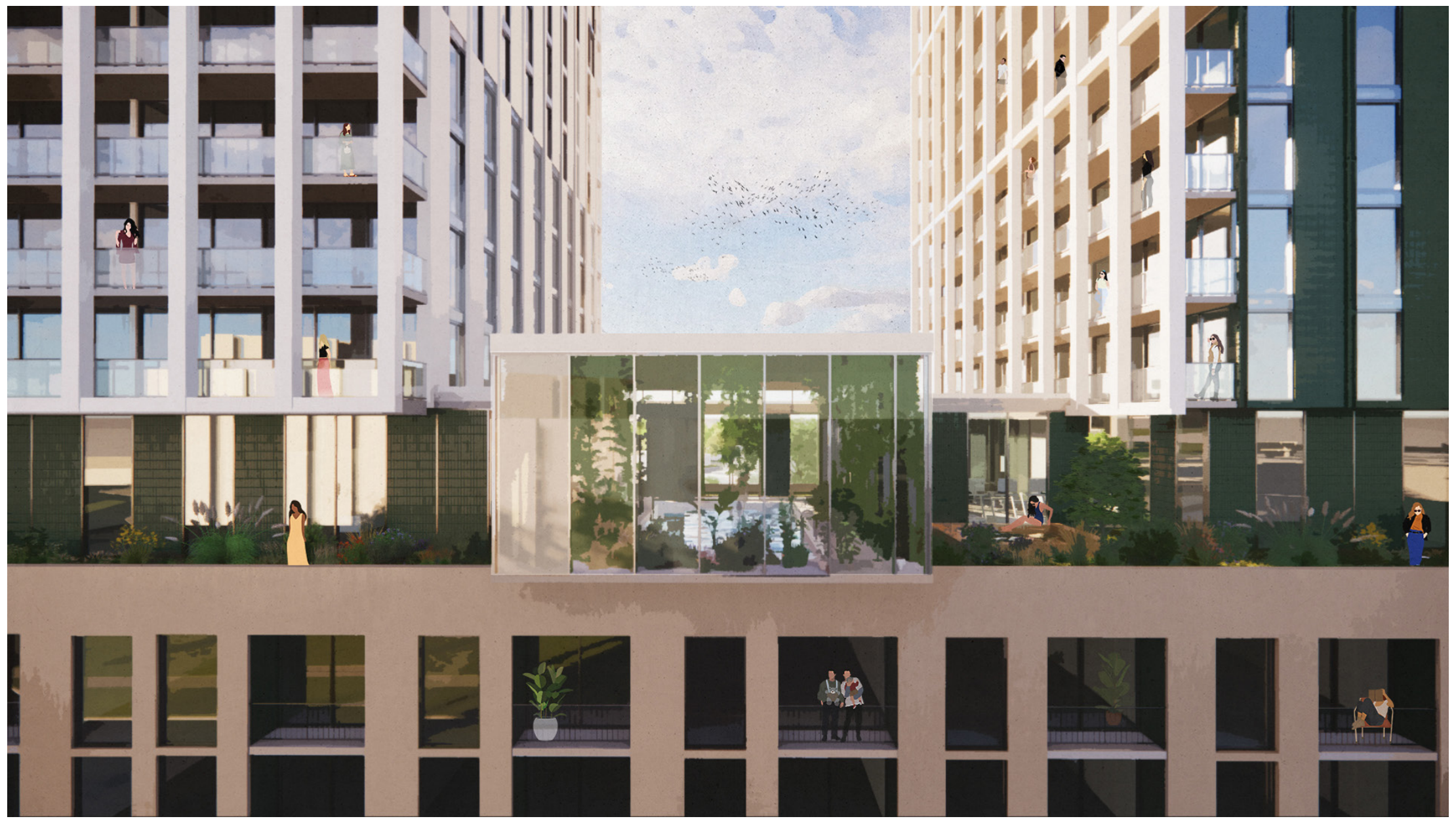
View looking north at the 5th Floor amenity level

The expression of the buildings is characterized by two towers of similar design - with one tower turned 90 degrees from the other to provide both visual interest and to mitigate and improve potential privacy and overlook issues to and from individual residential balconies. The tower balconies are defined by a grid of frames with the balconies on Tower 1 located on the north and south façades while the balconies on Tower 2 are rotated, facing east and west. Inset balconies are provided throughout the podium. The streetwall along Richmond Road will have variations in building material, colour and texture to create visual interest and distinction. Areas of interest will be highlighted by a colourful and similar cladding motif to tie the unique programming elements together. These feat ures include: the retail space fronting the park and main entrance, the swimming pool amenity at the 5th Floor and the Skylounge at the top of Tower 1. The architectural expression at grade enhances the public realm by highlighting the special moments within the building. Materials planned include a variety of masonry textures and colours, along with a lattice-style tower balcony treatment.