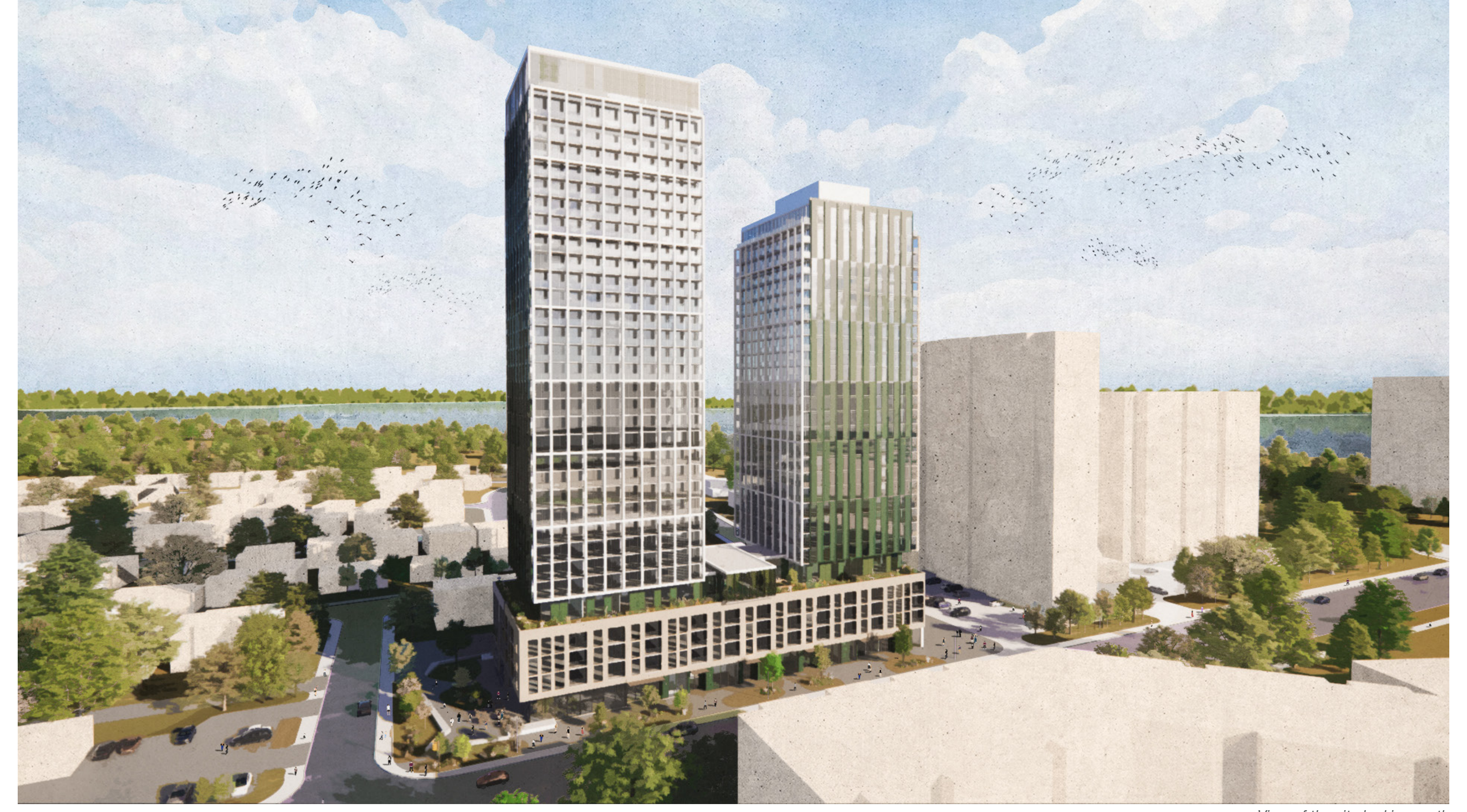
View of the site looking north